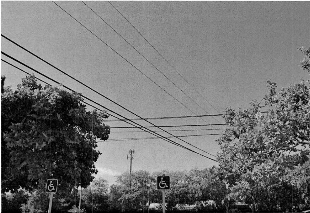
Figure 2: Surewest and light rail line (Northwest)