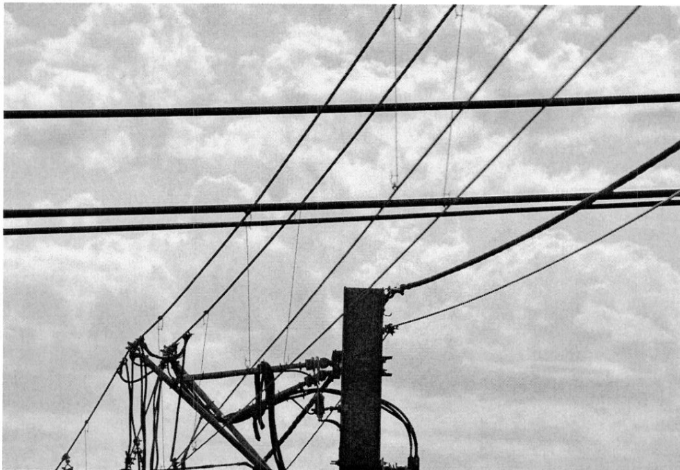
Figure 1: Surewest and light rail lines (West)