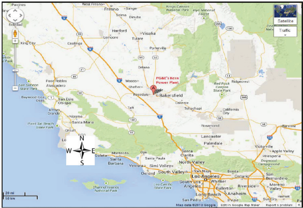
Figure 1: PG&E's Kern Power Plant is located in Bakersfield, California.

Kern is located at 2401 Coffee Road in Bakersfield, Kern County, California. The plant operated from 1948 until PG&E closed the plant in 1985.