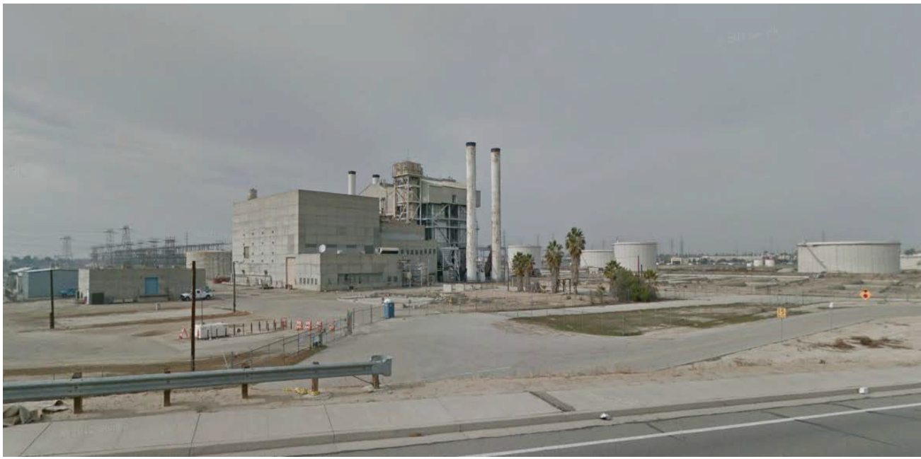
Figure 3: Kern Power Plant as seen from Coffee Road.