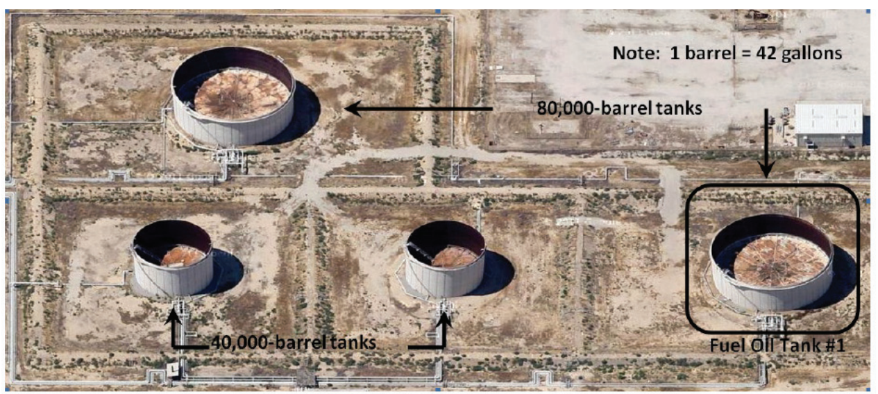
Figure 4: Fuel oil tank farm at Kern Power Plant.

On the following day, workers began to demolish Fuel Oil Tank #1 (Figure 4). The 80,000-barrel tank was approximately 40 feet tall and 120 feet in diameter. From inside the tank, two workers stood on elevated man lifts to torch-cut the top half of the 40-feet-high tank wall in 20-feet-high sections. Once the workers finished a vertical section cut, a third worker in an excavator pushed the top wall section from outside the tank to fold it into the tank, reducing the tank section height by half (Figure 5).