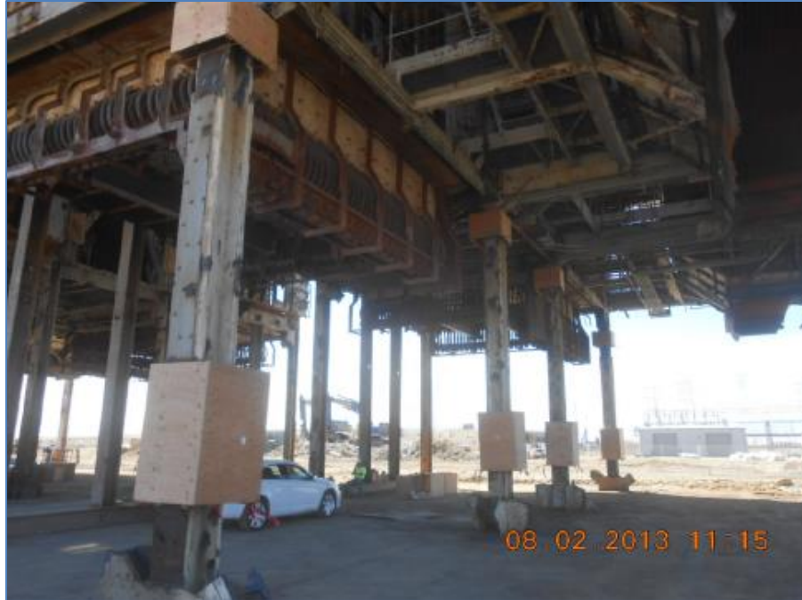
Photo 6: Plywood boxes installed over LSC and kicker charge to contain flying debris.

And finally, Demtech failed to consult an engineer or use computer modeling to simulate the implosion. A structural or metallurgical engineer could have offered crucial insights regarding the structural integrity or mechanical properties of the support columns, which Demtech could have used to change or at least scrutinize its implosion design. However, Demtech failed to confer with subject matter experts, and further failed to use computer modeling tools that are widely available to simulate and validate its implosion design.