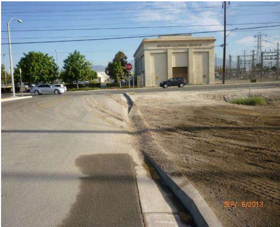
Figure 9: Track out greater than 25 feet in length observed on Segment 8 from Tower M0-T3 onto Ayala Park driveway and west onto Edison Avenue (Photo courtesy of SCE's Field Reporting Environmental Database).