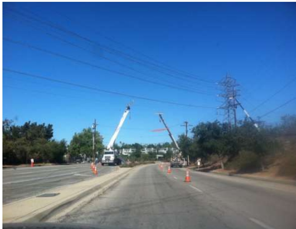
Figure 6: Wire stringing activities on Segment 11B.