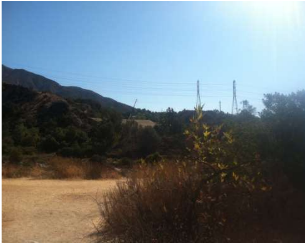
Figure 5: Wire stringing activities on Segment 11B.