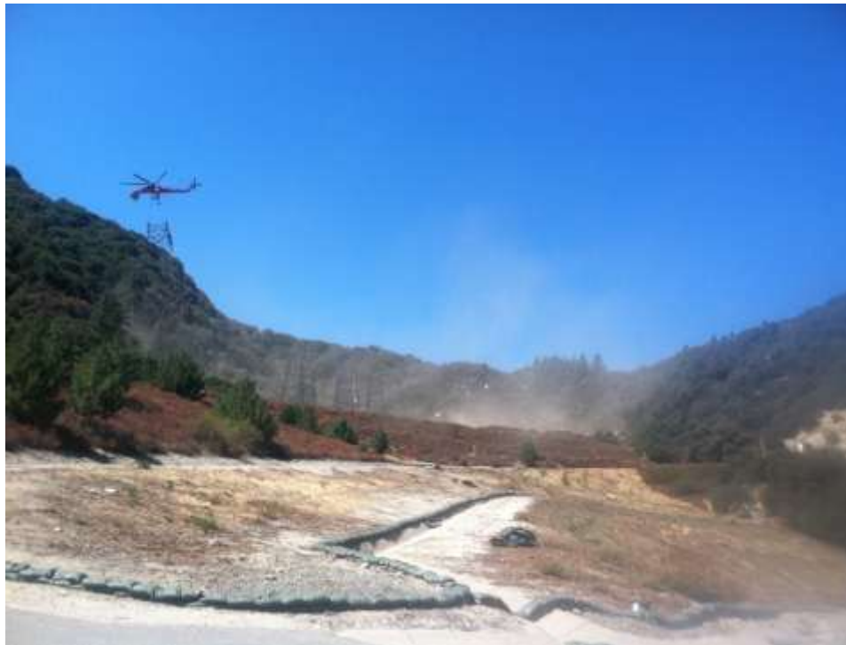
Figure 2: Air Crane tower erection activities at Cogswell Dam HAY on Segment 6.