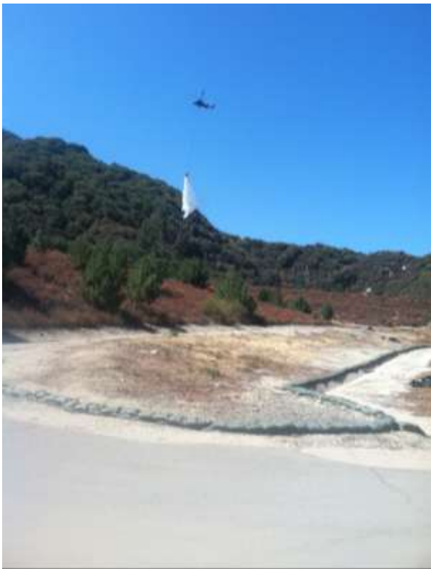
Figure 3: Dust suppression activities via helicopter during Air Crane activities at Cogswell Dam HAY on Segment 6