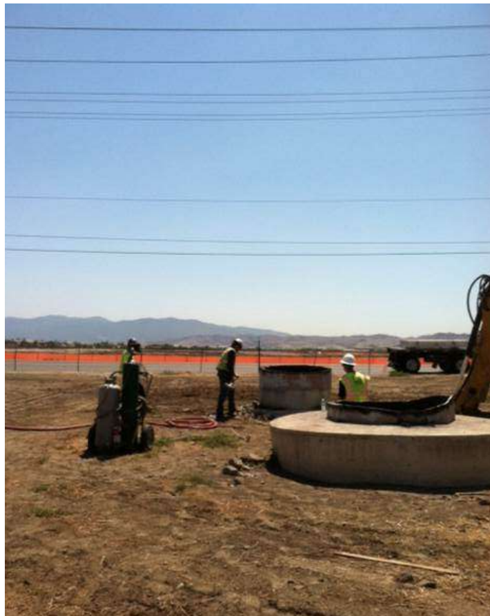
Figure 7: Foundation excavation on Segment 8 Tower M5-T4.