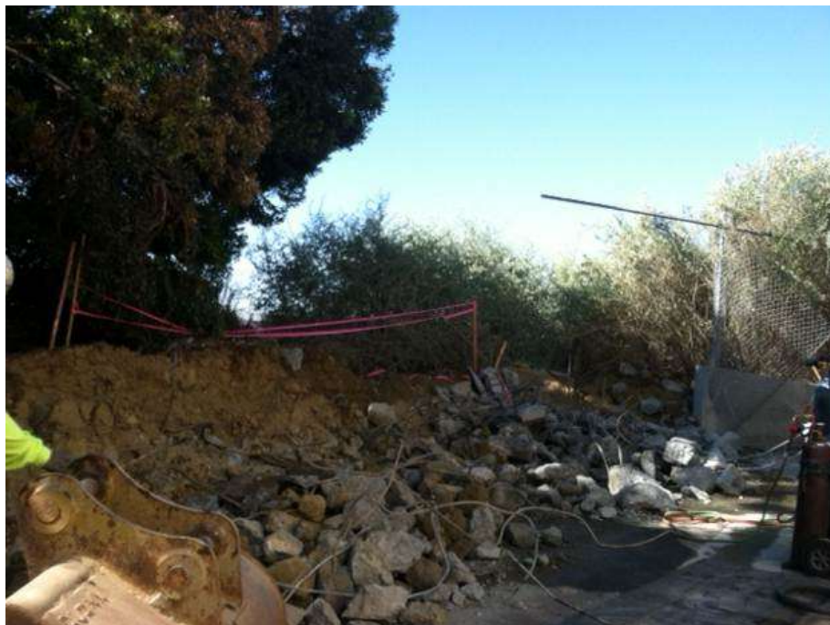
Figure 8: Concrete wall demolition to prepare for the grading of the access road on Segment 8 Tower M44-T3.