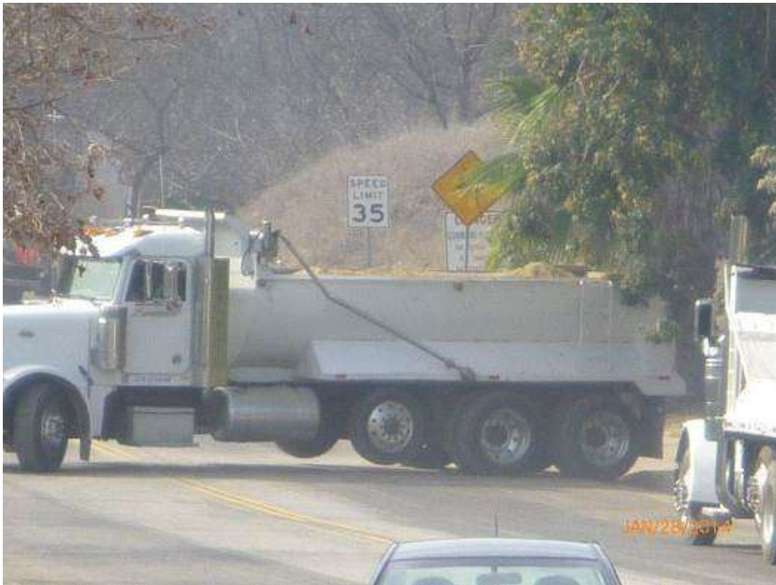
Figure 7: Dump truck observed leaving the ROW near Fullerton Road without proper load cover.