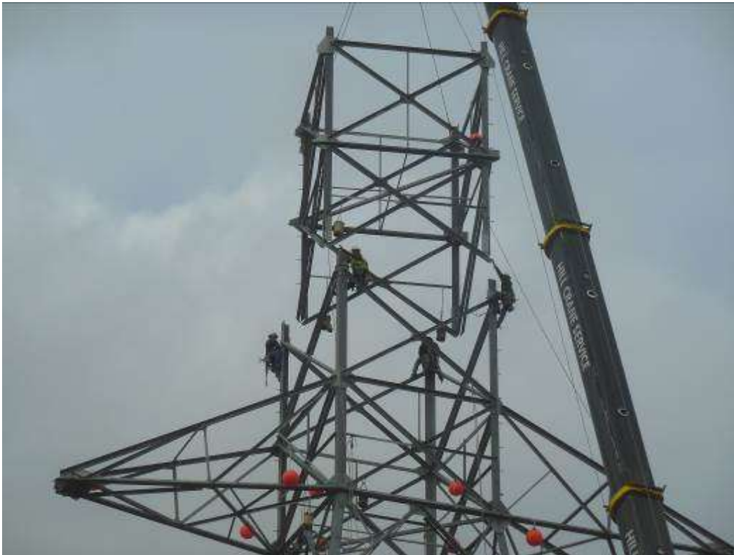
Figure 4: Installing the bridgework on Tower M37-T4, Segment 7.