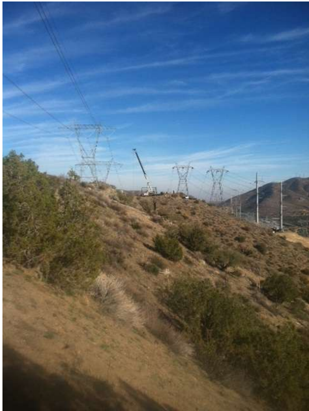
Figure 3: Structure erection occurring at Construct 5, Segment 11C.