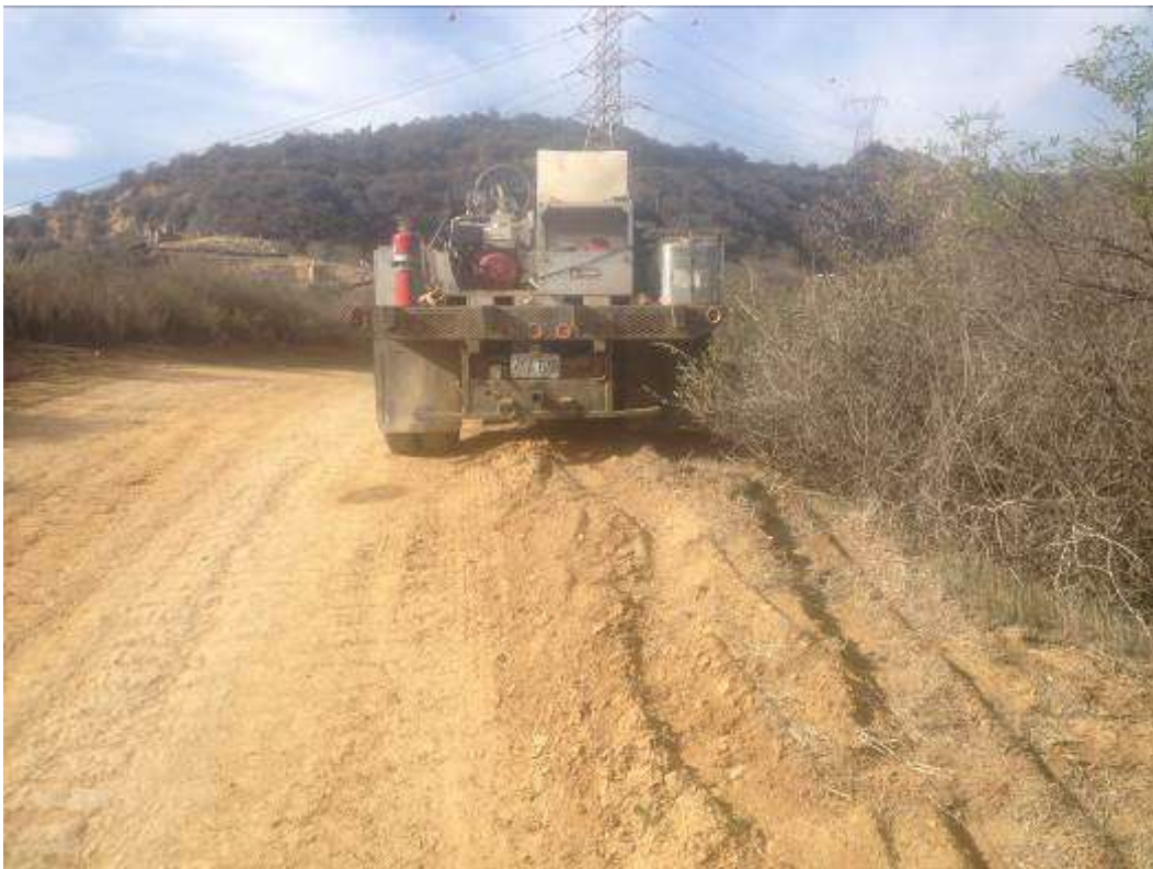
Figure 6: PAR truck parked outside approved road limits near Tower M27-T2, Segment 7.