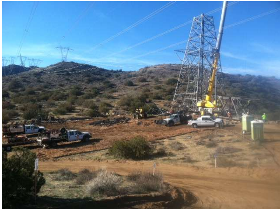
Figure 2: Structure erection occurring at Construct 3, Segment 11C.