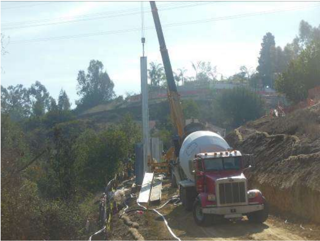
Figure 5: Pouring concrete and installing soldier wall beams at Tower M49-T1, Segment 8, Phase 4.