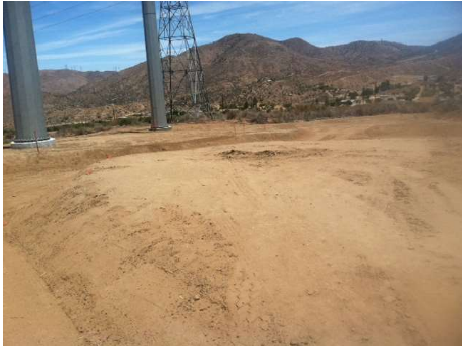
Figure 1: Site finalization completed at Construct 7, Segment 6A.