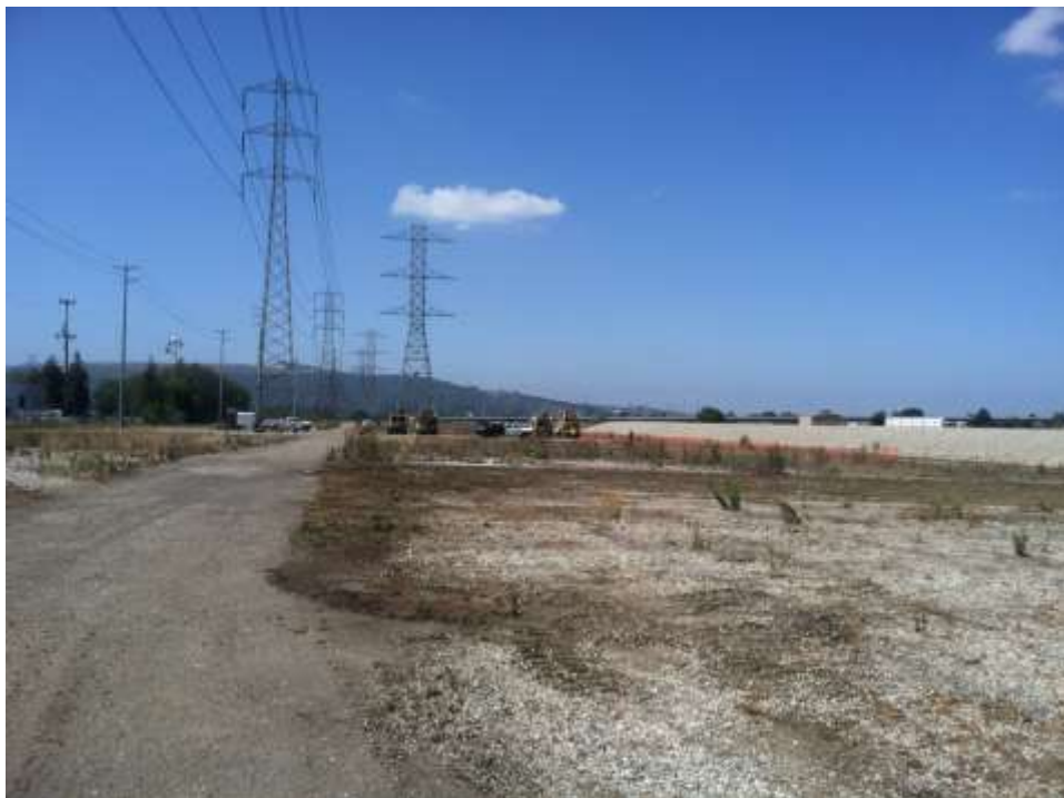
Figure 4: PAR equipment set up within the Segment 7 right-of-way in preparation for installation of conductor over the 10 Freeway.