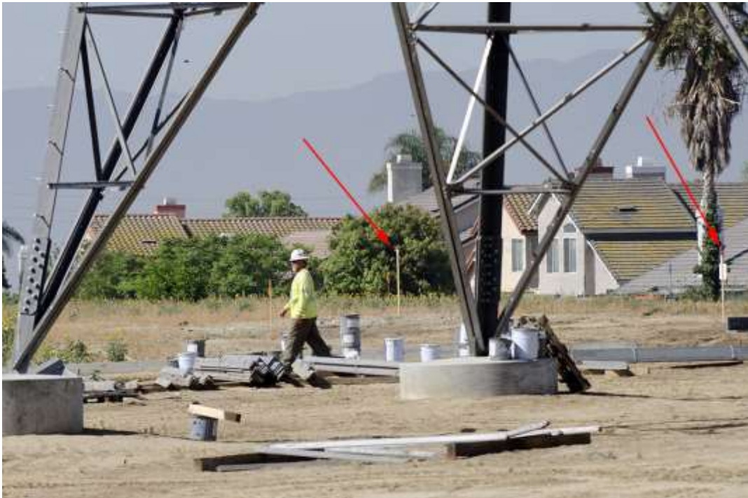
Figure 8: A TRTP construction worker walking into a marked exclusion area for a western burrowing owl. SCE Biologists monitored the owl burrow after this occurred and determined that the owls were not noticeably impacted by the incident, Segment 8, Phase 3.