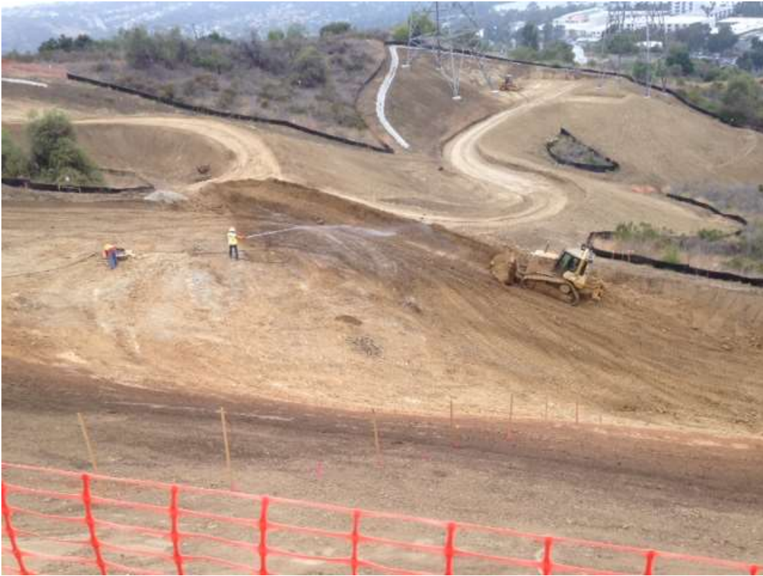
Figure 7: Grading at site for Tower M43-T3, Segment 8, Phase 4.