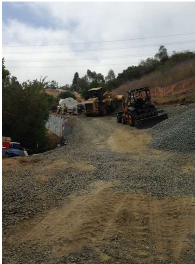
Figure 6: Hilfaker wall and access road construction at Tower M49-T1, Segment 8 Phase 4.