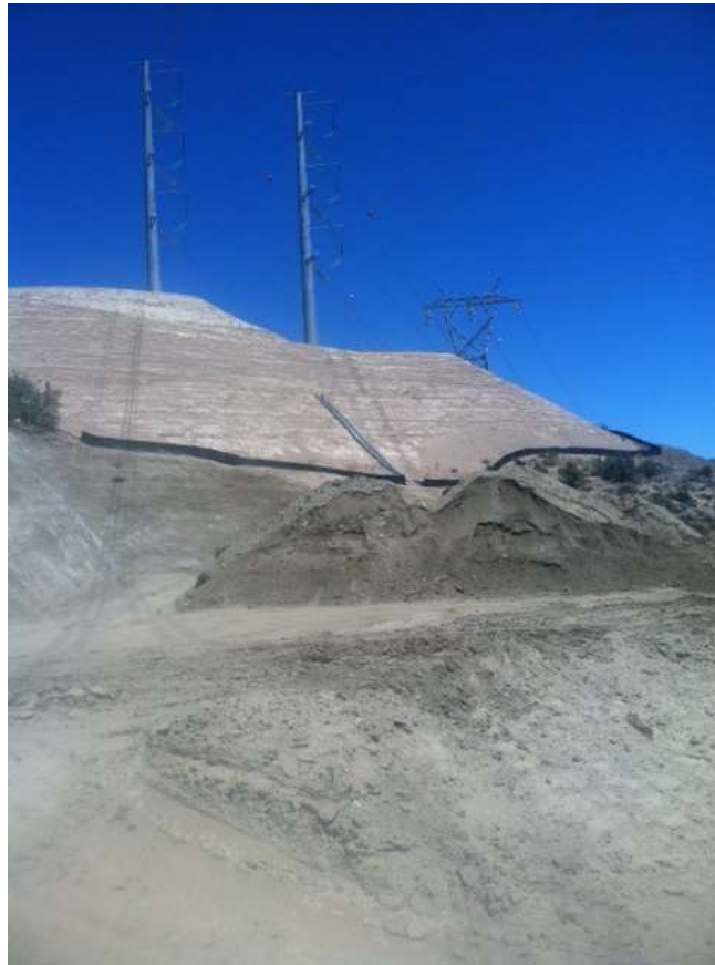
Figure 3: Uncovered stockpile at Construct 5, Segment 6A.