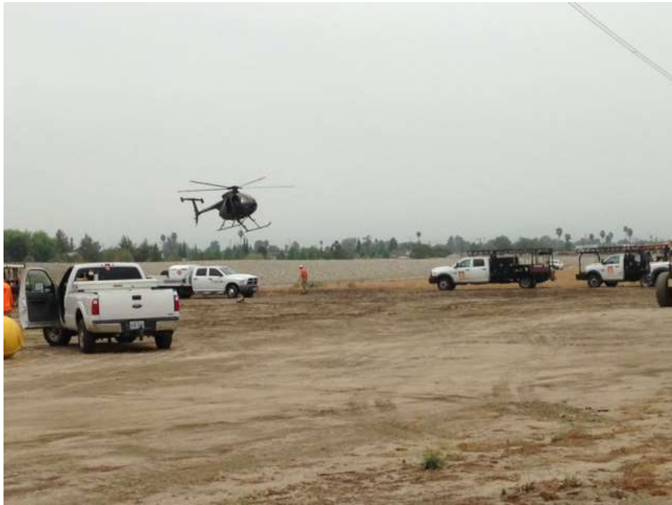
Figure 5: Helicopter activity associated with the 10 freeway crossing, Segment 7.