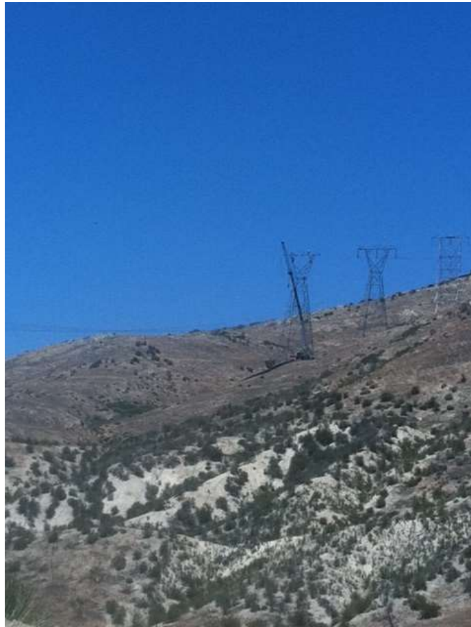
Figure 3: Steel wreck-out activities at Construct 14, Segment 11C.