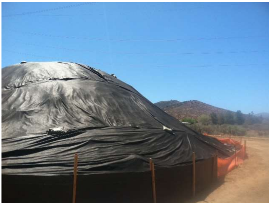
Figure 4: Stockpiles were covered using geotech fabric at Construct -01, Segment 11C.