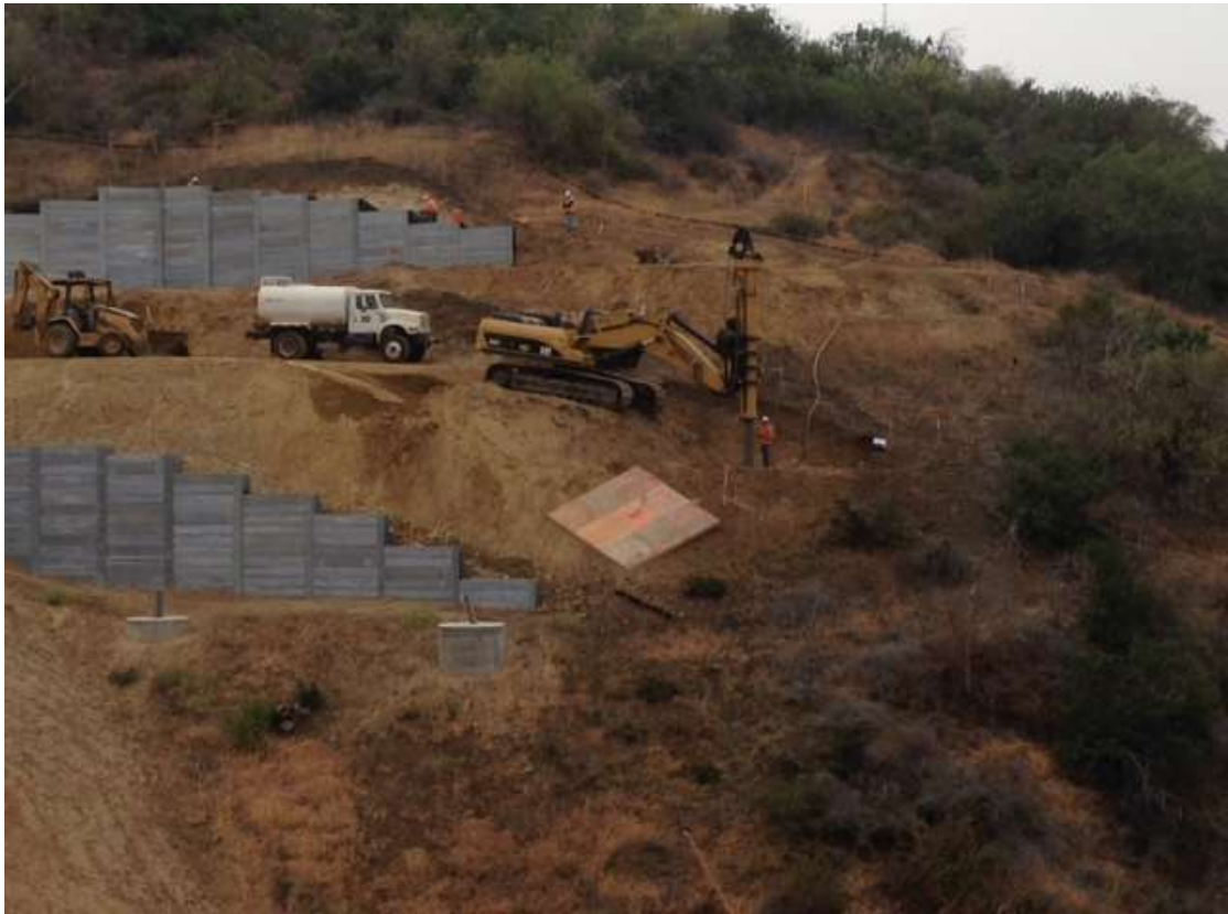
Figure 6: Foundation drilling at Tower M57-T1, Segment 8, Phase 1.