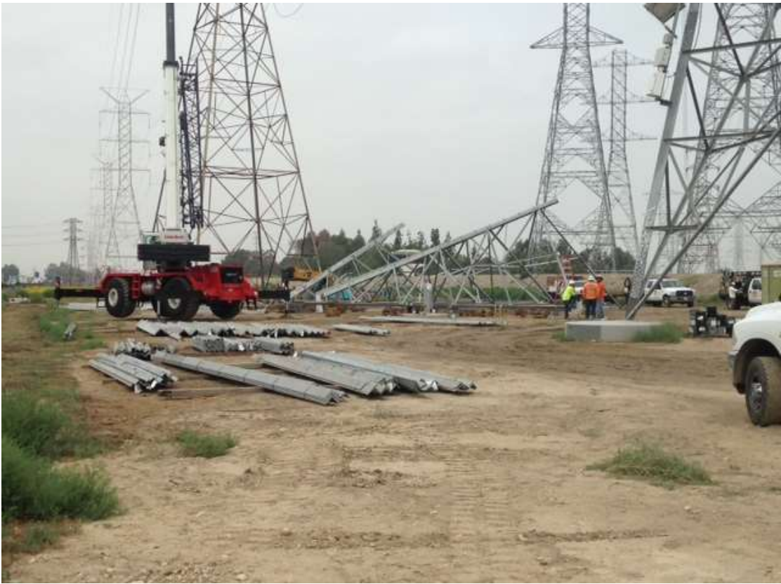
Figure 9: Tower assembly at Tower M42-T6, Segment 8, Phase 4.