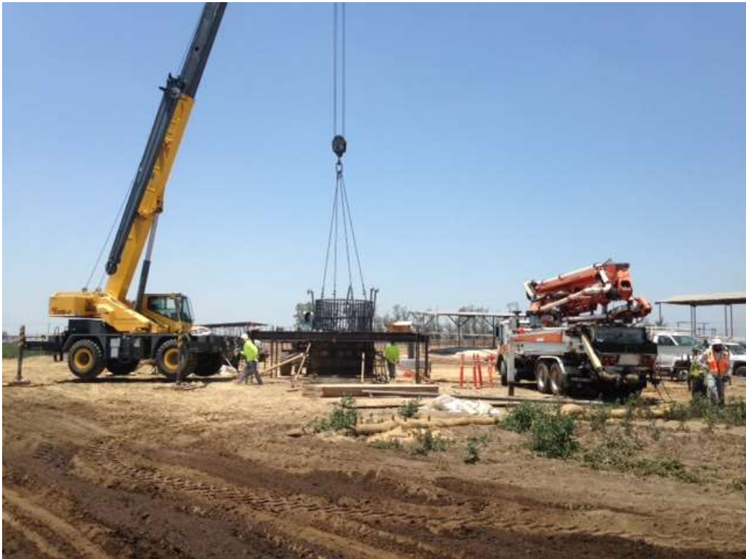
Figure 7: Foundation cage installation at Tower M70-T3, Segment 8, Phase 3.