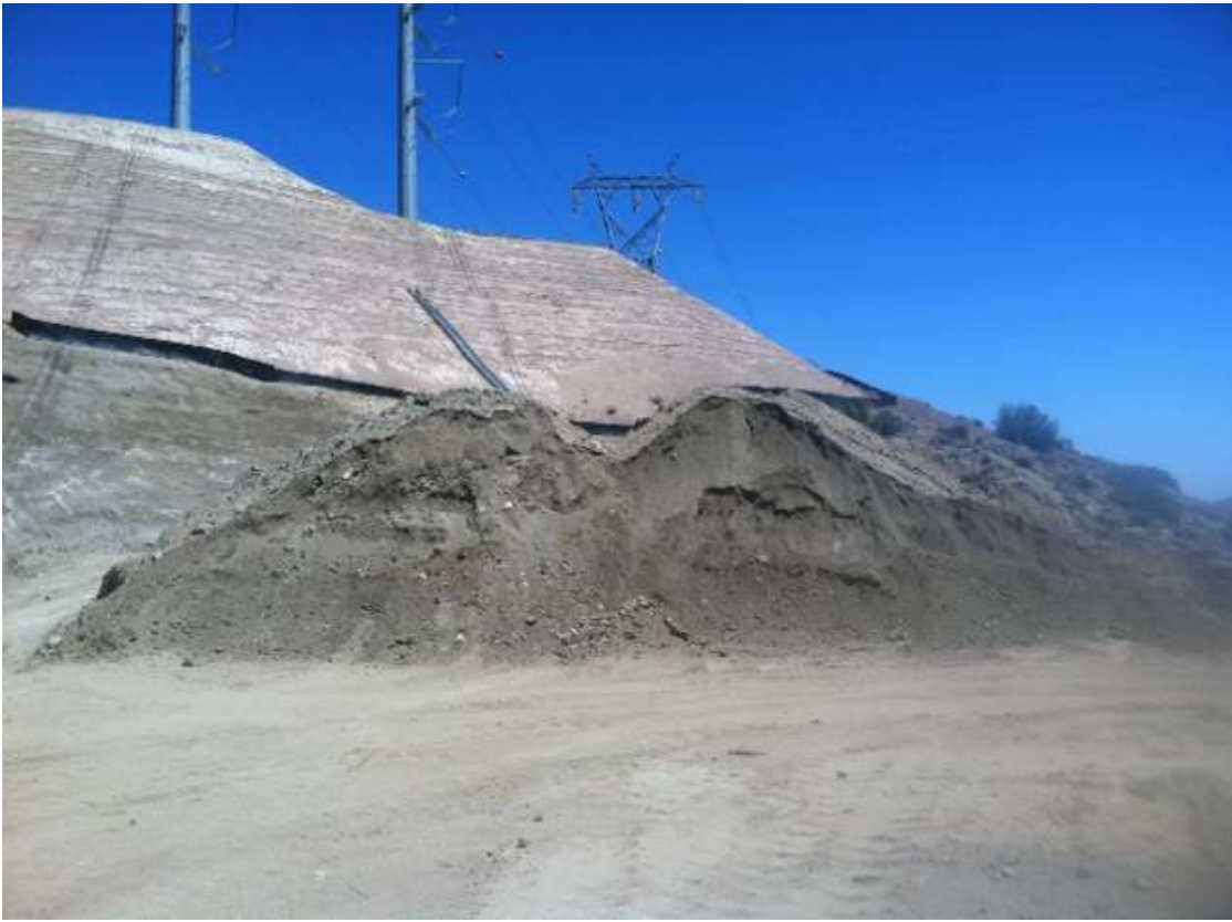
Figure 5: Uncovered stockpile at Construct 5, Segment 6A.