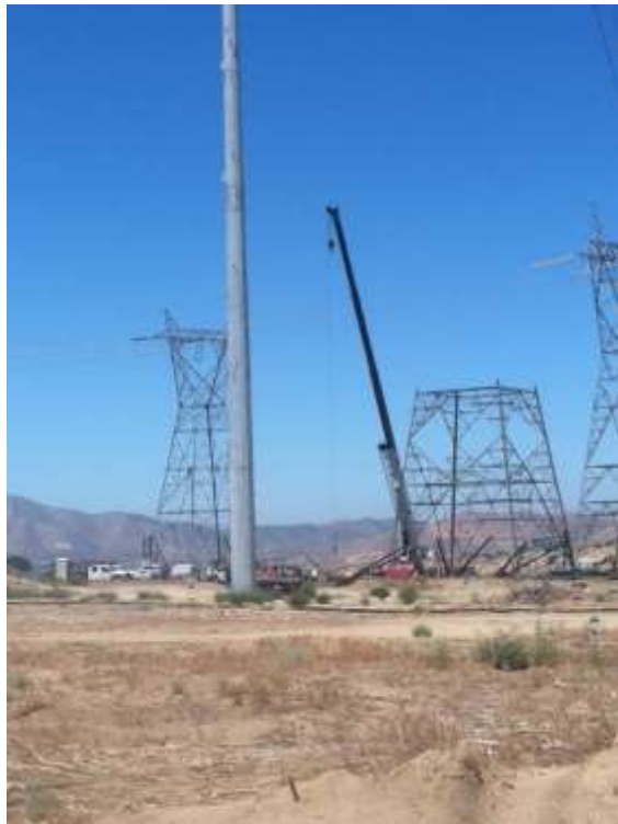
Figure 2: Steel erection activities at Construct 1, Segment 11C.