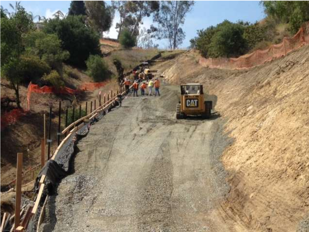
Figure 8: Hilfaker wall and access road construction at Tower M49-T1, Segment 8, Phase 4.