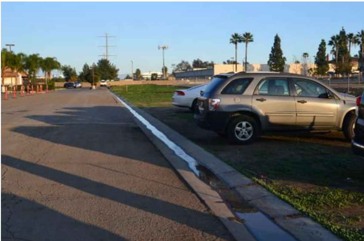
Figure 6: Silt laden water seeped out from the washout area onto a paved driveway running toward Pipeline Avenue.