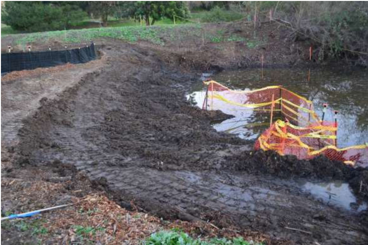
Figure 10: Soil salvage activities continued on January 14 and entered the jurisdictional wetland.