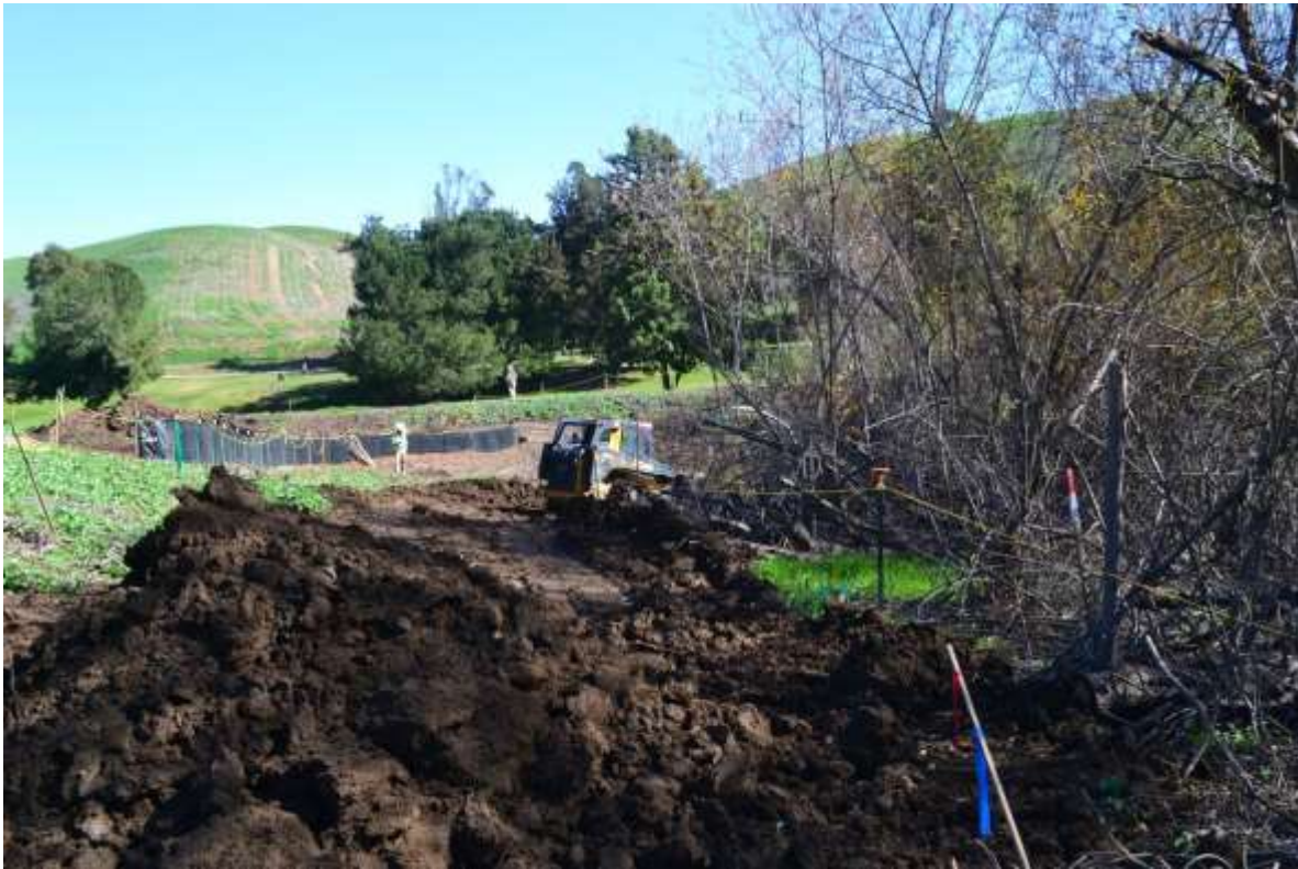
Figure 9: Soil salvage near VC #2 on January 14. Perimeter BMPs were absent during this activity.