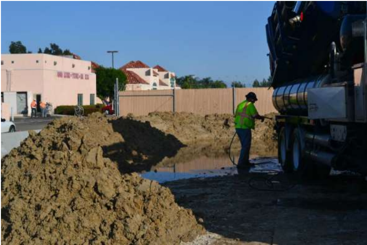
Figure 5: TRTP crewmember washing out vacuum truck in the HDD cuttings containment area on January 13.