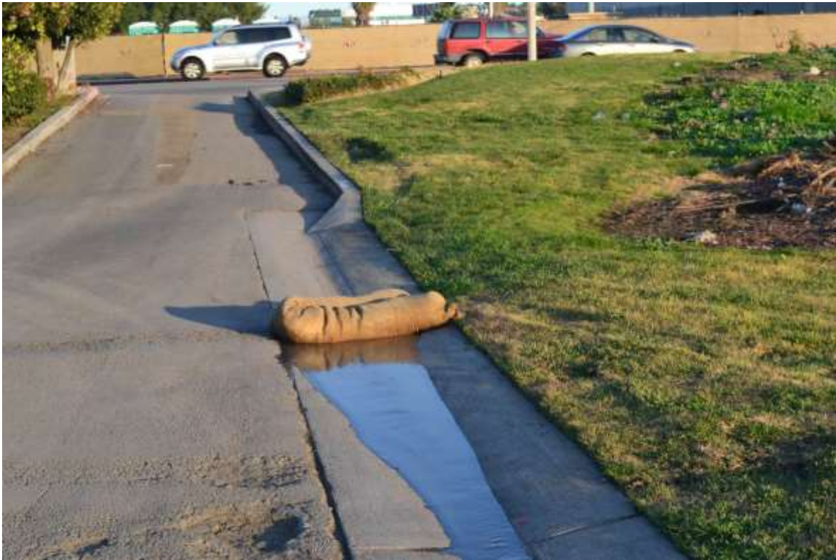
Figure 7: The silty water ran into a storm drain inlet for approximately 30 minutes until clean-up activities were initiated. The storm drain inlet did not have any BMP protections in place until this incident occurred.