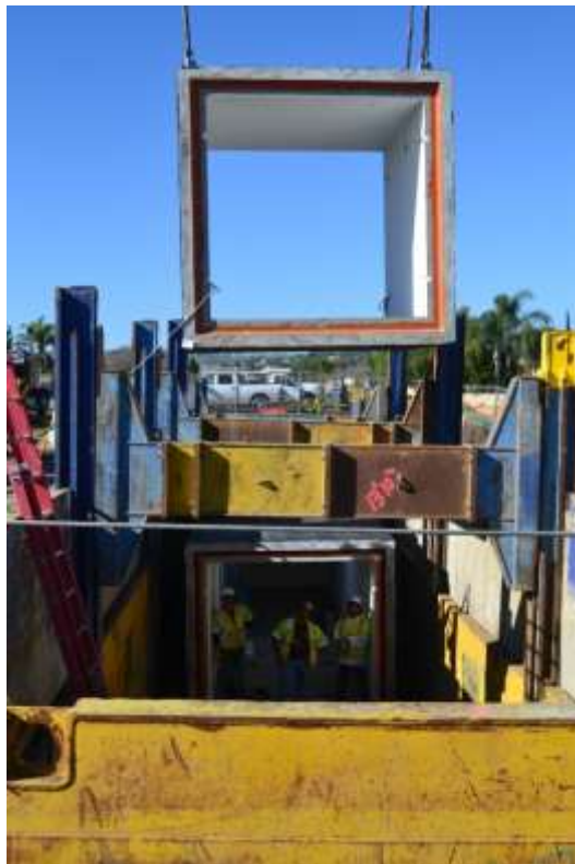
Figure 4: Installation of a splice vault at VC #13.