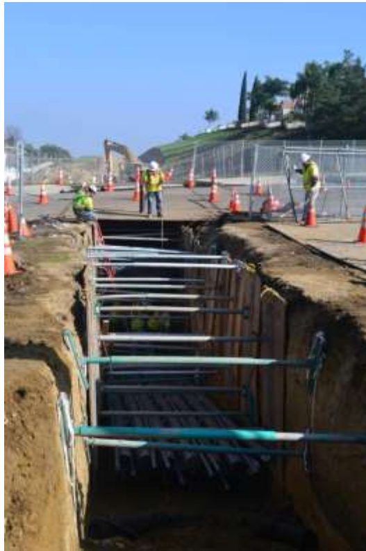
Figure 3: Conduit installation at the Avenue Cabrillo Street Crossing.