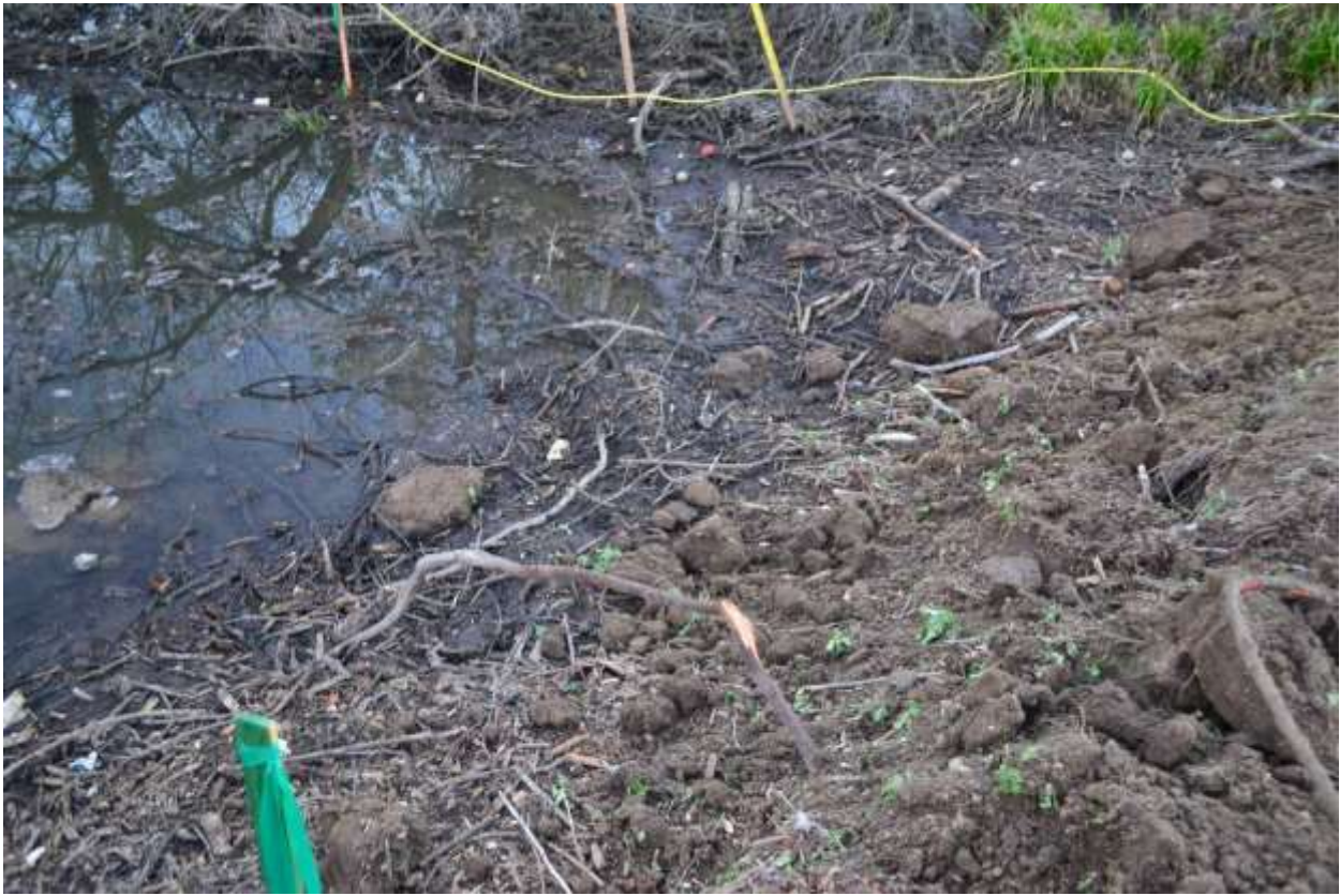
Figure 11: Soil from the salvage grading was pushed into the wetland near VC #2.