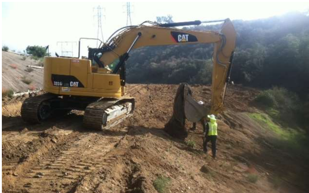
Figure 2: Restoration grading activities at Chaney Trails WSS, Segment 11B.