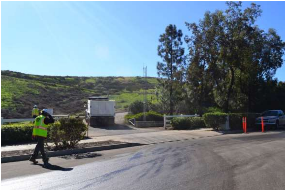
Figure 8: Uncovered soil in haul trucks going to the WTS.