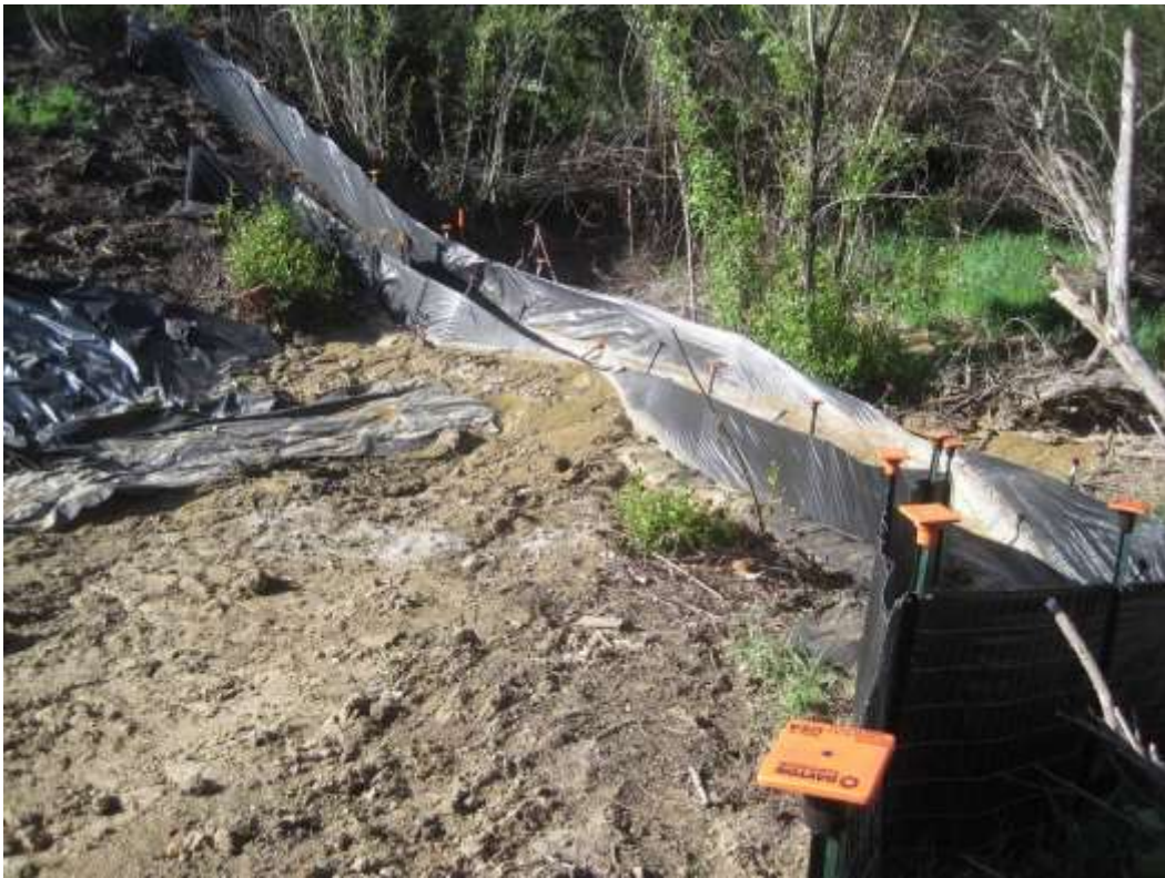
Figure 7: Offsite discharge occurred at WTS as a result of the March 2 storm generating flows that breached the silt fencing control measures, 500 kV Underground (photo courtesy of SCE).