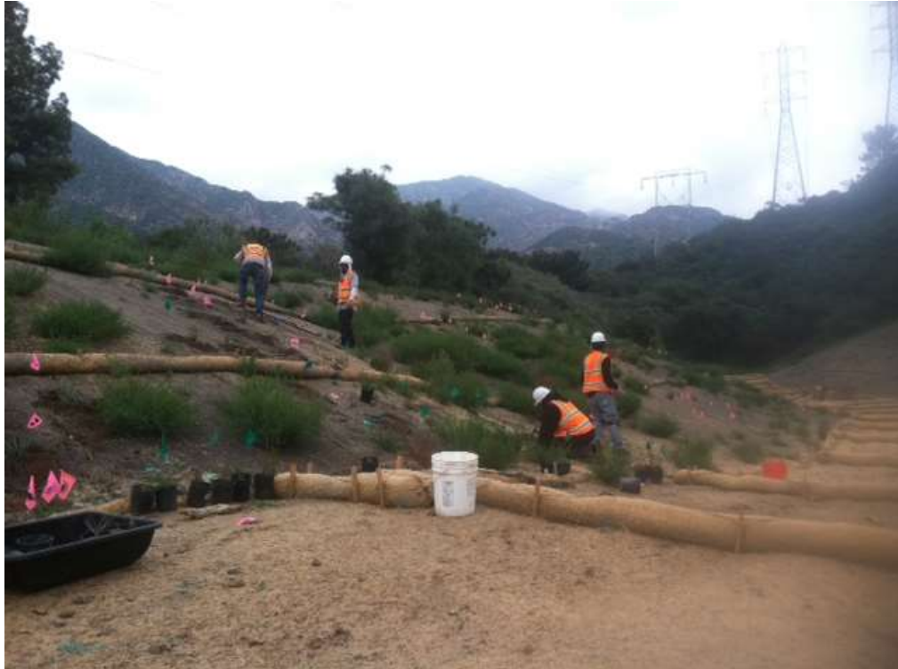
Figure 1: Container planting occurring at Chaney Trails' restoration area, Segment 11B.