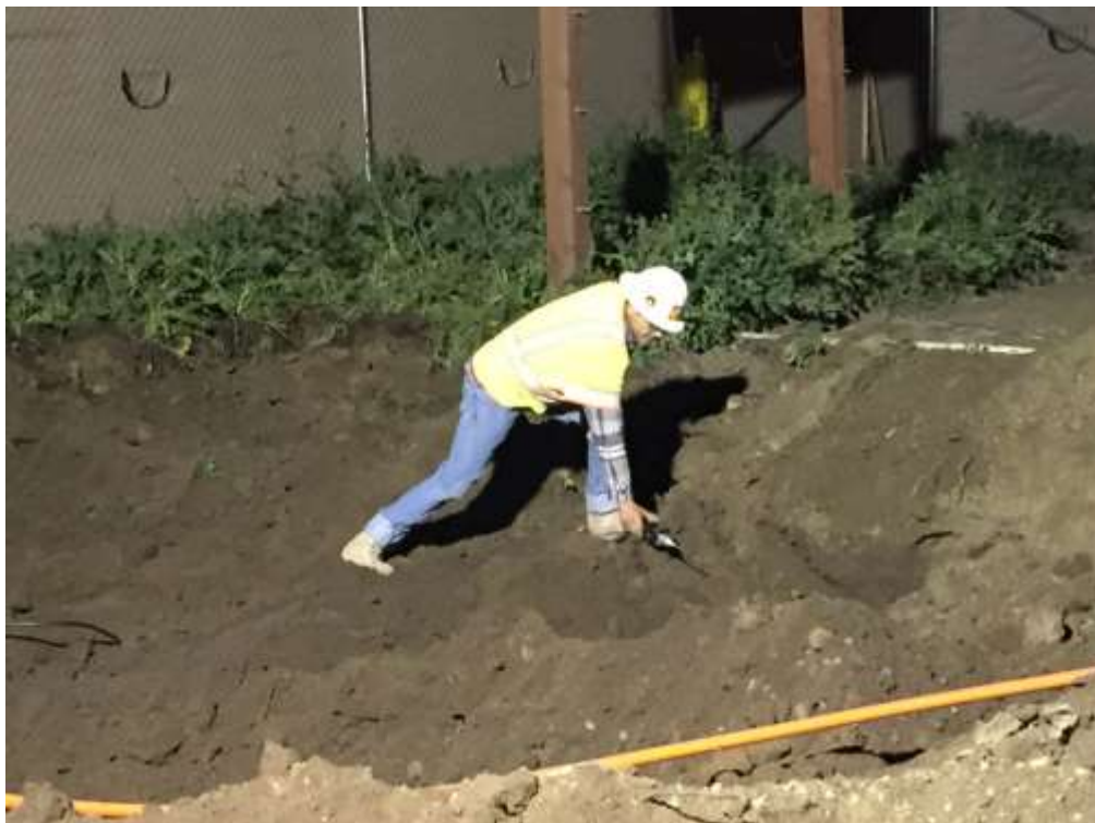
Figure 6: Air quality monitor taking surface measurements during contaminated soil removal at ETS, 500 kV Underground.