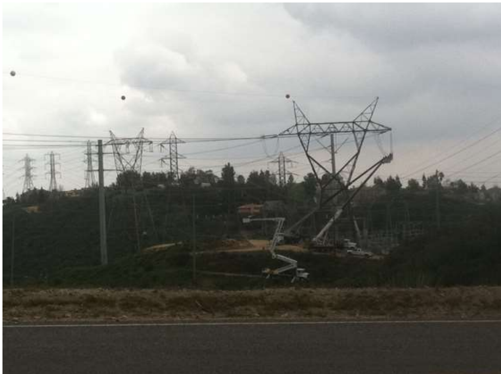
Figure 2: Wire stringing operations at Construct 67 and Gould Substation, Segment 11C.