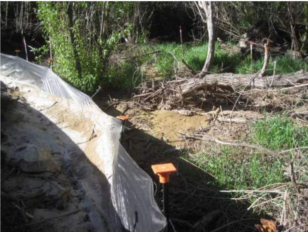
Figure 8: Discharge observed within the jurisdictional feature adjacent to WTS, 500 kV Underground.