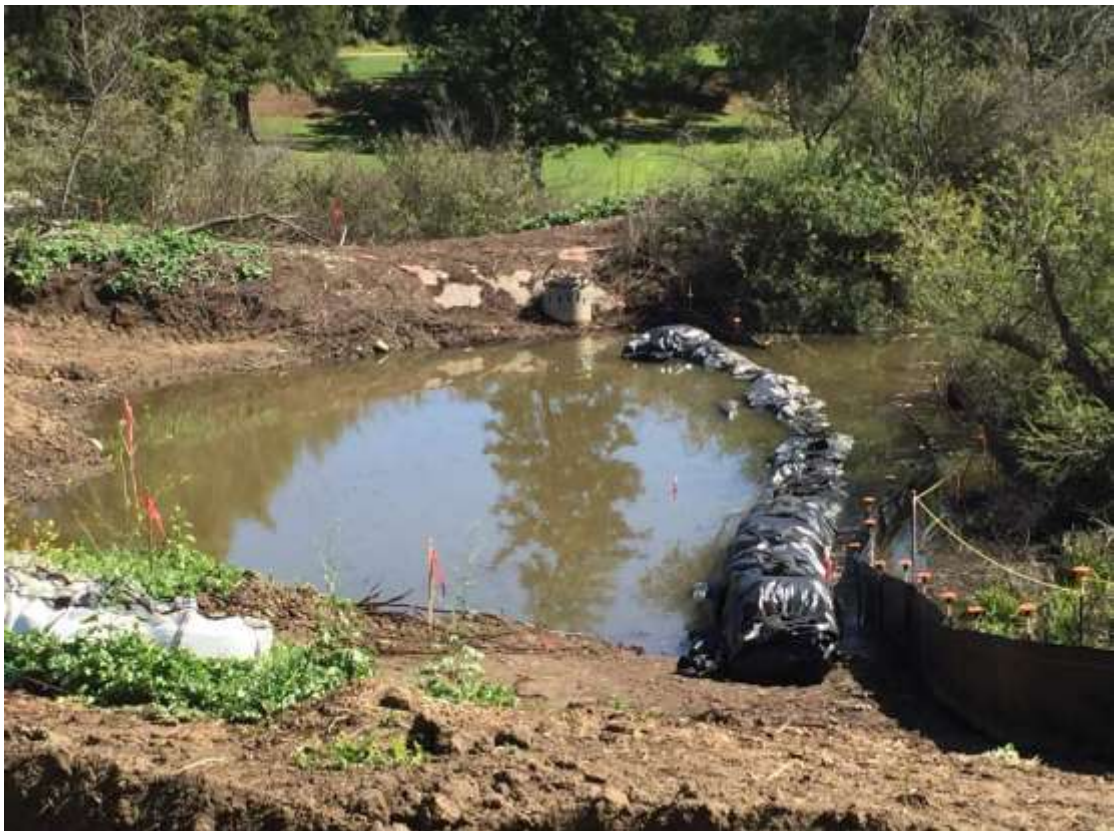
Figure 4: Water breaching the impermeable barrier at VC #2, 500 kV Underground.