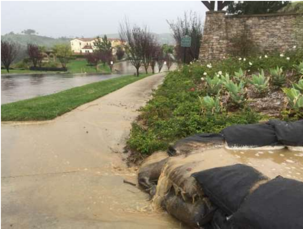
Figure 9: Storm water flowing over sandbag BMPs along Canon Avenue during March 2 storm, 500 kV Underground.