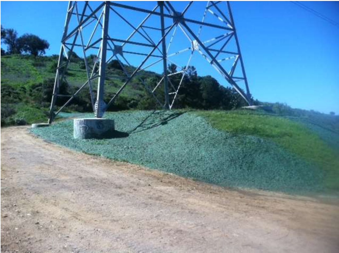
Figure 3: Hydroseeding for restoration and erosion control, Segment 8, Phase 4.