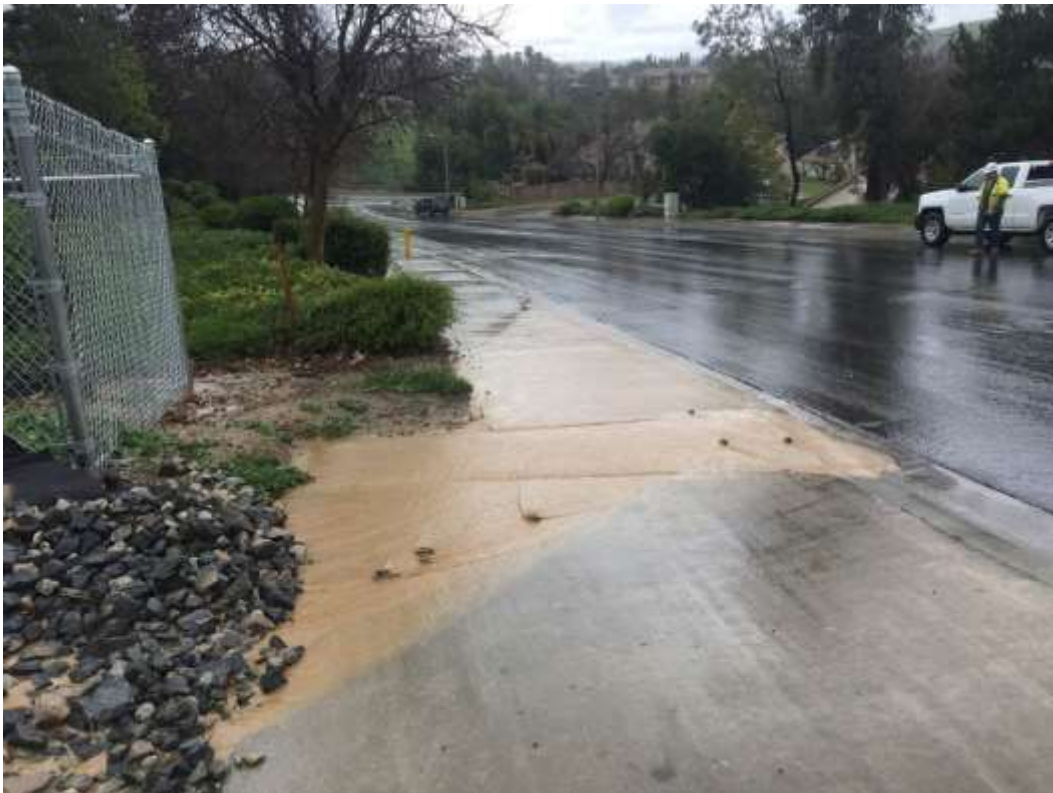
Figure 10: Muddy discharge flowing down Madrid Street from the entrance to VC #6 during March 2 storm, 500 kV Underground.