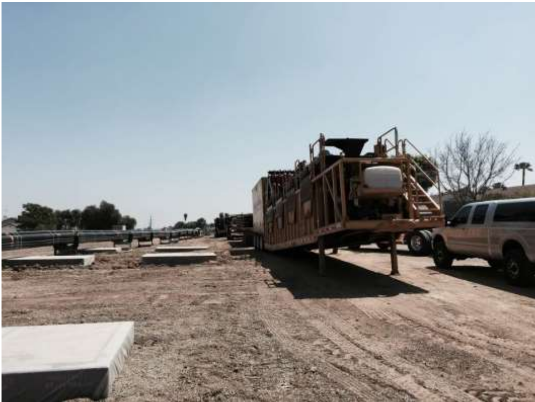
Figure 7: New rig delivered to the Drill #2 location. The adjacent conduit is being pulled through bore hole #1 and blocking access to the area where the rig will be set up for drilling.