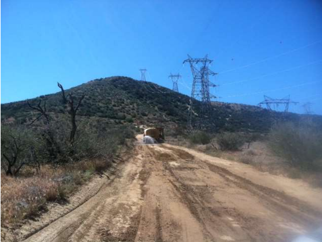
Figure 1: Loop Road O grading activities near Construct 16, Segment 11C.