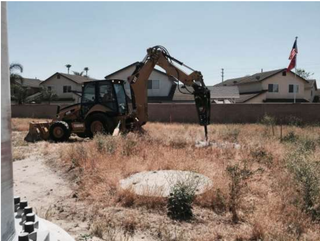
Figure 3: Removing relic foundations at Tower M67-T5 (Segment 8, Phase 3).