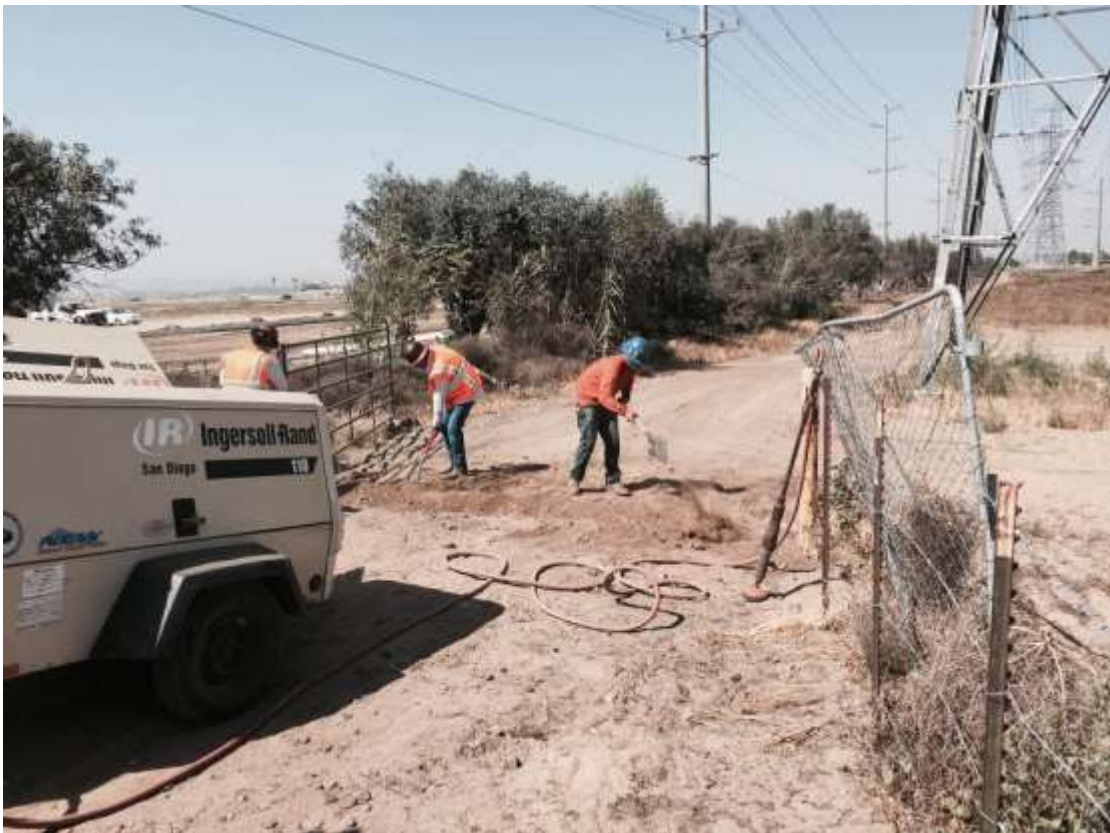
Figure 4: Digging a trench for fence/gate grounding at Tower M65-T2 (Segment 8, Phase 3).