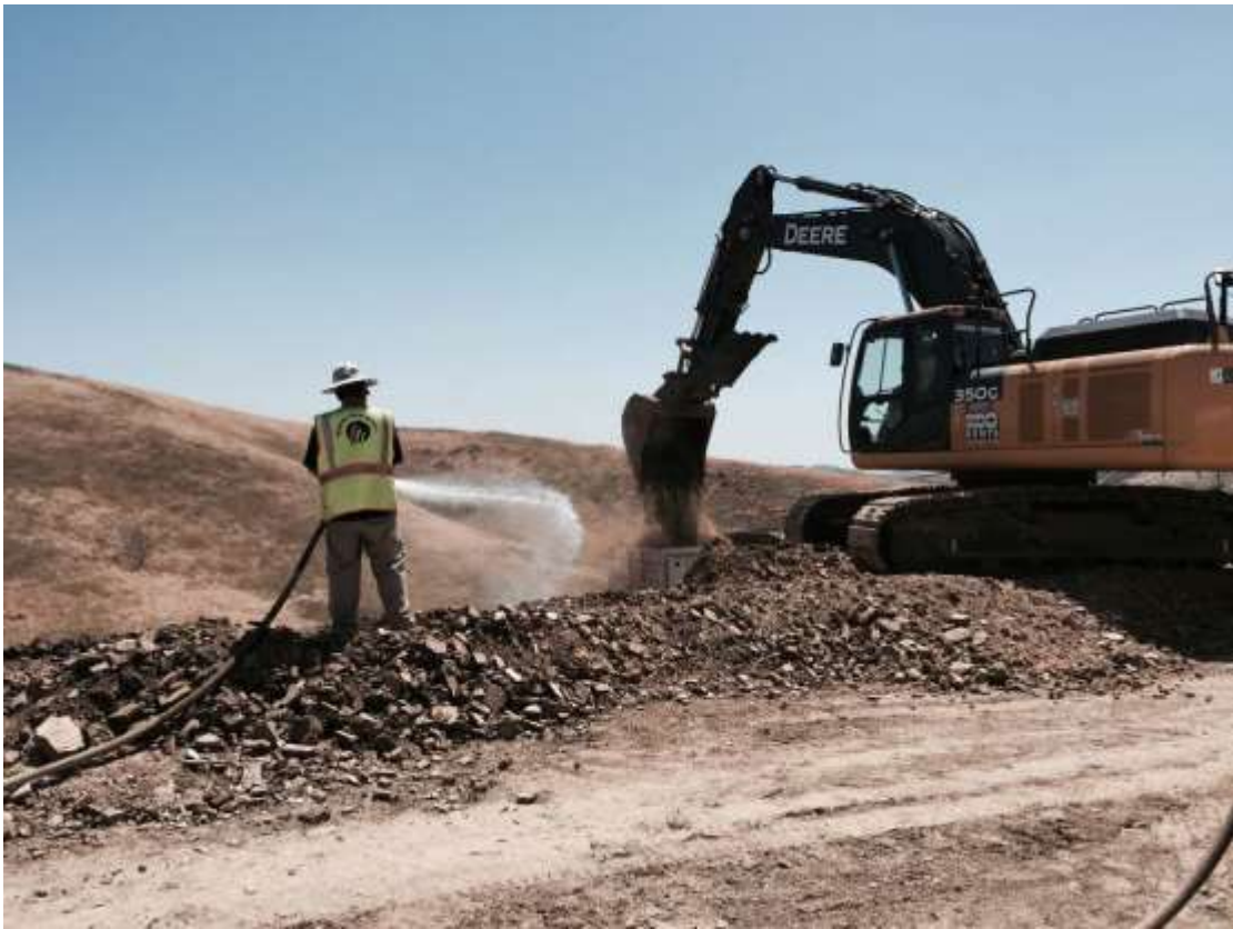
Figure 5: Road and pad development grading at VC #3 between RV #1 and RV #3.