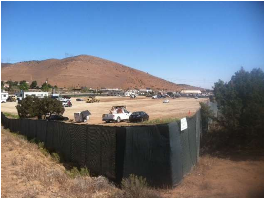
Figure 2: Demobilization of Vincent North HAY.