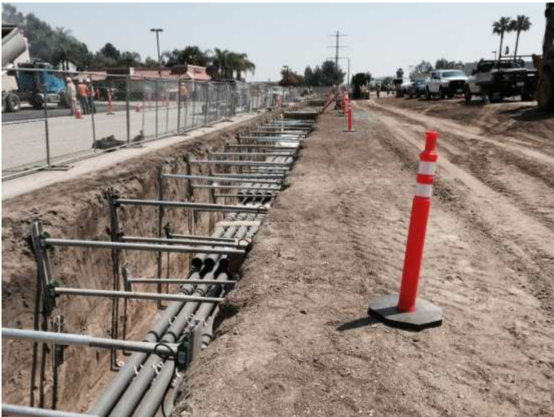
Figure 6: Conduit installation and backfilling between VC #14 and Pipeline Avenue.