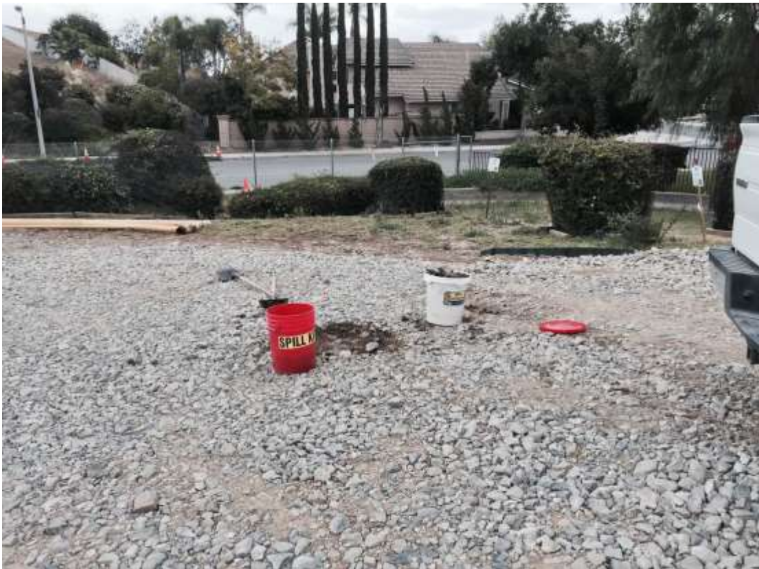
Figure 9: Spill kit used to clean up diesel fuel near VC #11.