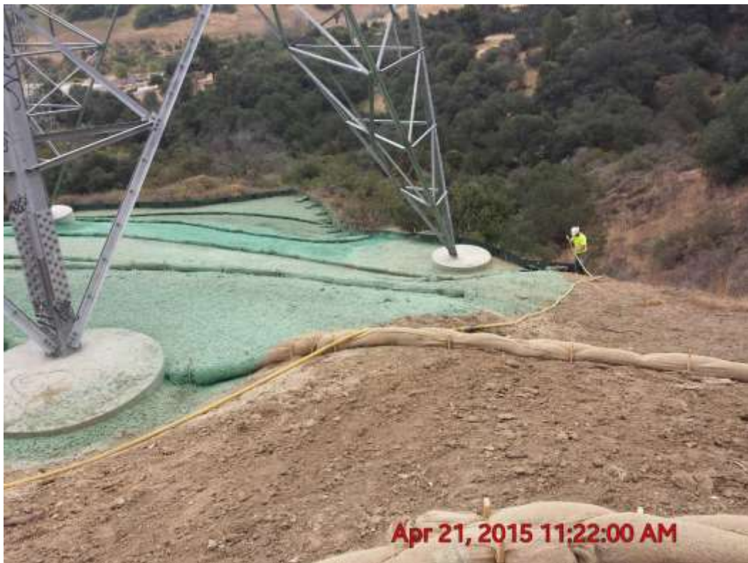
Figure 6: Hydroseed application at Tower M51-T4 (Segment 8, Phase 4) (photo courtesy of SCE).