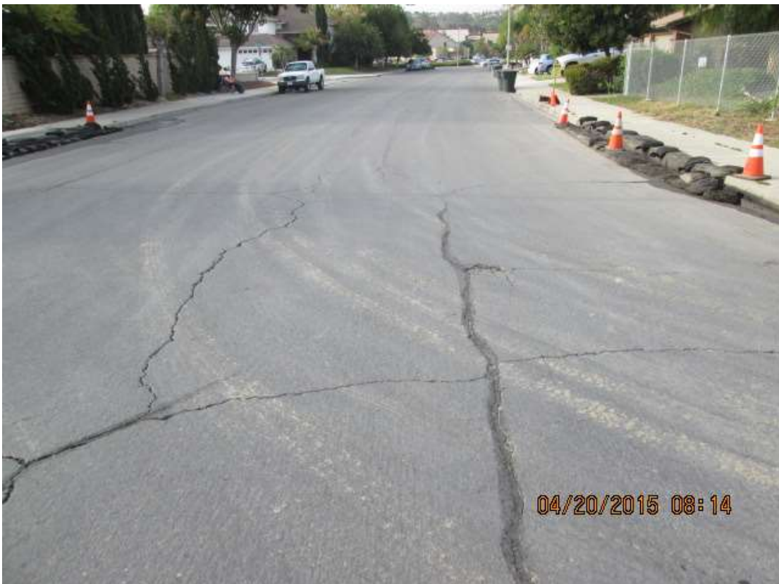
Figure 10: Excessive trackout along Lost Trails Drive identified by SCE Monitor.