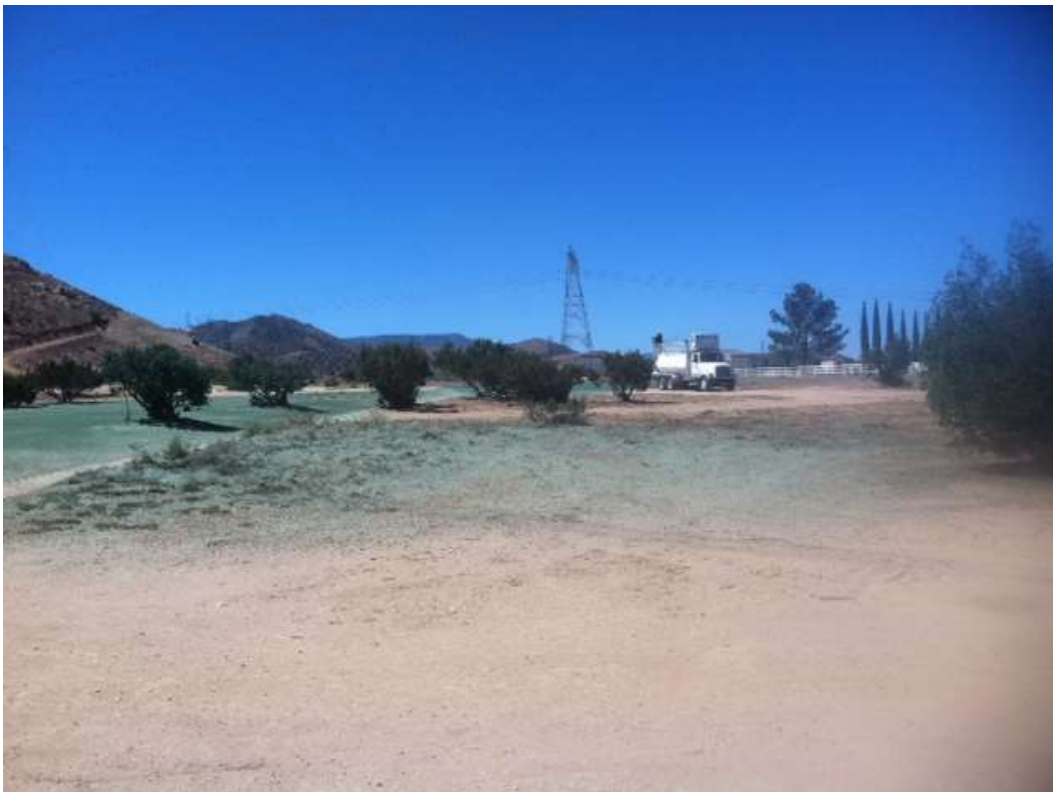
.Figure 3: Hydromulch (BMP) application at Vincent South Yard extension for final stabilization.