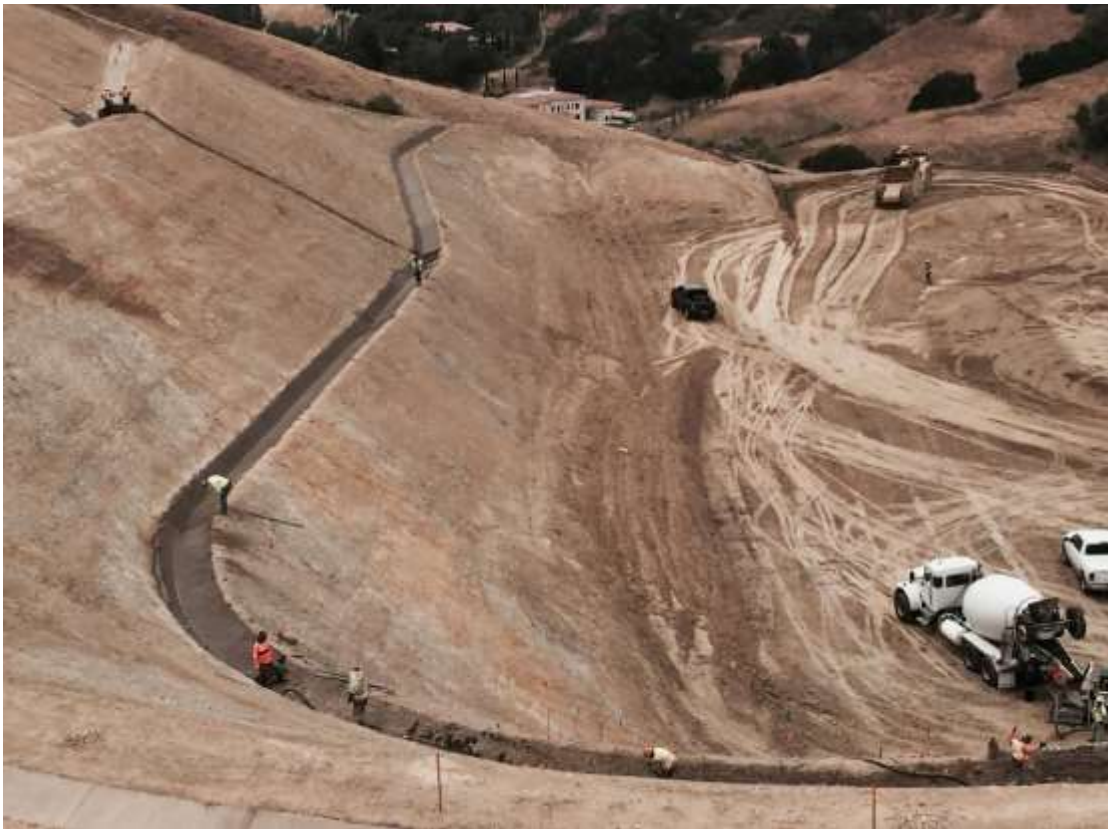
Figure 7: Installing v-ditch terrace drains at WTS.