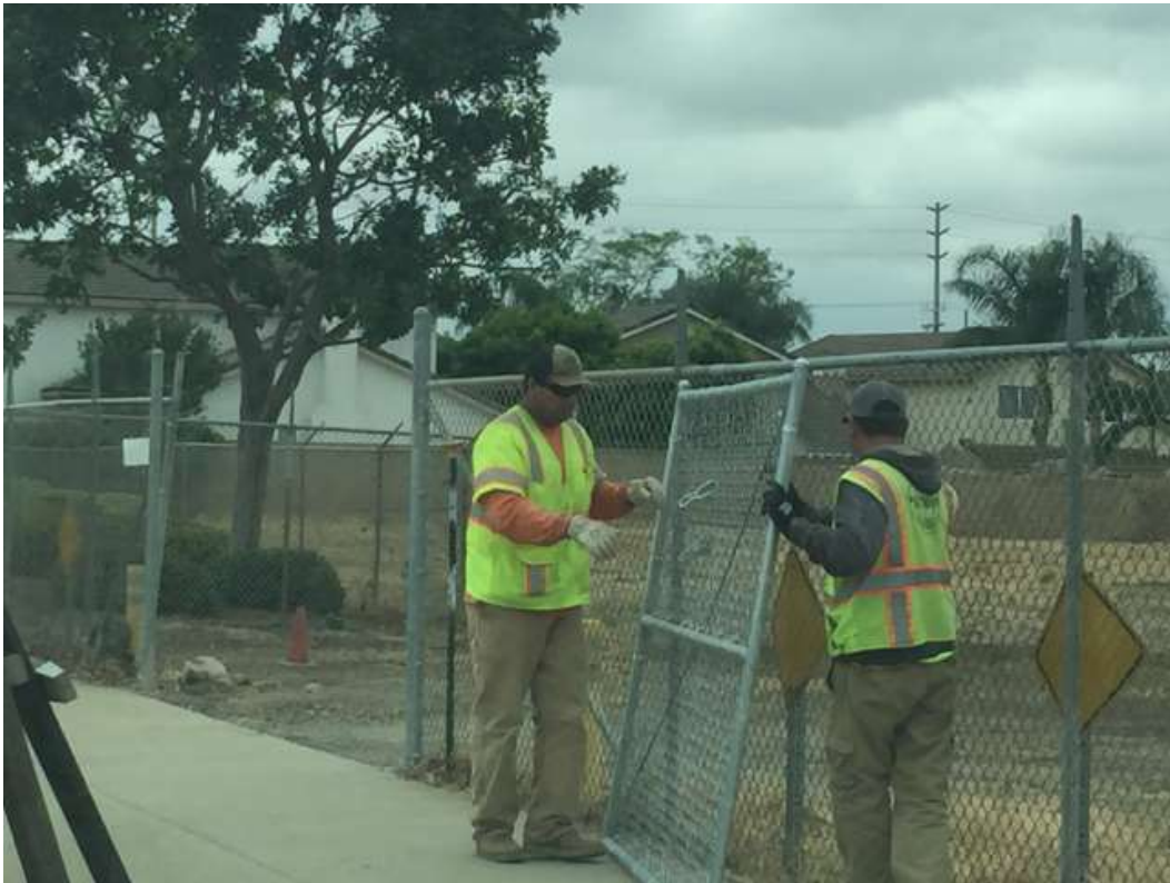
Figure 5: Installation of a new fence at Tower M67-T5 (Segment 8, Phase 3).