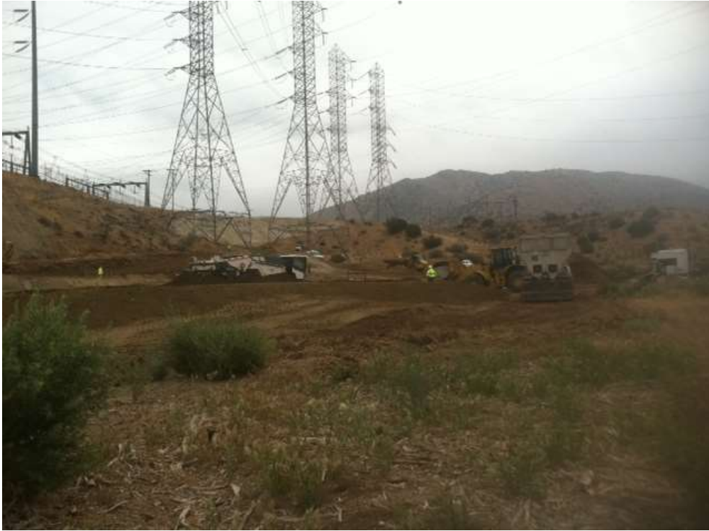
Figure 1: Grading activities at Construct -01, Segment 11C.