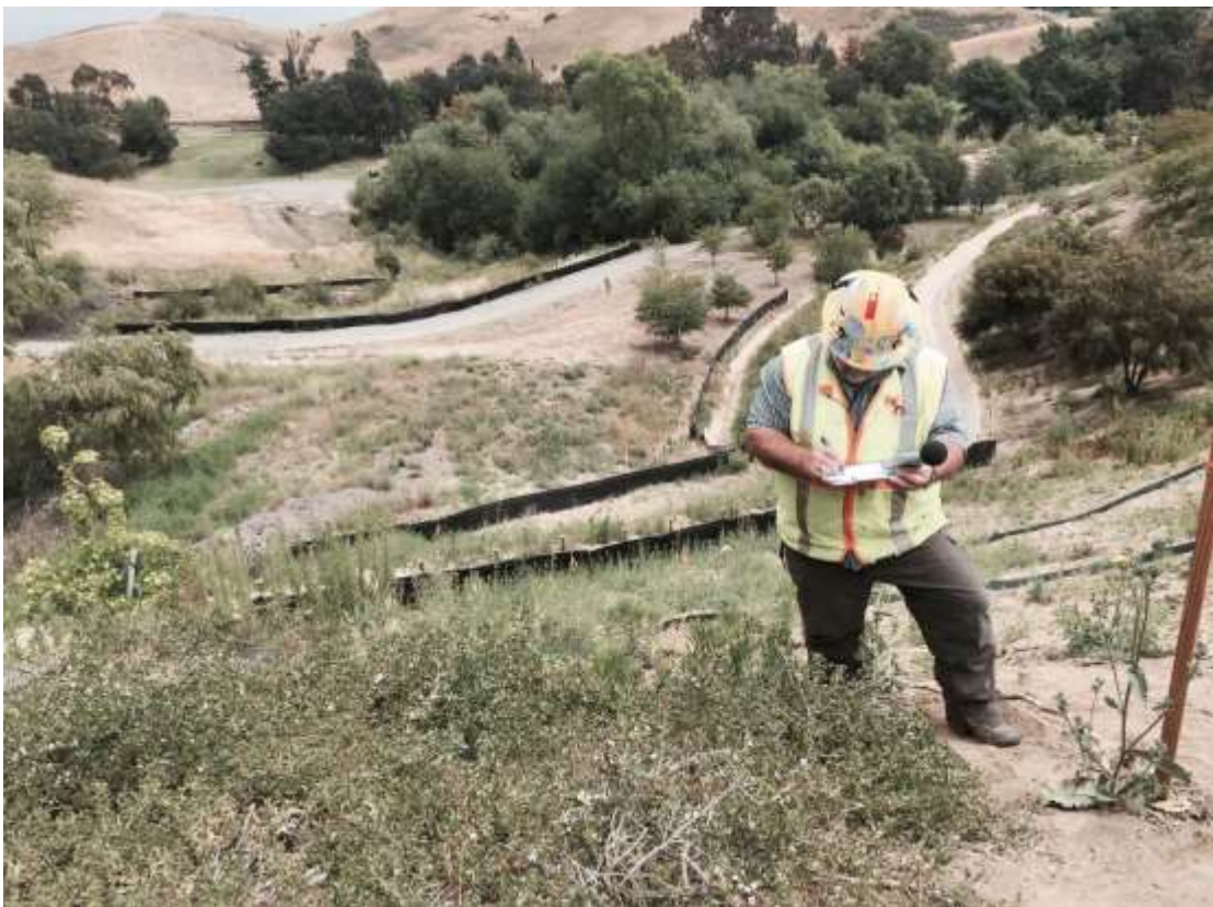
Figure 8: SCE Biological Monitor recording noise levels within nesting bird buffer near RV #1.