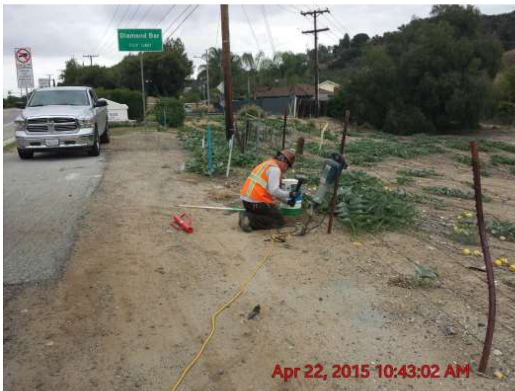
Figure 4: Conducting fence grounding along Brea Canyon Road (Segment 8, Phase 3) (photo courtesy of SCE).