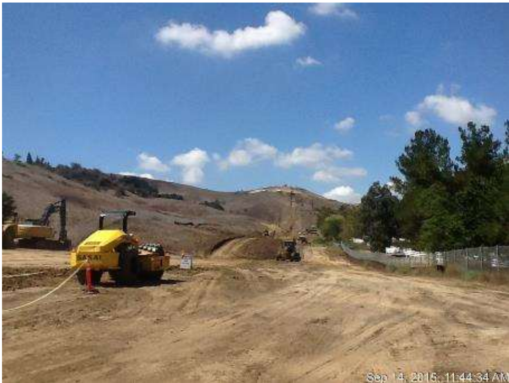
Figure 2: Grading activities between VC #4 and RV #4, 500 kV Underground.