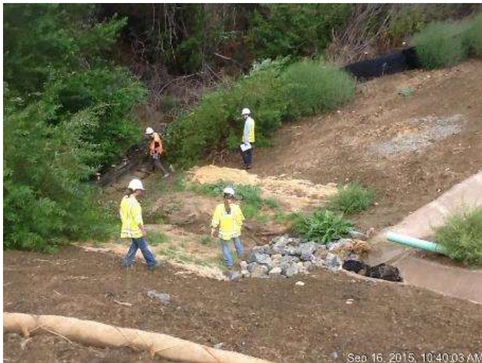
Figure 4: CDFW and SWRCB representatives review middle drainage point around perimeter of the WTS, 500 kV Underground.