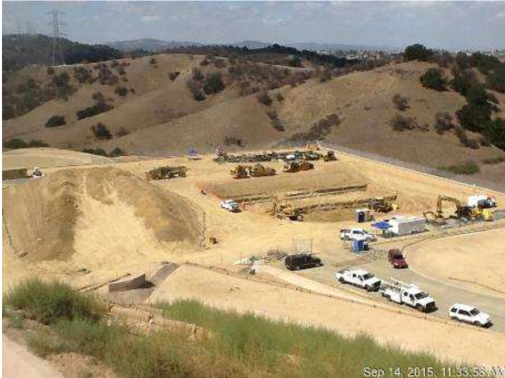
Figure 1: Foundation excavation activities occurring at the WTS, 500 kV Underground.