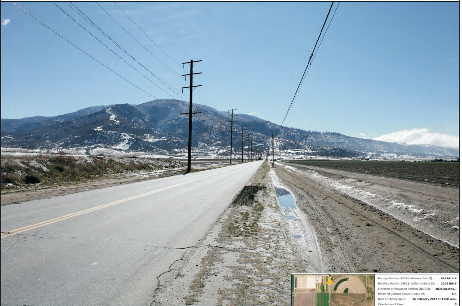
View from: Pelliser Road - North - Proposed Condition