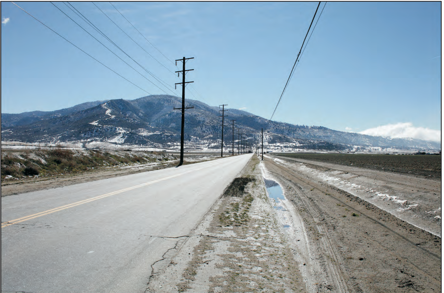
View from: Pelliser Road - North - Existing Condition