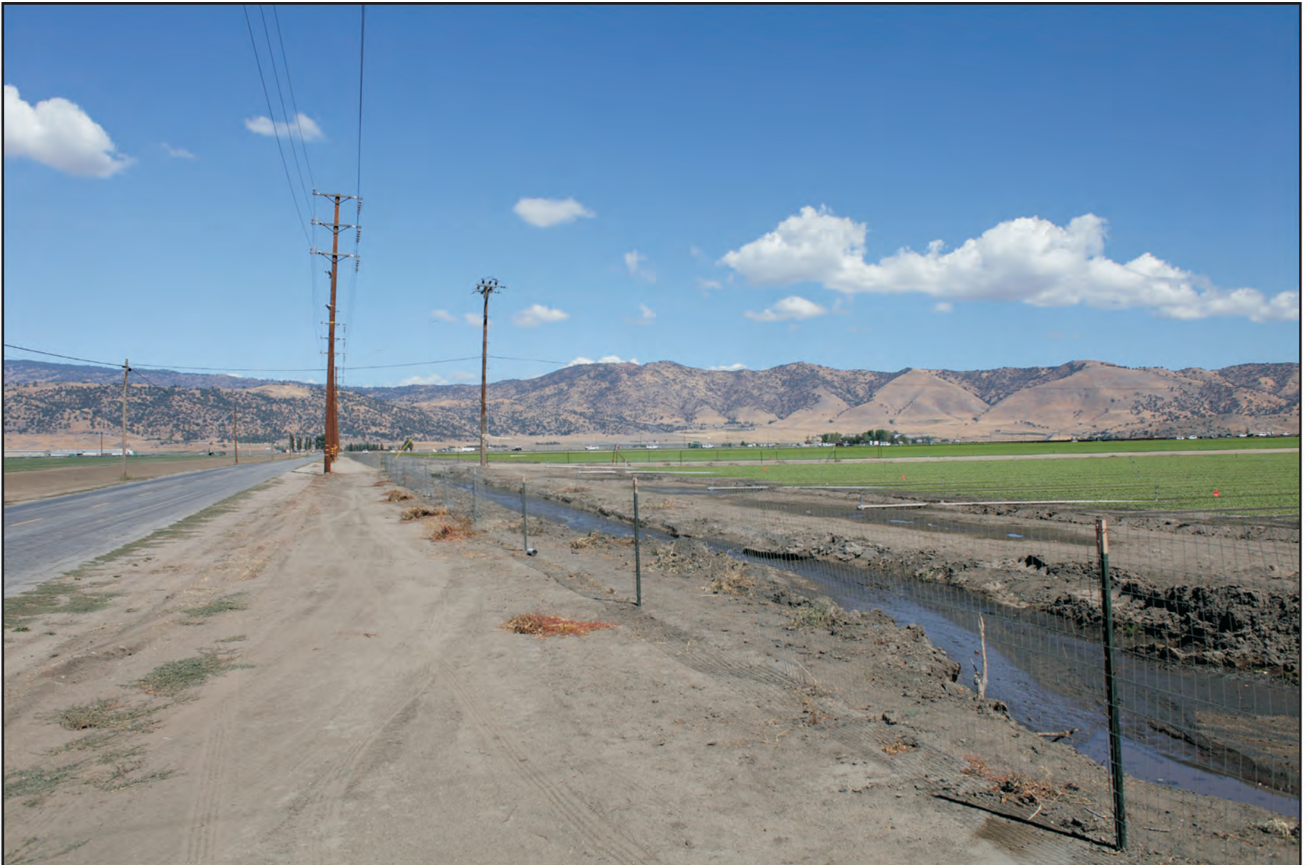
View from: Pelliser Road - South - Existing Condition