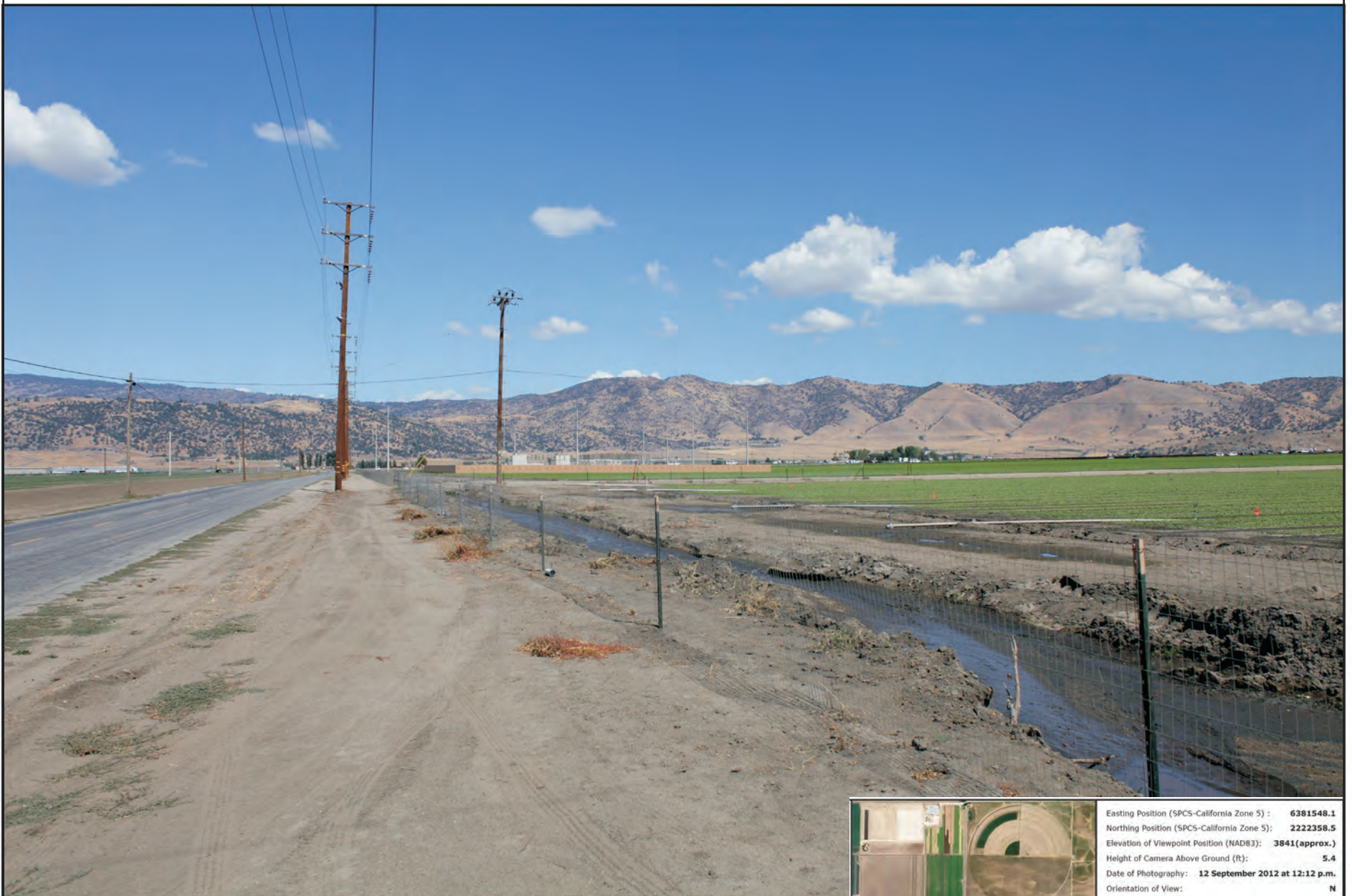
View from: Pelliser Road - South - Proposed Condition