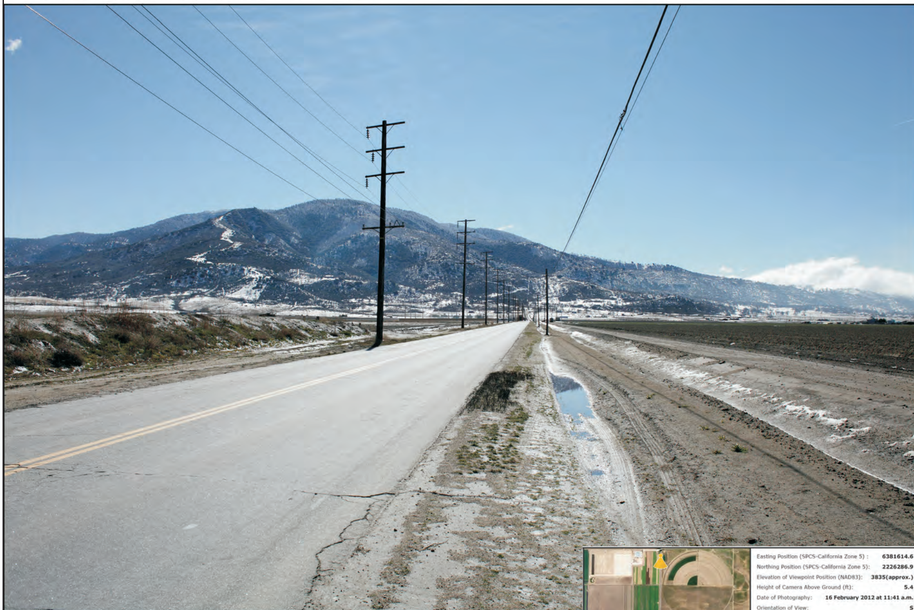
View from: Pelliser Road - North - Proposed Condition