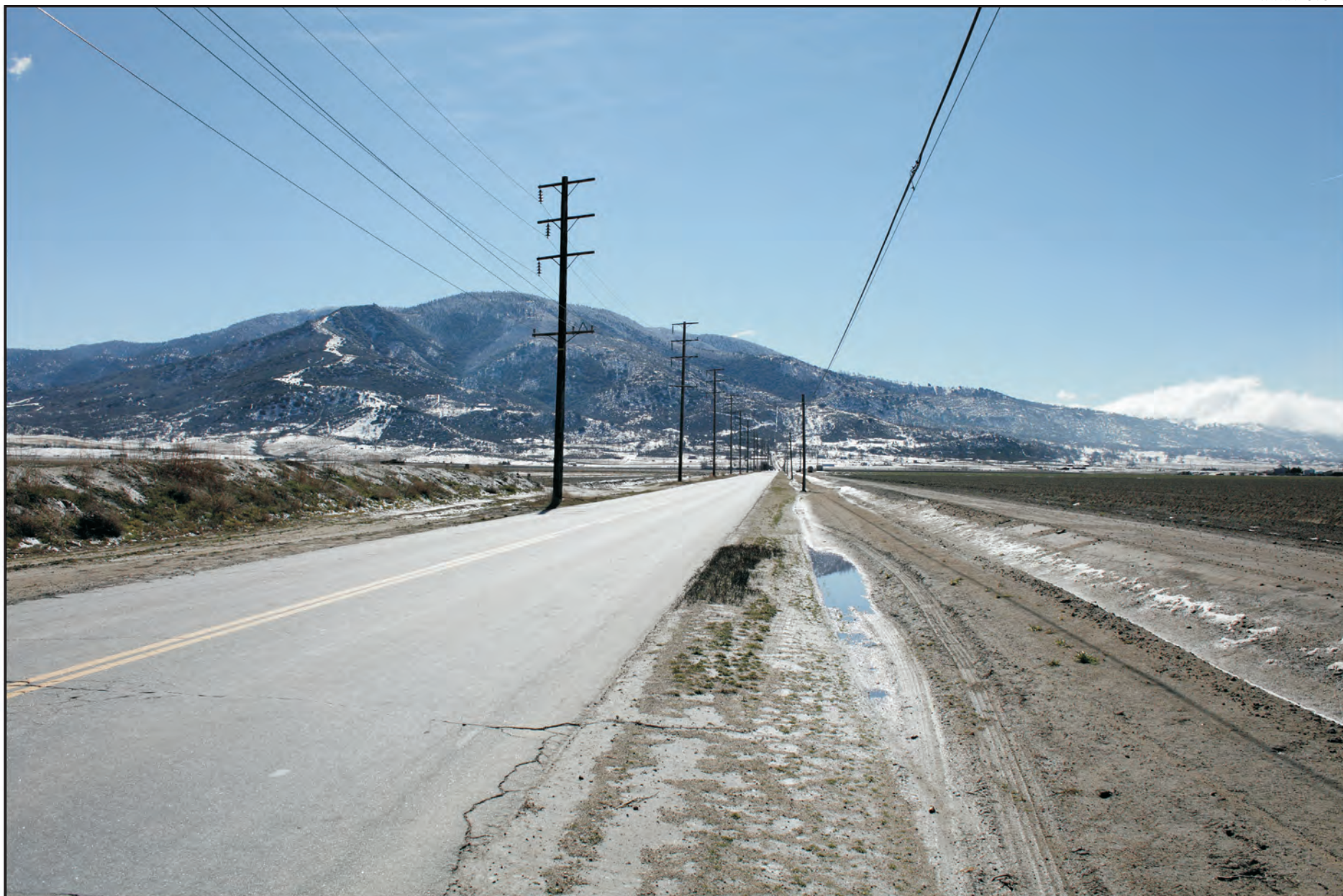
View from: Pelliser Road - North - Existing Condition