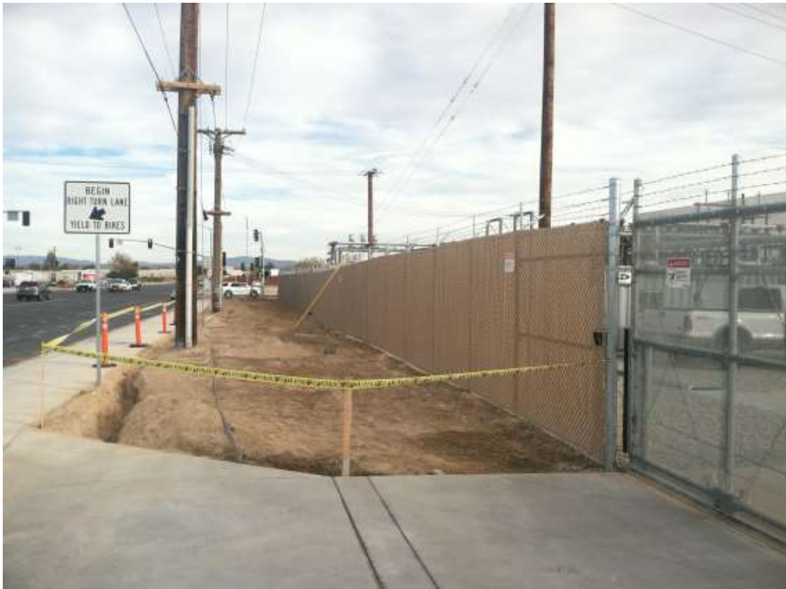
Figure 3 – Landscape crews trenched irrigation lines along the northern edge of the substation during the subject period. View east (10/20/15 above, 12/3/15 below).