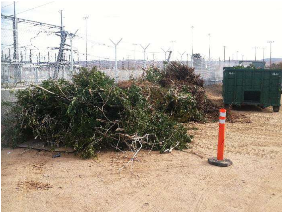
Figure 2 – Oleander removal was completed during the subject period. View southeast (12/3/15).