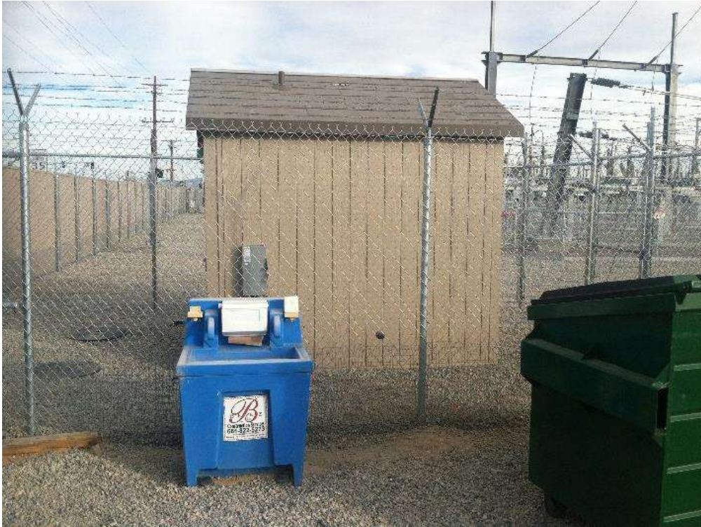
Figure 1 – Installation of a restroom facility was completed during the subject period. View east (12/3/15).