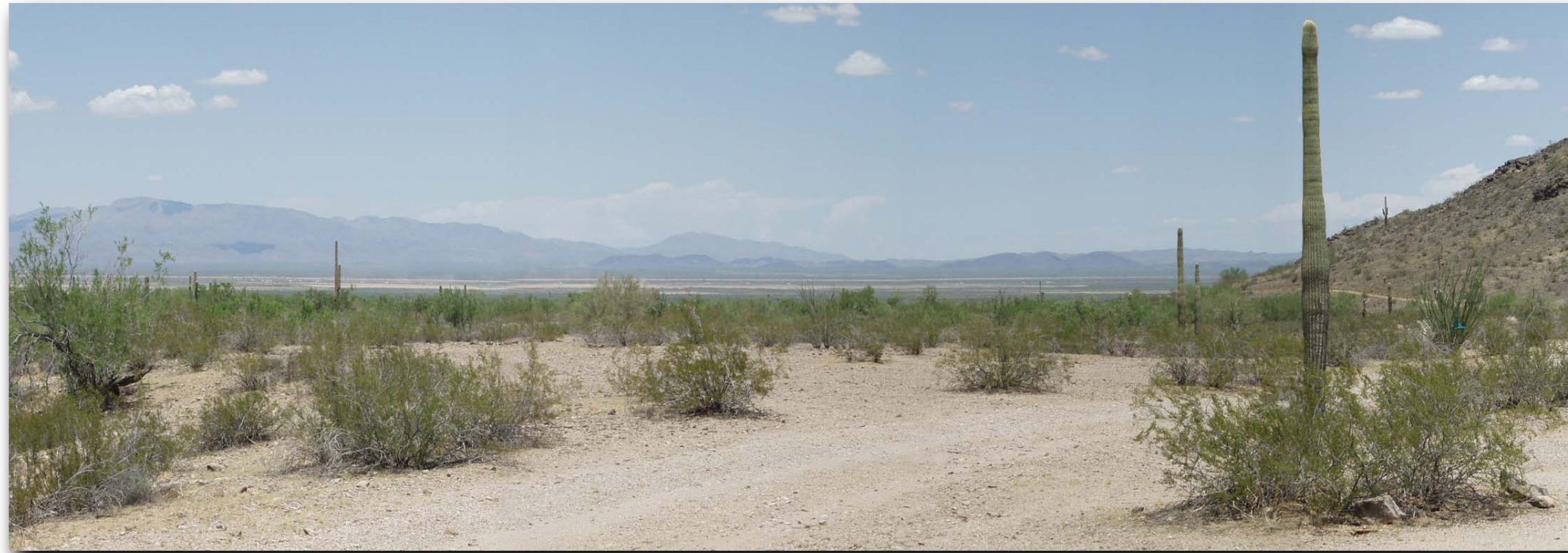
Existing Conditions - Looking northeast across the Harquahala Plain. Photograph taken 7/26/04 at 1:06 p.m. using a 50mm focal length.