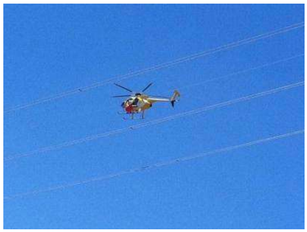
Figure 1. Marker ball installation between Towers 1111 and 1112.