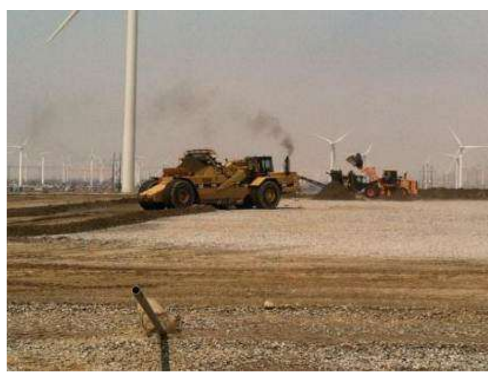
Figure 6. Yard close-out activities at the Devers 2 Yard.