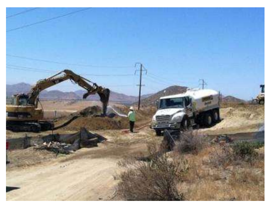
Figure 2. Site stabilization activities at Tower 1114.