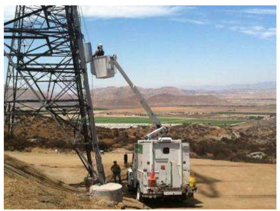
Figure 3. Telecommunication splicing work at Tower 1128.