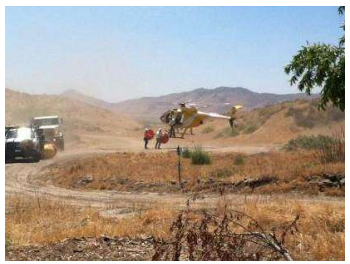
Figure 4. Helicopter work occurring in unapproved area near Tower 1112