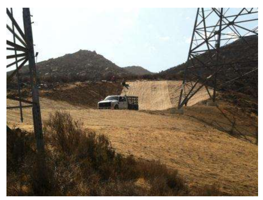
Figure 1. BMP repair at Tower 1081 due to fire damage.