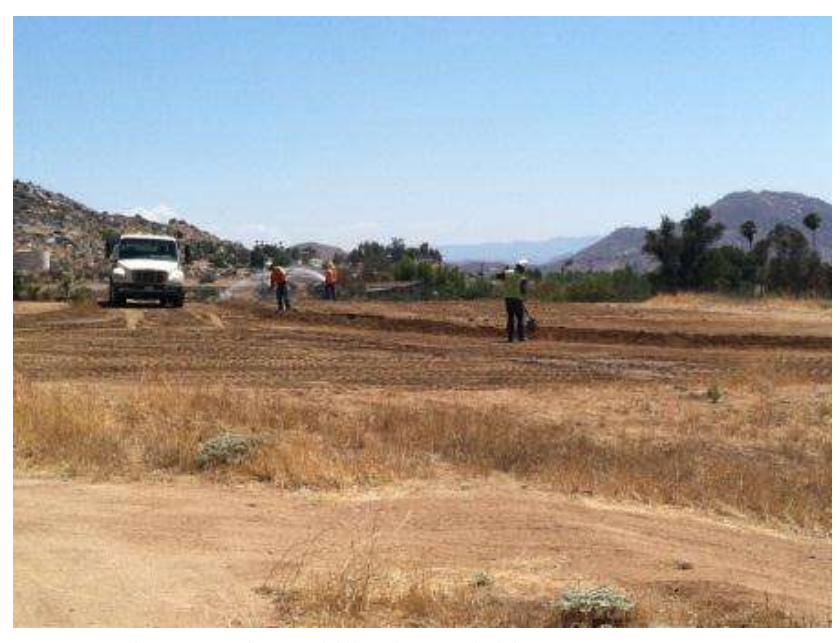
Figure 3. Site Stabilization activities at Tower 1146.