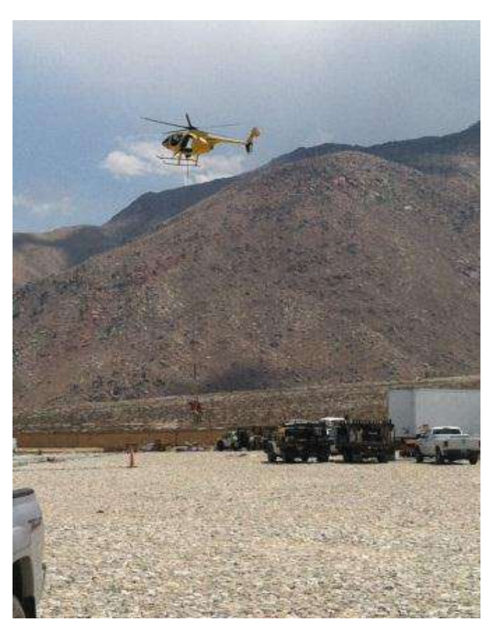
Figure 2. Wire crew members being long-lined from HLZ H1X to Tower 1040 during wire stringing activities.