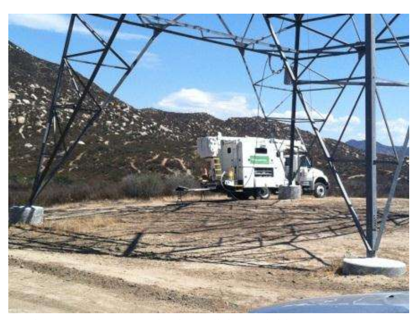
Figure 4. Telecommunication splicing activities at Tower 1094.