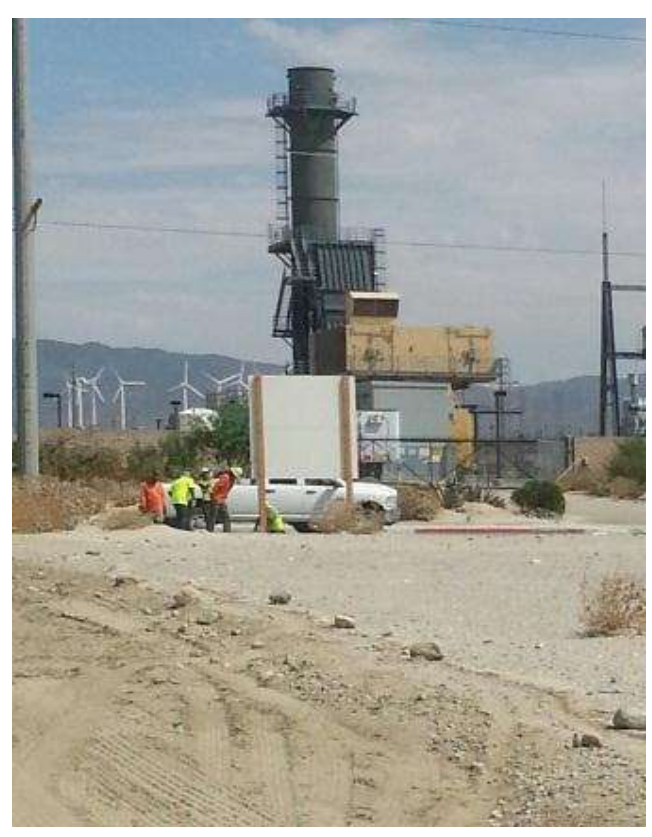
Figure 5. Fugitive dust contact information sign being removed at the Devers 2 Yard as part of the final close-out of the site.