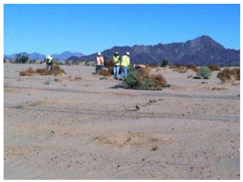
Figure 1. Weed removal at Wire Sites near Tower 2649.