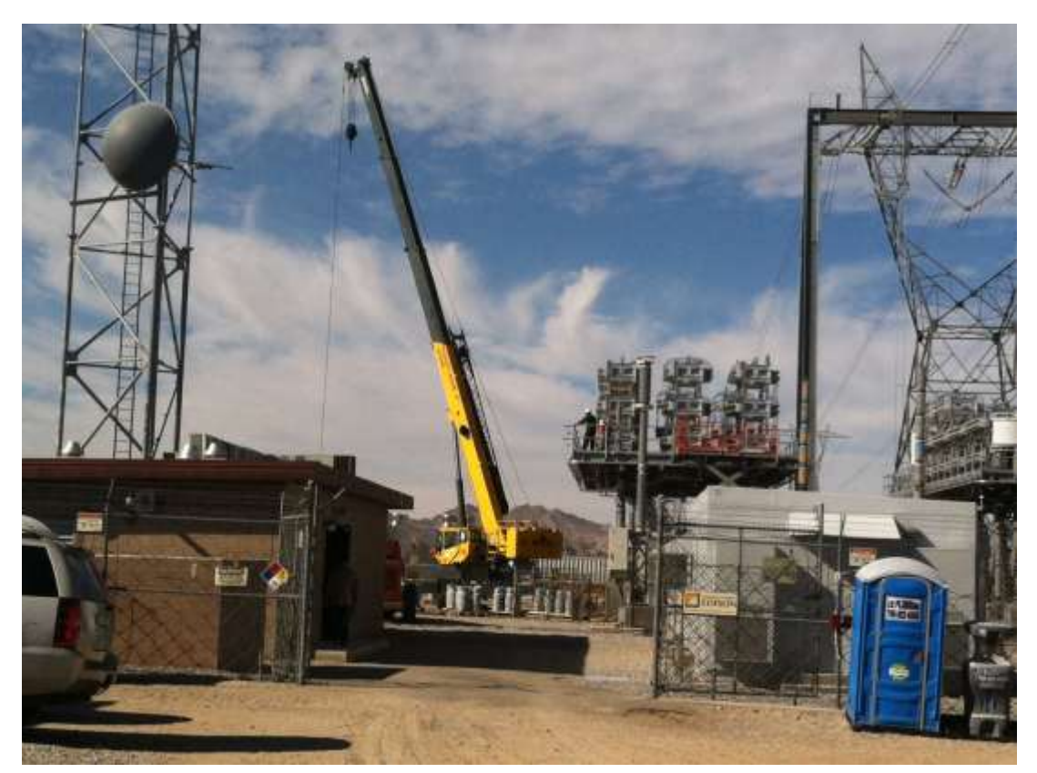
Figure 4. Construction activities at the Series Capacitor site.