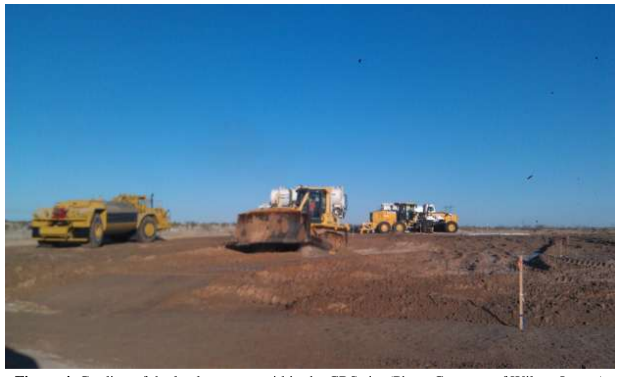
Figure 4. Grading of the laydown area within the CRS site