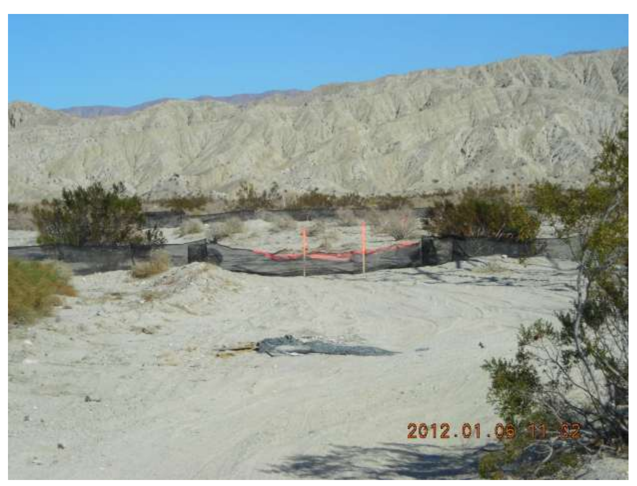
Figure 1. Intact and undamaged Exclusionary Fencing at Tower 2132.