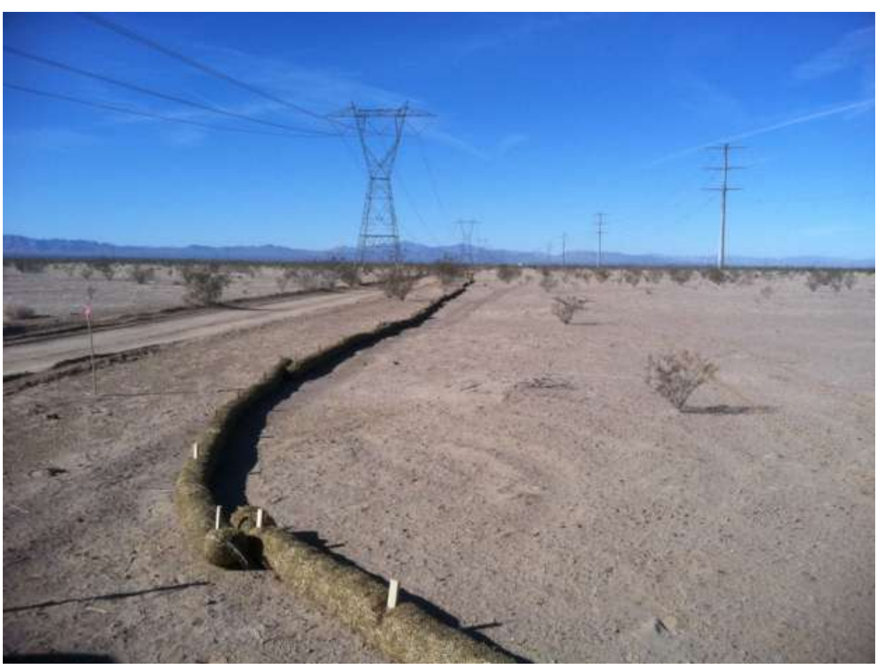
Figure 2. BMP installation along the access road to CRS from Wiley's Well Road.