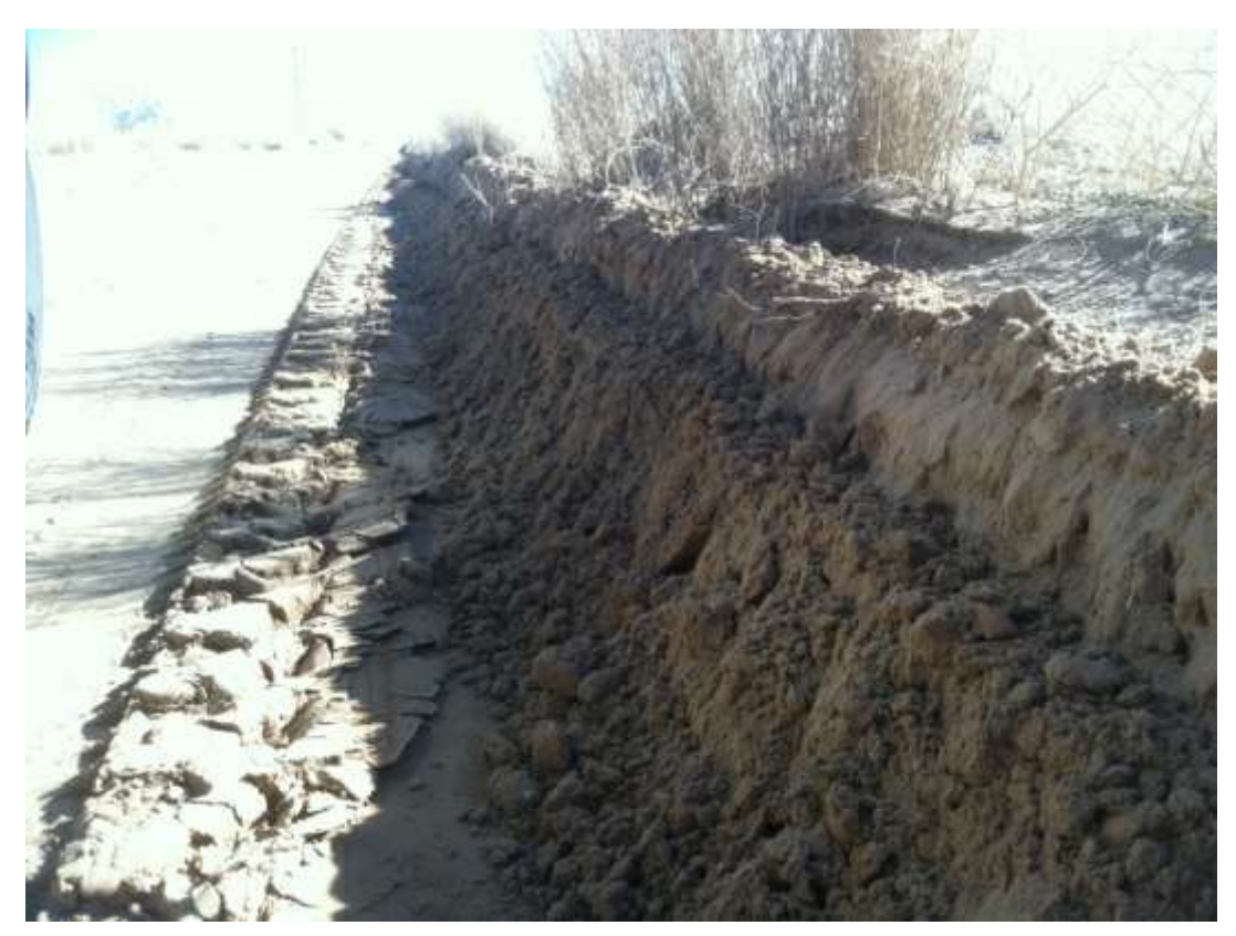
Figure 5. Road berms along the access road to CRS.