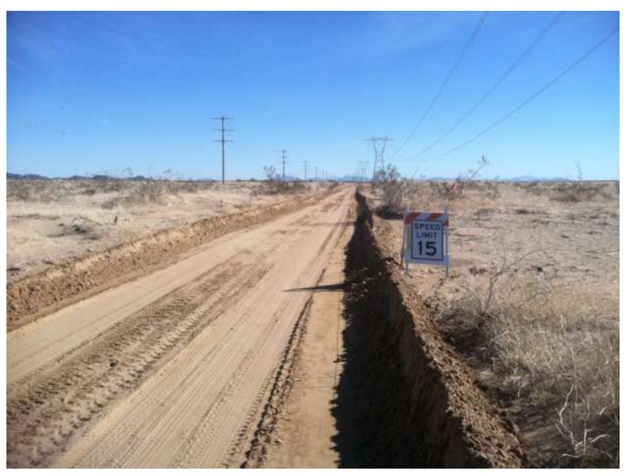
Figure 3. Speed Limit signs along the access road to CRS.