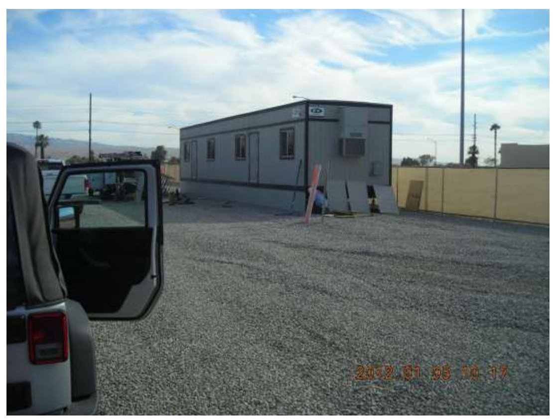
Figure 6. Office Trailer Skirting at Indio 2 Yard.