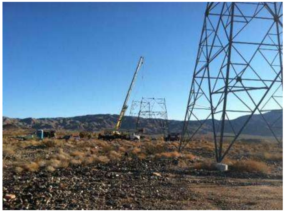
Figure 5. Tower assembly at Tower 2318.