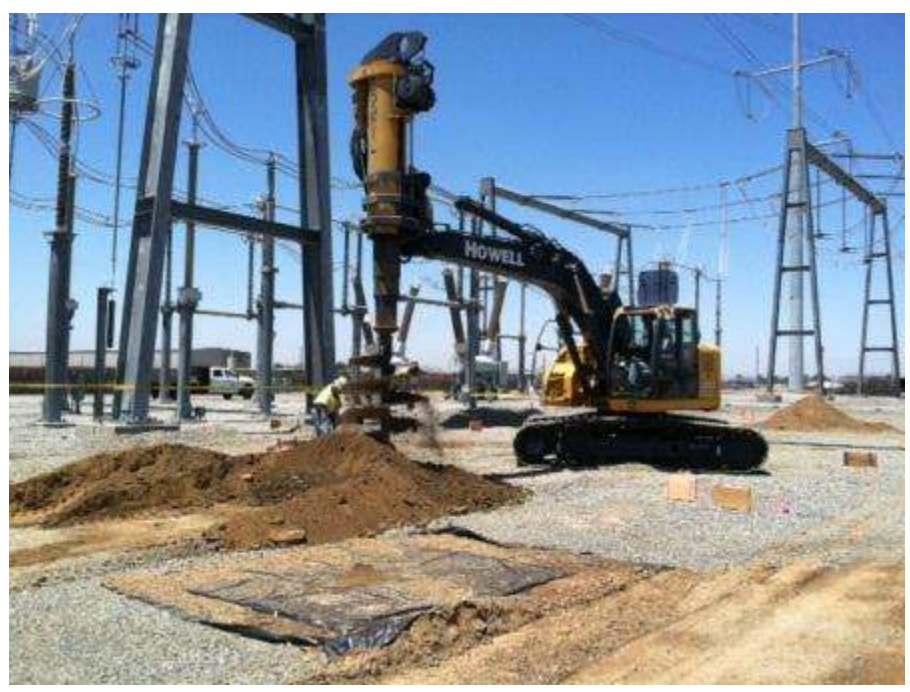
Figure 9. Drilling activities within the Valley Substation. As seen in the foreground of the photo, the excavations were well covered when not in use.