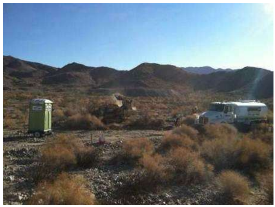
Figure 3. Vegetation clearing activities at Tower 2313.