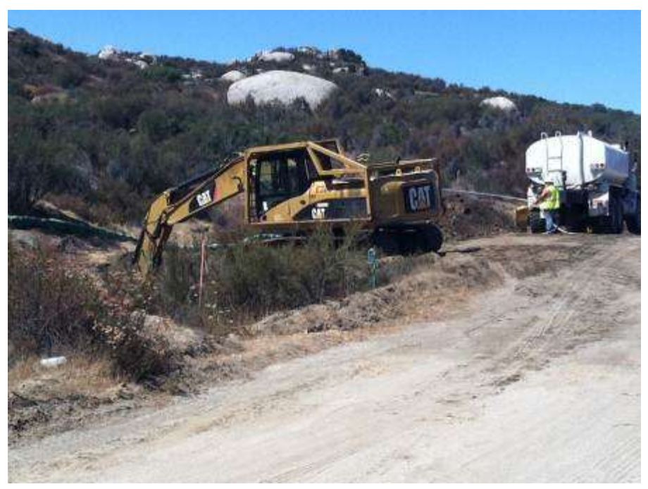
Figure 6. Grading activities at Tower 1138. Fugitive dust was continually controlled by a crew member spraying the excavation with water.