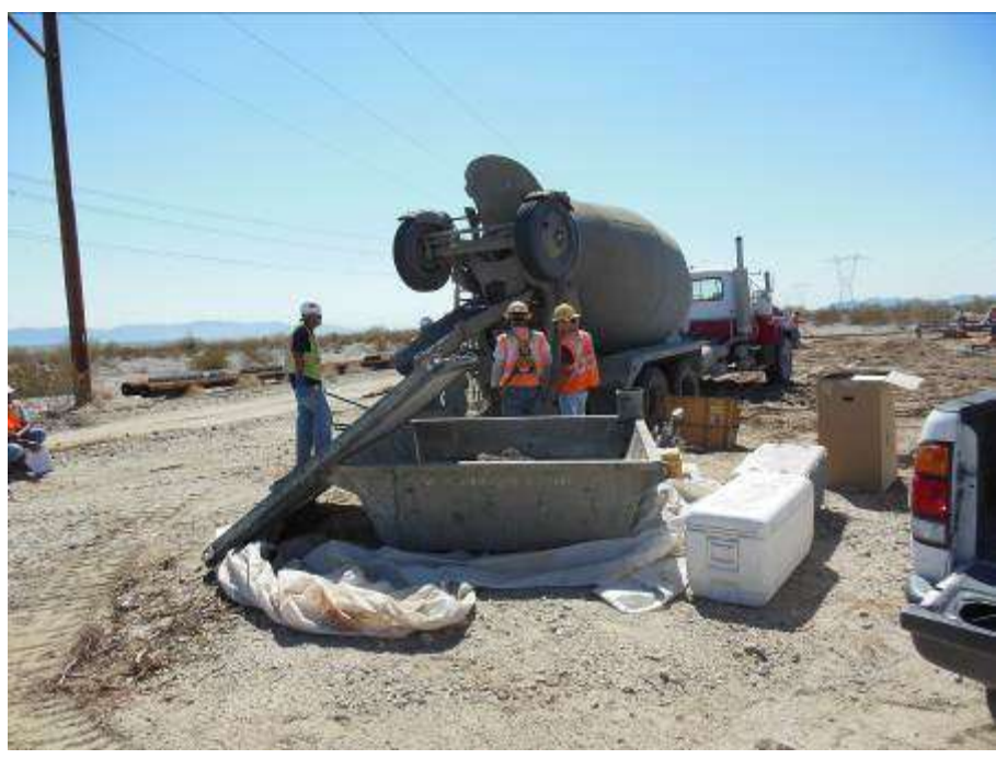
Figure 1. Concrete pouring activities at Tower 2555.