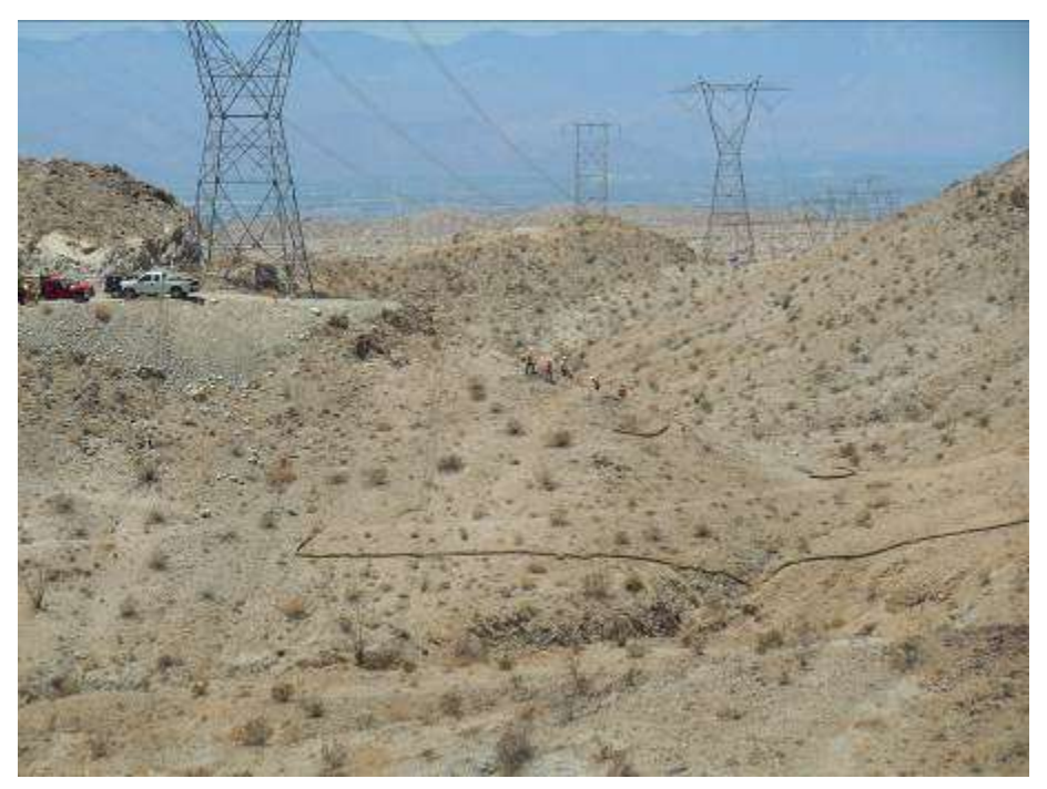
Figure 2. BMP installation at Tower 2310.