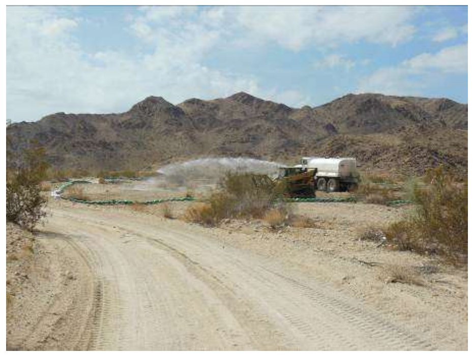
Figure 4. Vegetation clearing activities at HLZ H5.