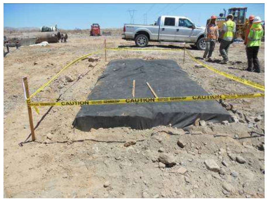
Figure 7. Excavations like the one identified in the photograph were adequately covered throughout the subject period.