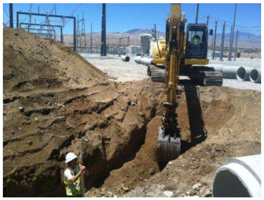
Figure 8. Trenching activities within the Devers Substation for the installation of a new sewer line.