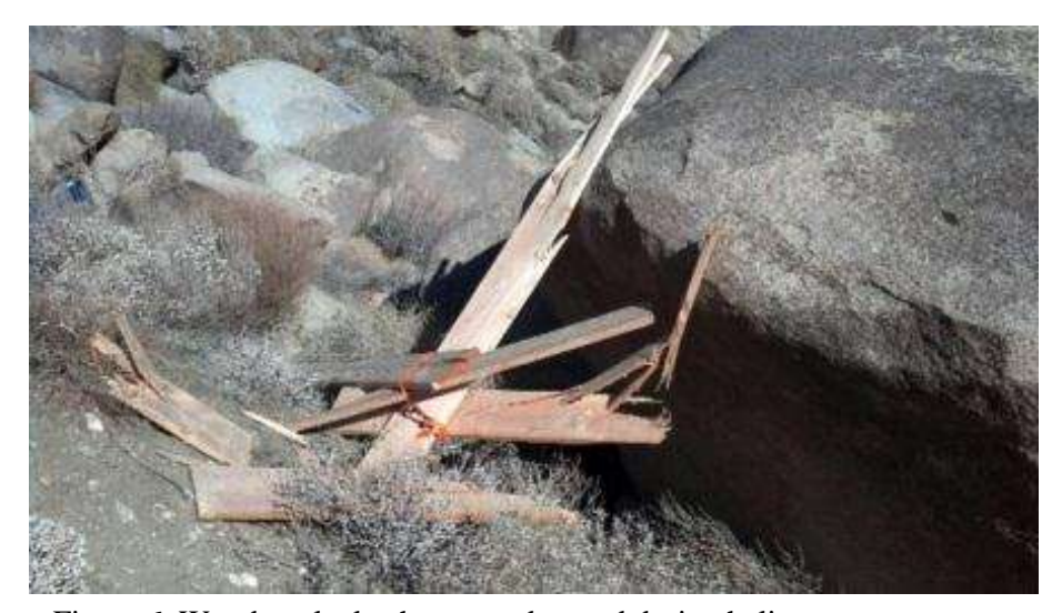
Figure 6. Wooden planks that were dropped during helicopter transport to Helicopter Landing Zone H1X.