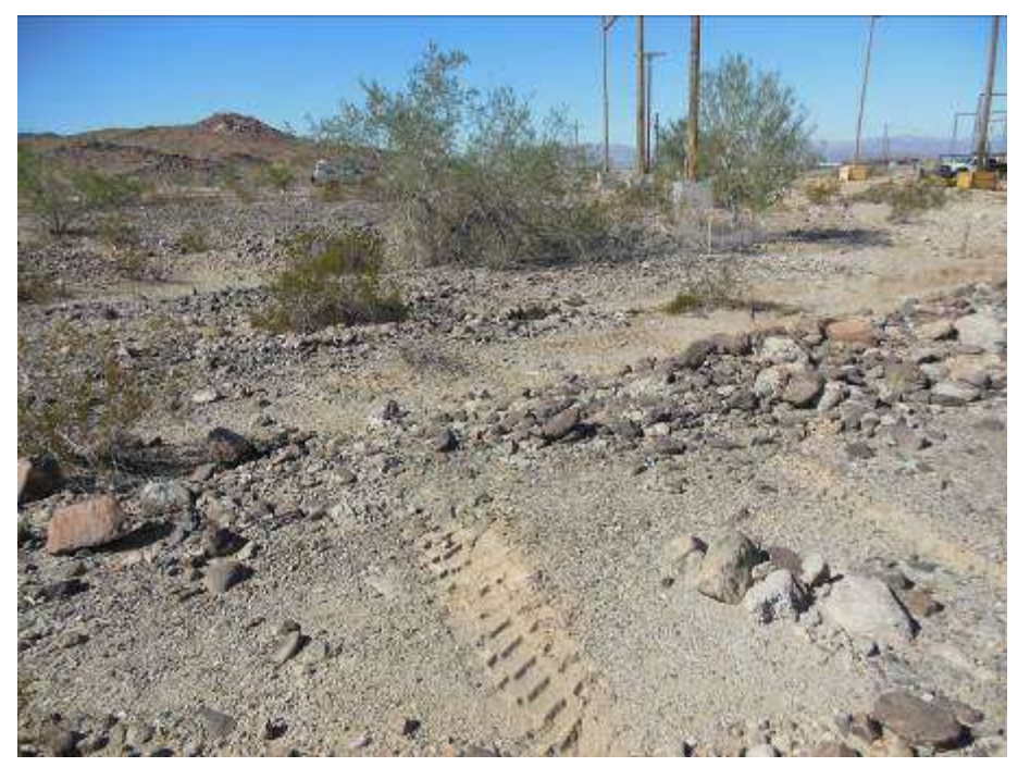
Figure 5. Rubber tire tracks as a result of work outside of approved limits at RB-GS06A. Note staking of limits in background.