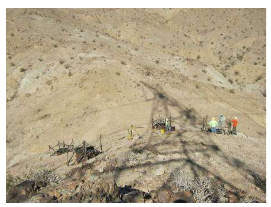
Figure 2. Foundation pouring preparation activities at Tower 2309.