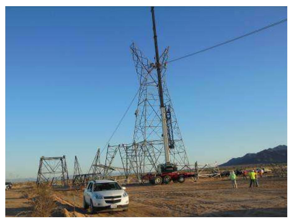
Figure 1. Wreck-out of existing DPV1 Tower M129-T1.