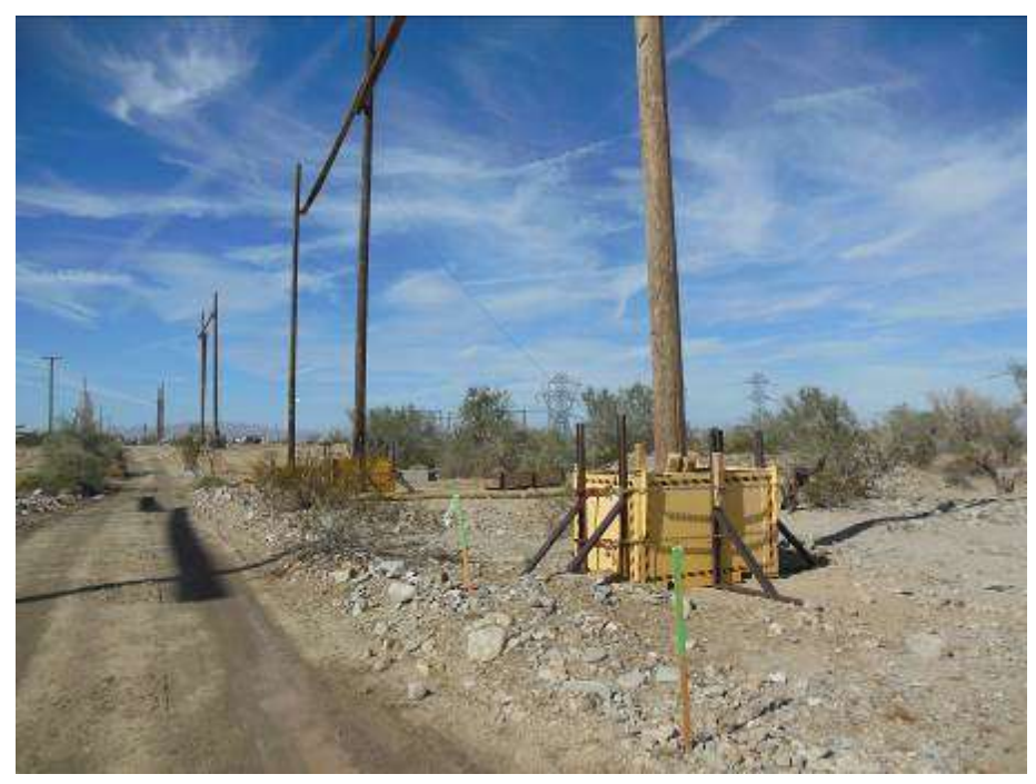
Figure 7. Flower pot installed outside of approved disturbance limits at RB-GS05. NCR #12 was consequently issued on November 2.