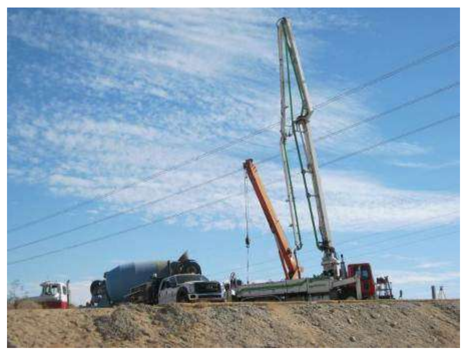
Figure 3. Foundation pouring activities at Tower 2312.