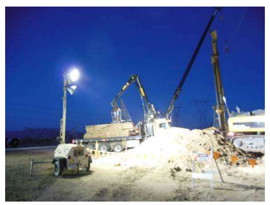
Figure 8. Proper implementation of Temporary Lighting Plan observed during drilling activities at Tower RB1-1W.