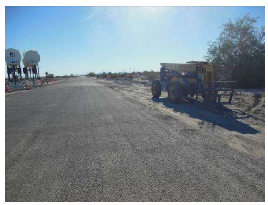
Figure 1. Forklift staged in unapproved area along Chuckwalla Road.