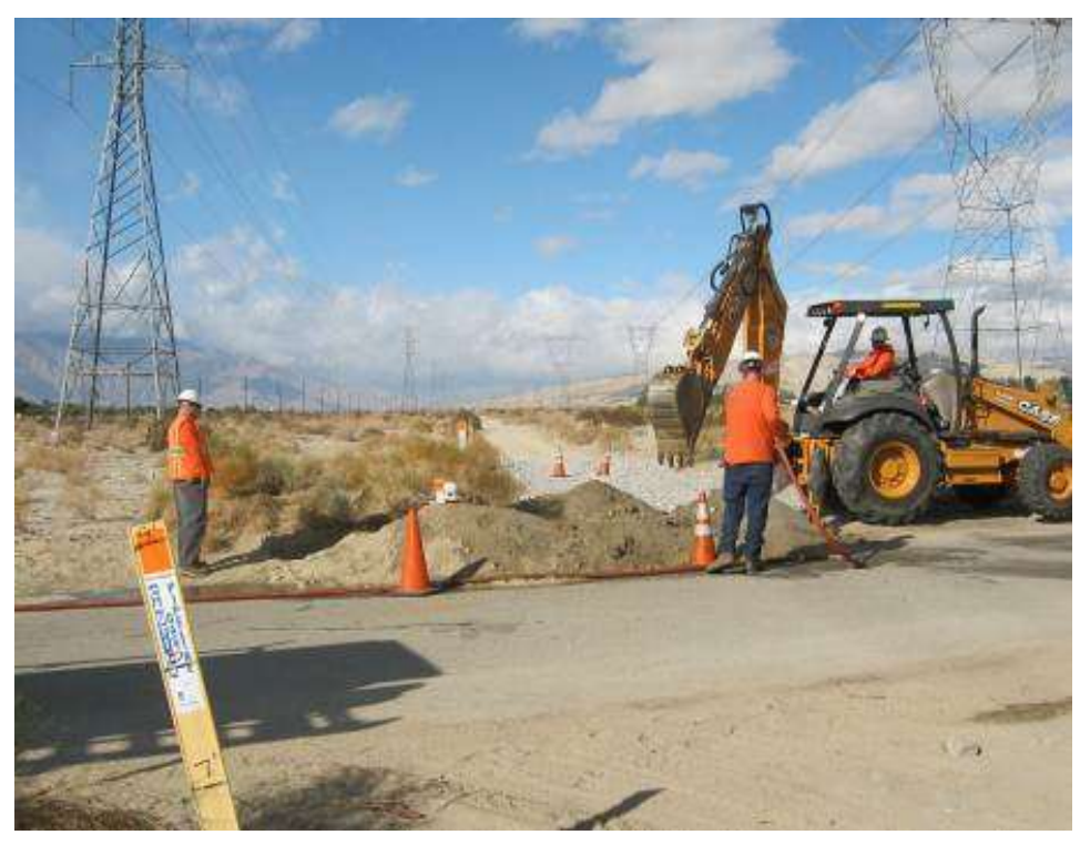
Figure 3. Trenching activities associated with the Mirage Substation Loop-Ins.