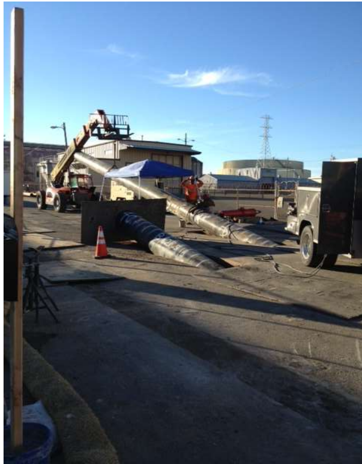
Figure 3 – HDD equipment being staged at 23 rd Street. View northwest, October 29, 2014.