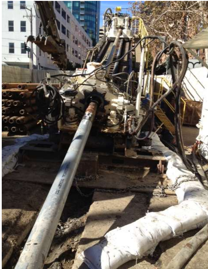
Figure 2 – New large HDD equipment being set up on Spear Street. View west, October 29, 2014.