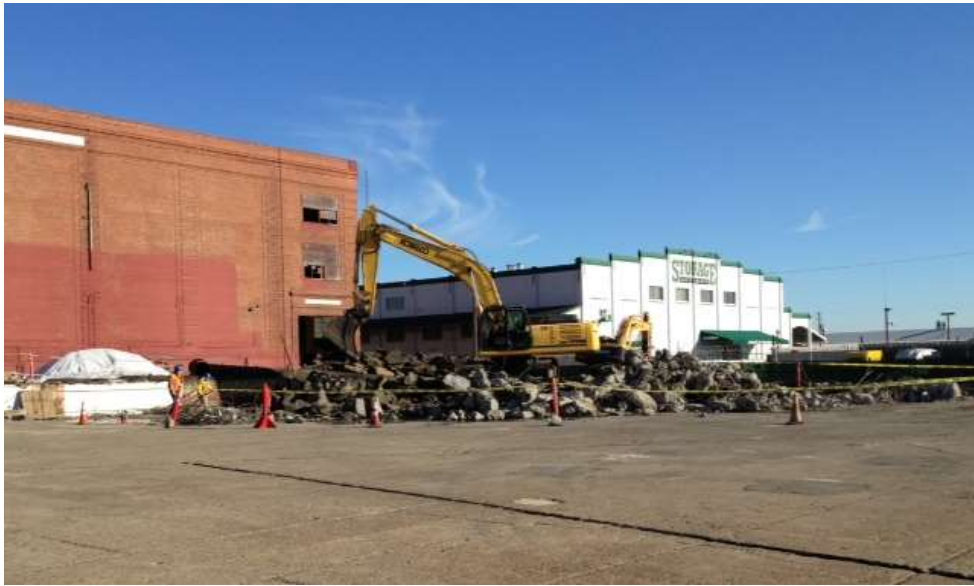
Figure 1 – Demolition of foundations at Potrero Switchyard. View southeast, October 29, 2014.