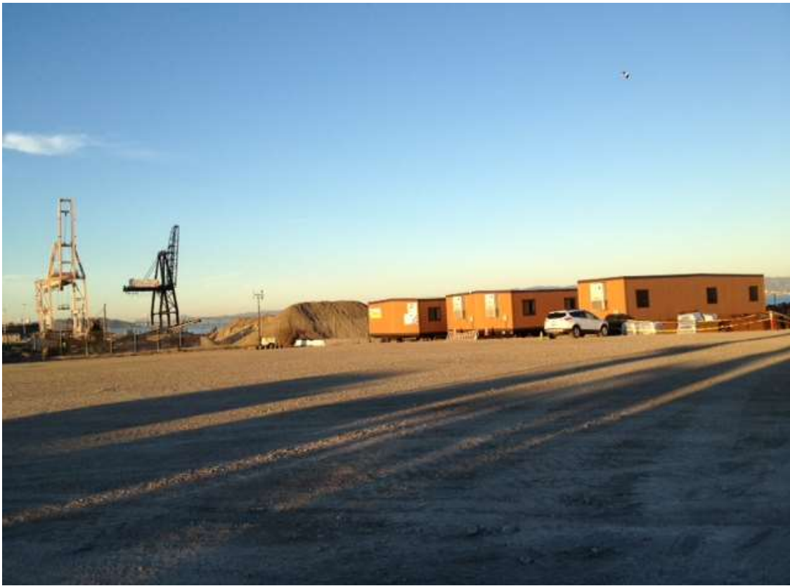
Figure 5 – Office trailers staged at Amador Yard. View northeast, October 29, 2014.