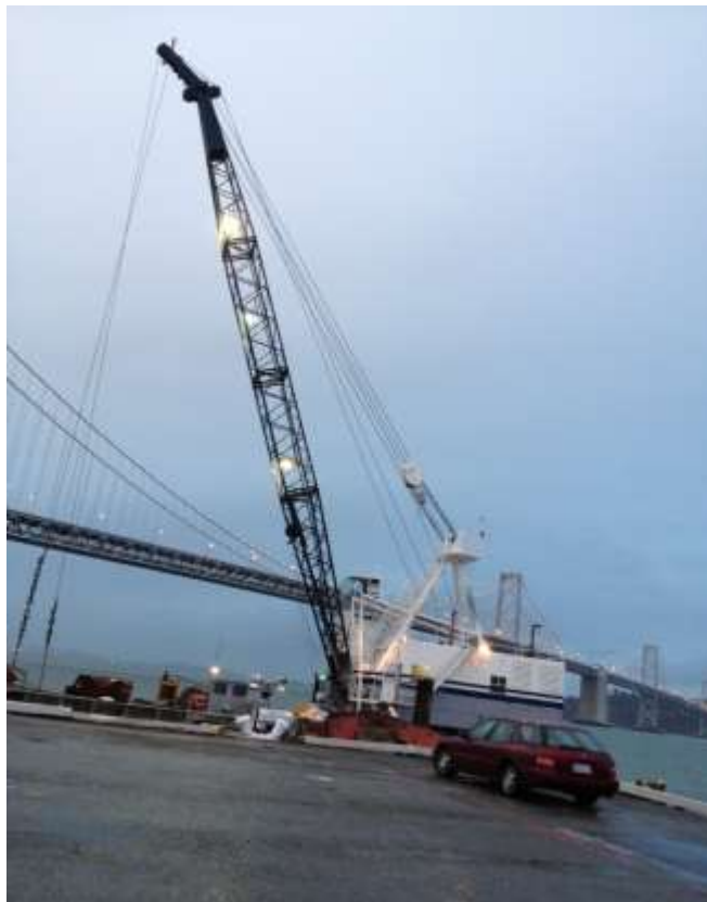
Figure 2 – Vortex at Bore 3 receiving pit at HDD North. View north, December 17, 2014.