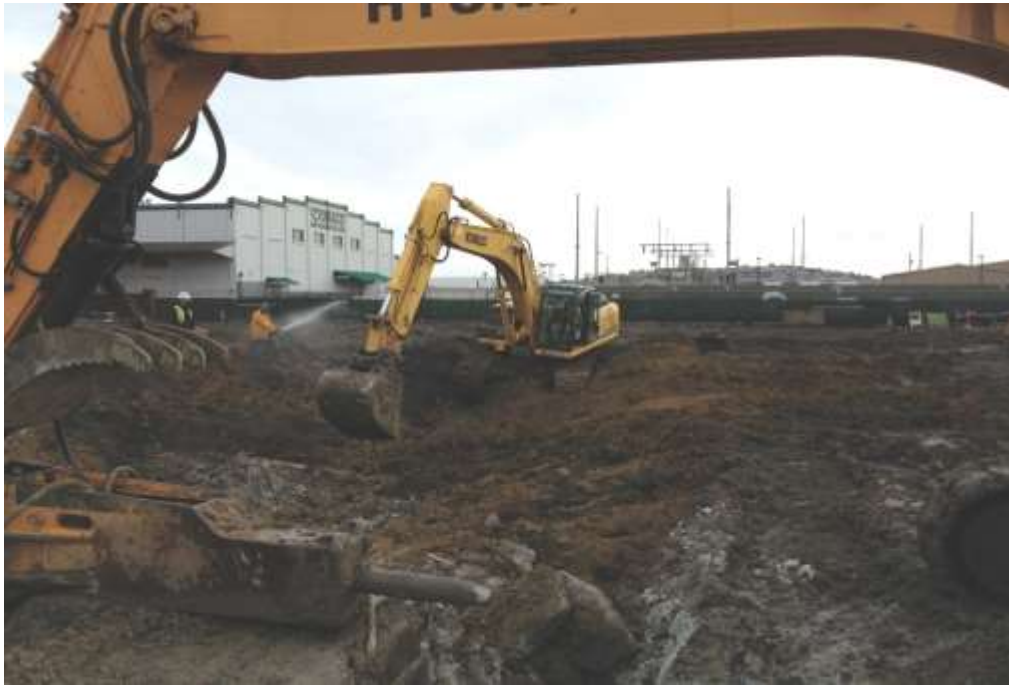
Figure 1 – Foundation demolition and excavation at Potrero Switchyard. View south, December 17, 2014.