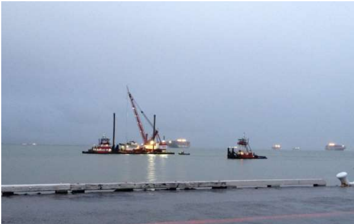
Figure 4 – Manson dredging just southeast of Pier 30/32. View southeast, December 17, 2014.