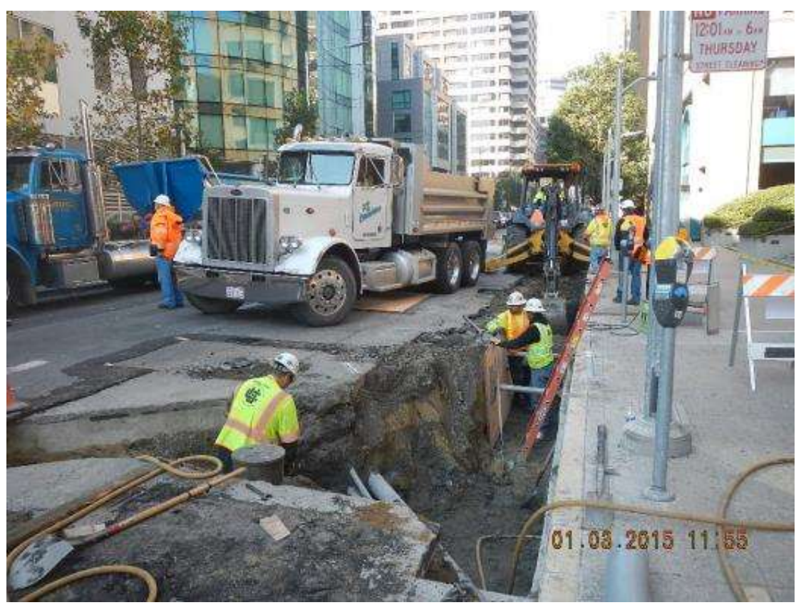
Figure 3 – Excavating for utility relocation on Spear Street. View west, January 3, 2015.