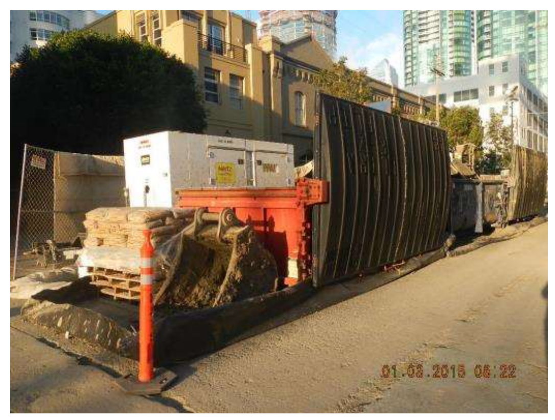
Figure 1 – HDD North secondary containment for bentonite. View southwest, January 3, 2015.