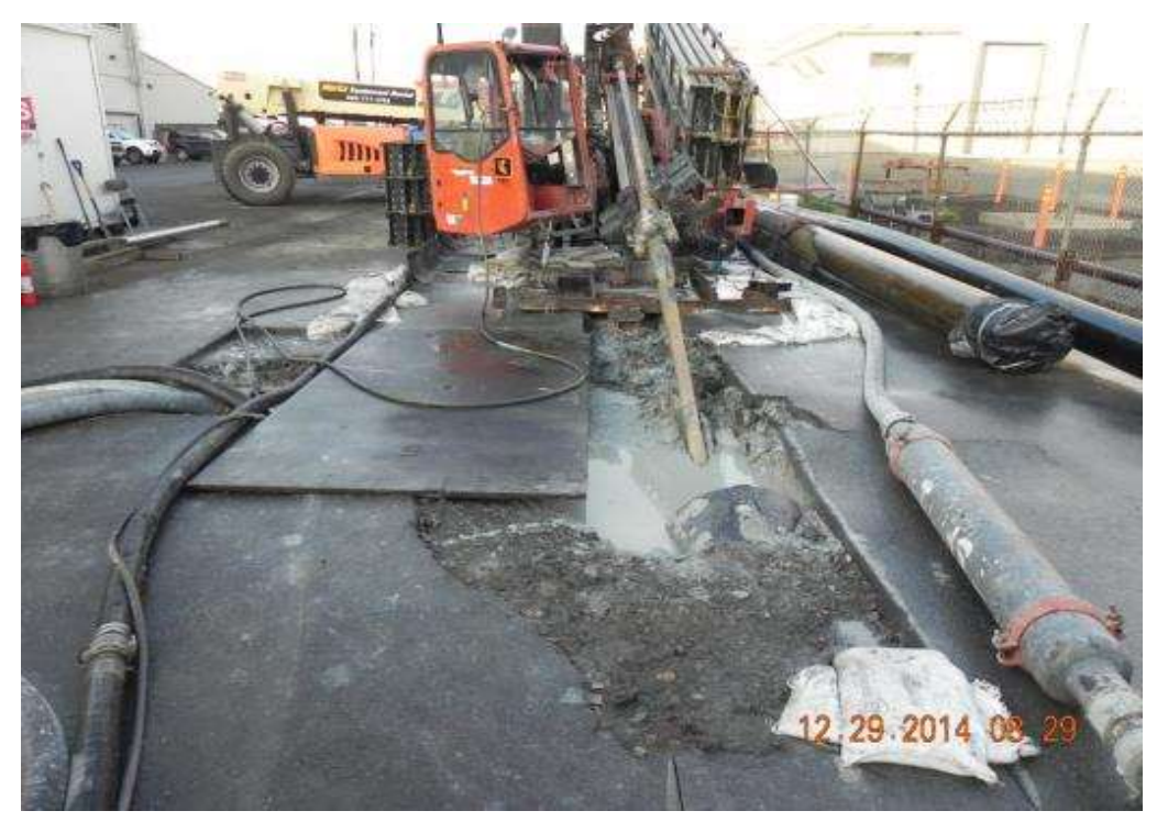
Figure 2 – HDD Company drilling at Bore 3 at HDD South. View west, December 29, 2014.