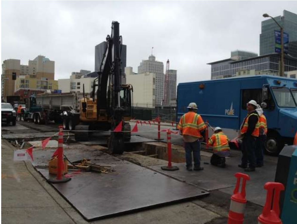
Figure 1 – Location where 12 kV line was hit while excavating duct bank trench on Folsom Street between 1 st Street and Fremont Street. View southwest, September 22, 2015.