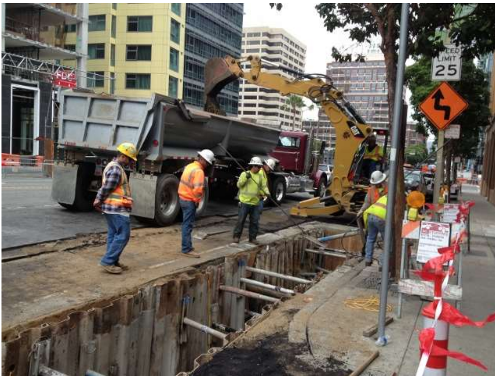
Figure 2 – Excavating on Folsom Street between Fremont and Beale Streets. View northwest, September 22, 2015.