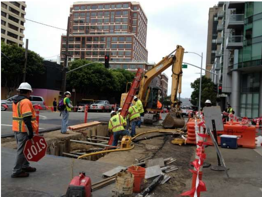
Figure 3 – Excavating on Folsom Street between Beale and Main Streets. View northwest, September 22, 2015.