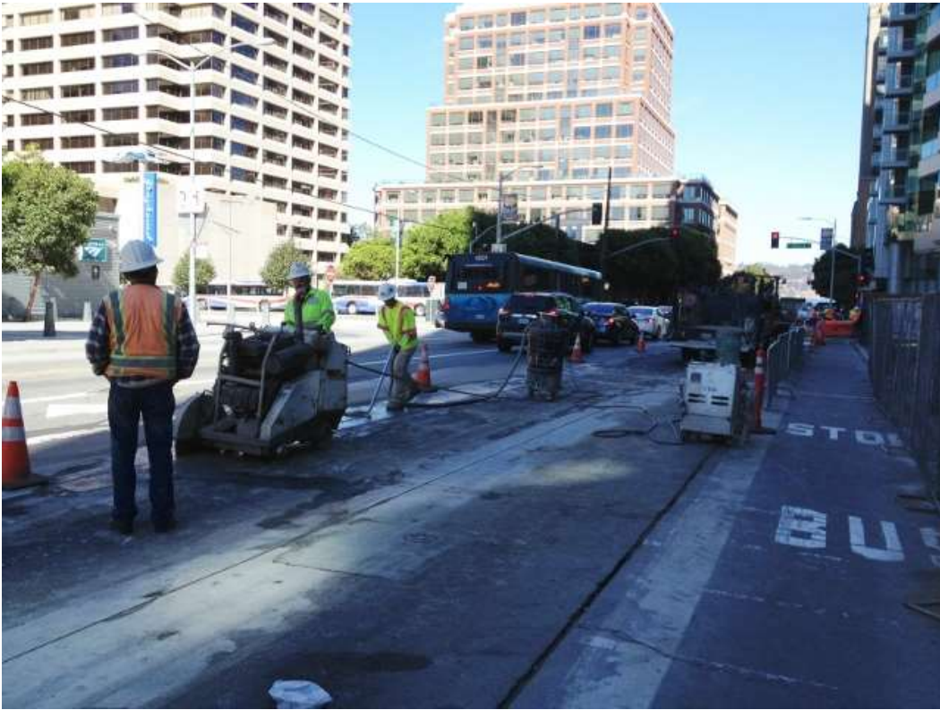
Figure 3 – Saw cutting pavement on Folsom Street between Beale and Main Streets. View south, October 20, 2015.