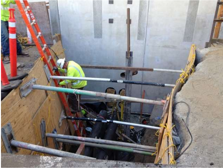
Figure 1 – Installing conduit just outside the new Embarcadero Substation addition. View east, October 20, 2015.