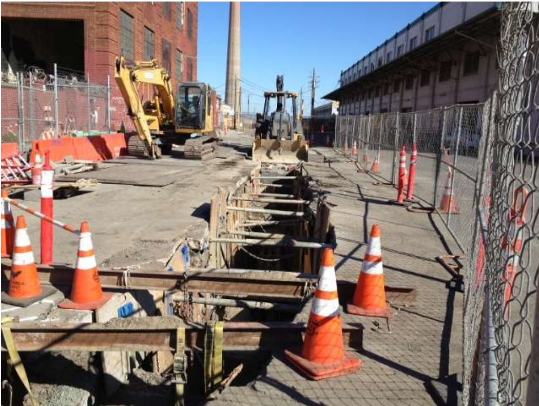
Figure 4 – Installing conduit within the trench on 23 rd Street. View east, October 20, 2015.