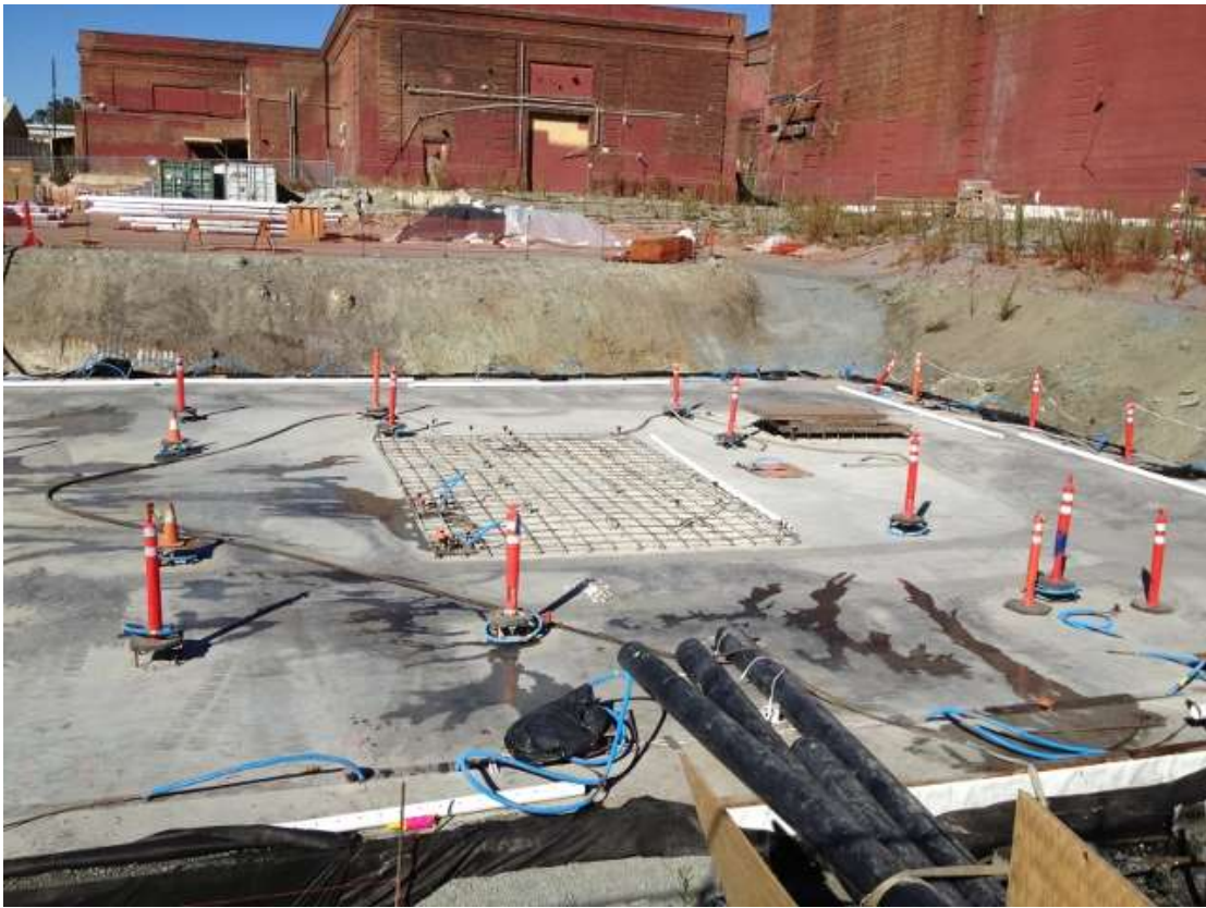
Figure 5 – Installing drains around the GIS building foundation at the Potrero Switchyard. View north, October 20, 2015.