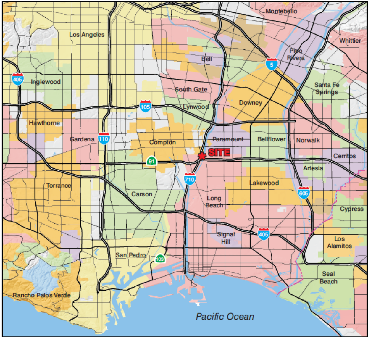
Figure 1. Regional Location