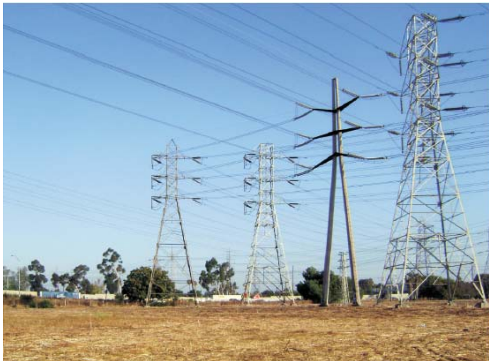
View of Site Looking Northwest, Interstate I-710 in Background