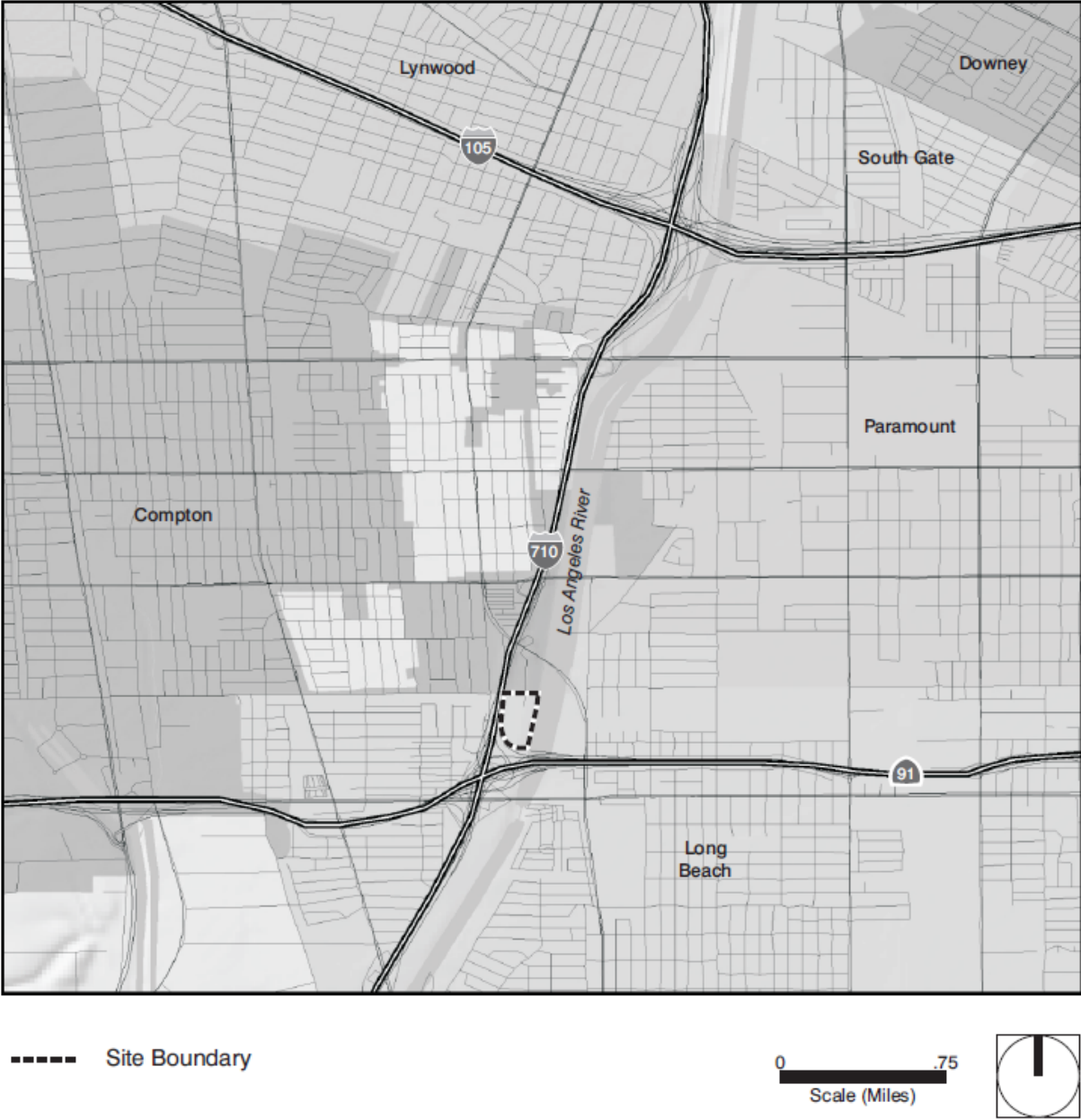
Figure 2. Local Vicinity