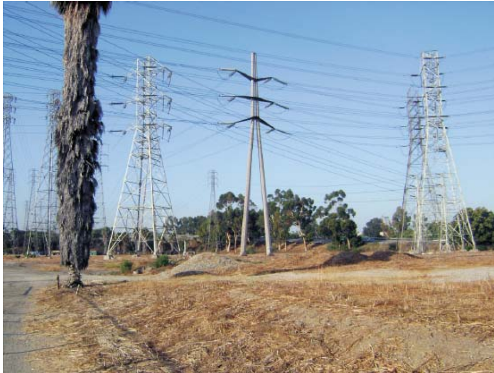
View of Site Looking South