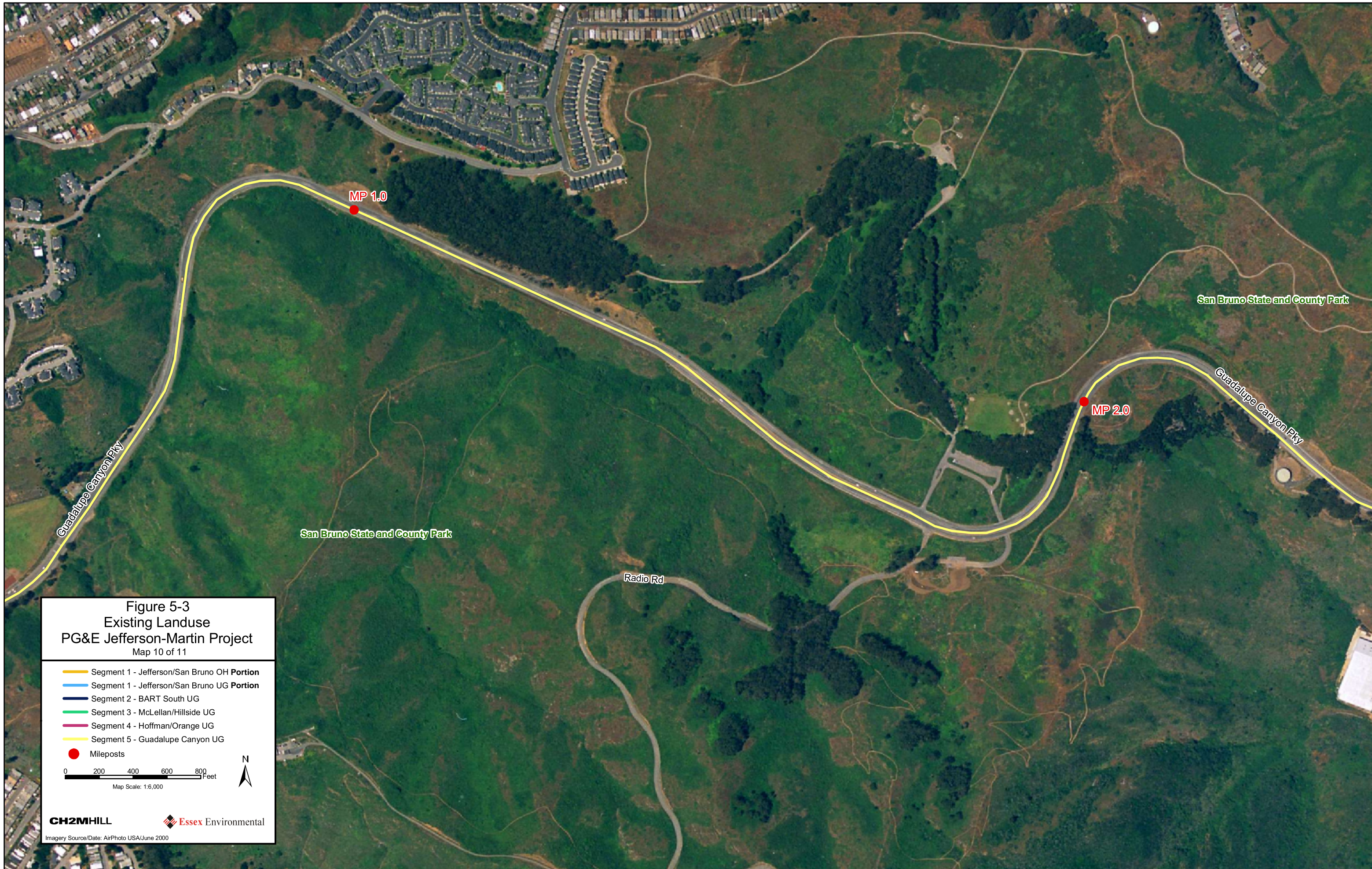
Figure 5-3 Existing Landuse PG&E Jefferson-Martin Project Map 10 of 11