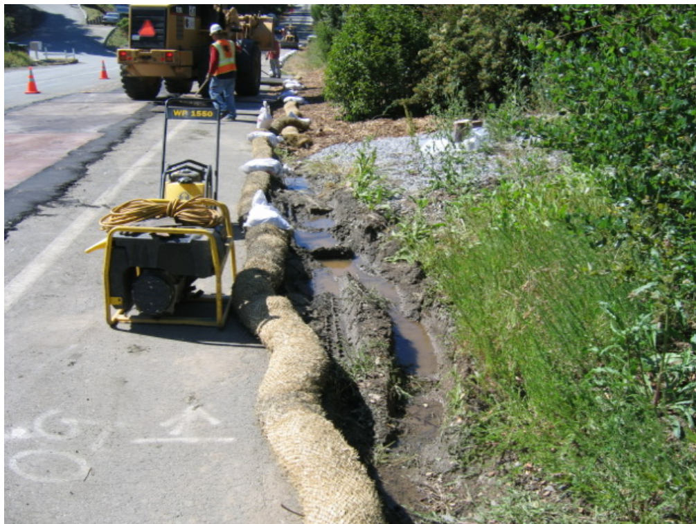
Figure 2 – Location of gas can staged near roadside drainage in trenching area on Skyline Boulevard near Manhole #35, Segment 2 Underground, June 22, 2005