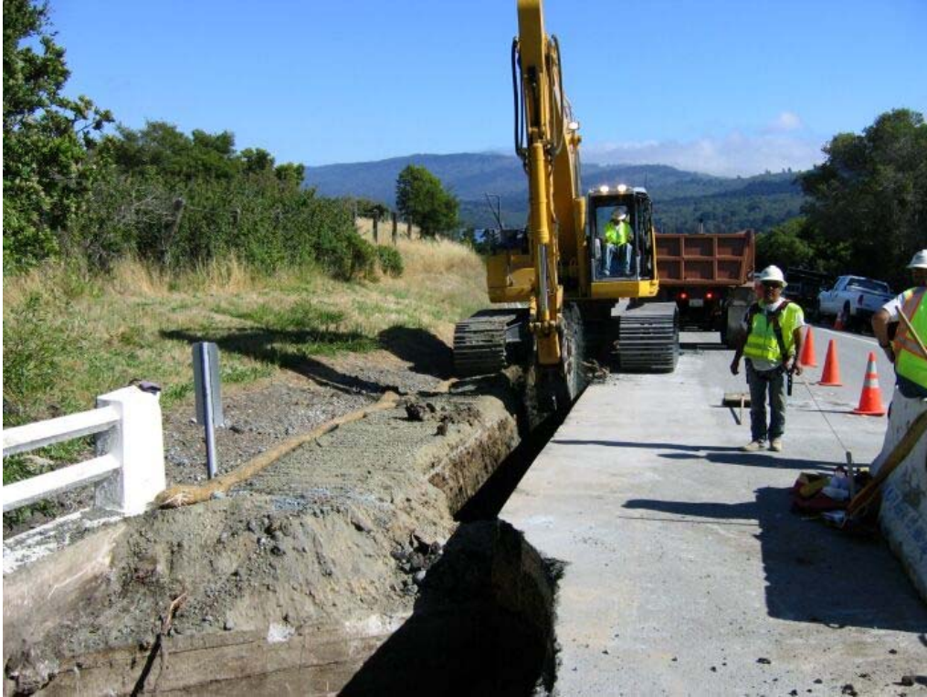
Figure 1 – Trenching activities between Manholes #24 and #25, Segment 1, June 22, 2005