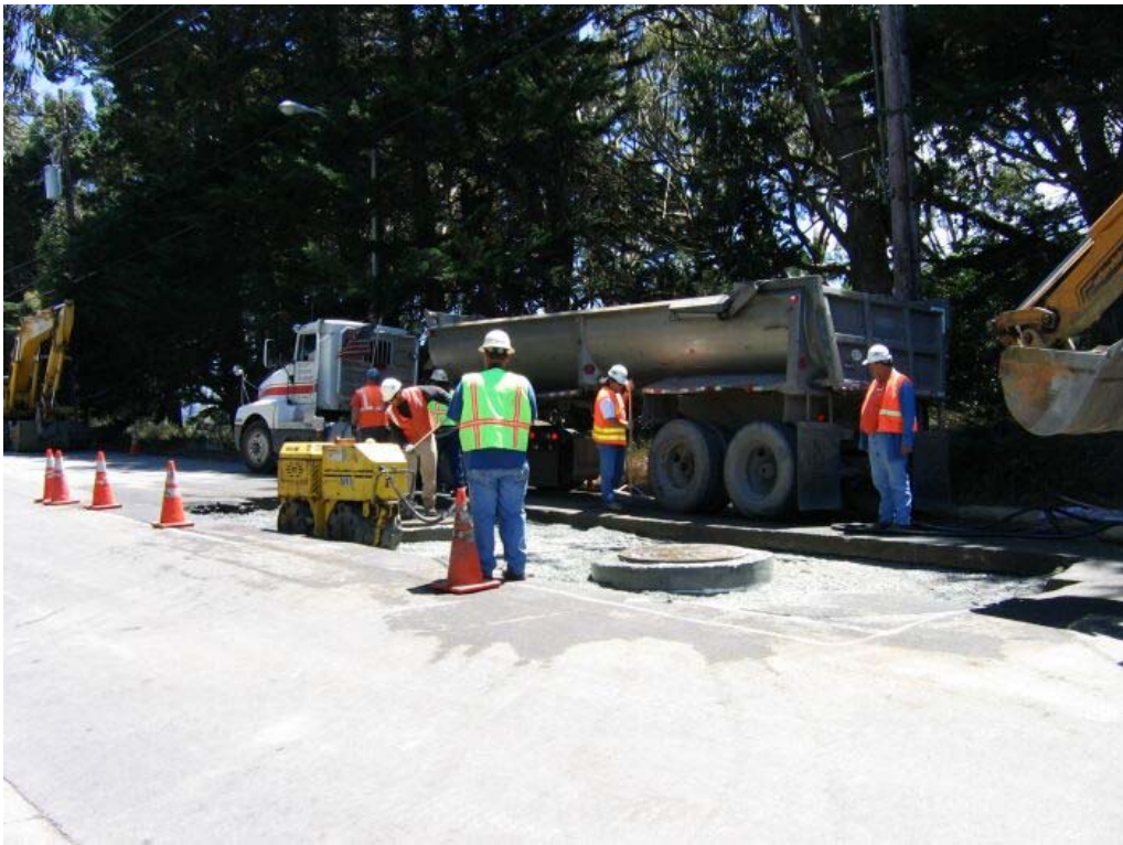
Figure 3 – Crews compacting base rock over backfilled Manhole #39 vault, Segment 3, June 21, 2005