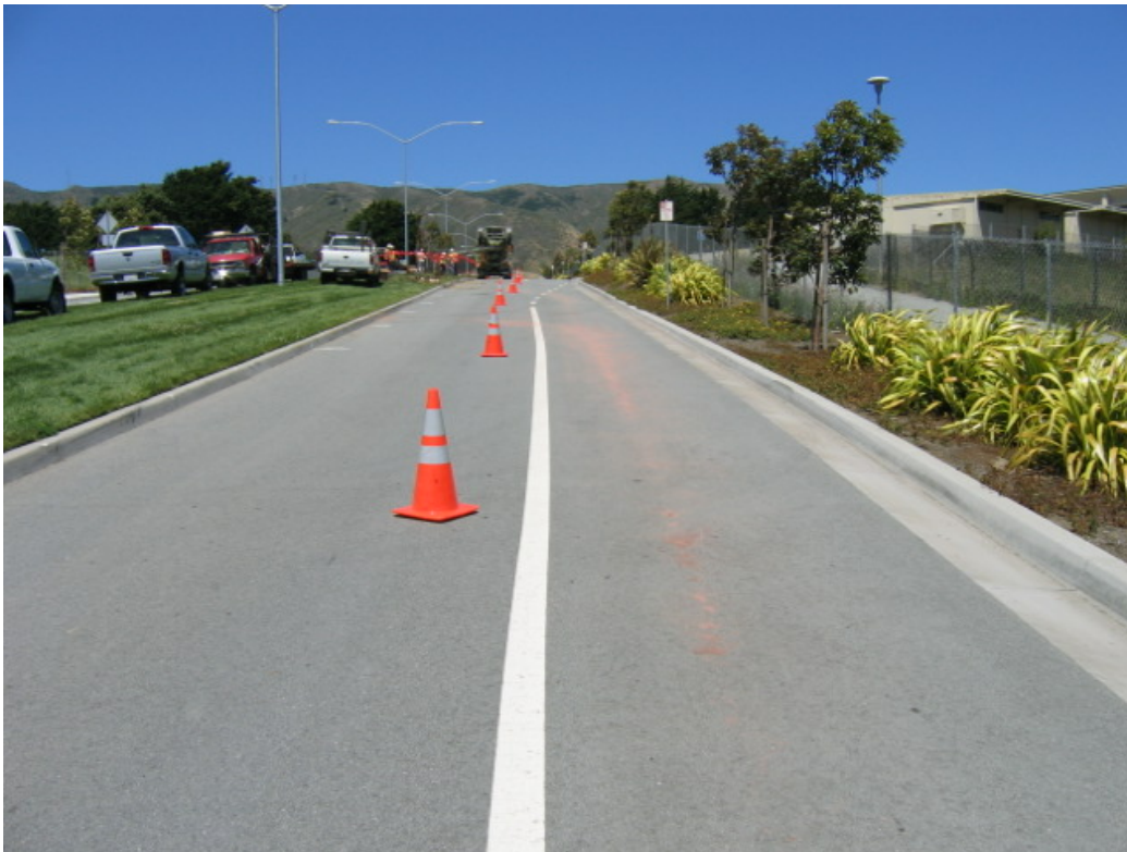
Figure 4 – Red cement slurry spill along Lawndale Drive in the Town of Colma, Segment 4, June 23, 2005.