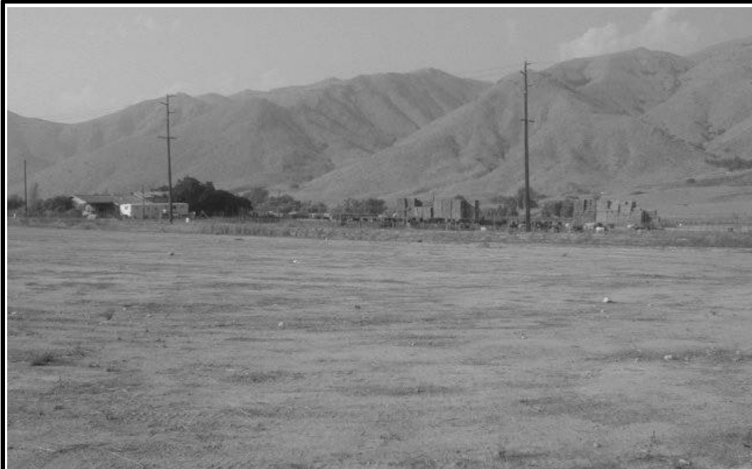
Photo D. Photo Taken from the Midpoint Between the South and Southwest Corners of the Western Parcel. Temescal Canyon Road, although not visible, runs parallel with the power-lines. Presley's Horsethief Ranch and associated residence can be seen in the distance.