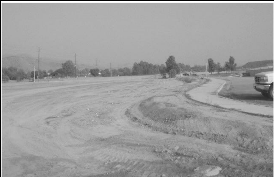
Photo B. Photo Taken from the Southwest Corner of the Eastern Parcel Facing East. Lester Circle is visible to the right. The eastern edge of the parcel coincides with the small eucalyptus to the right of center.