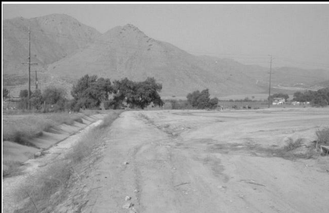
Photo A. Photo Taken from the Southwest Corner of Eastern Parcel Facing Northeast. The concrete-lined drainage that separates the two parcels is visible to the left. Temescal Canyon Road is not visible from this angle but runs parallel with the power-lines.