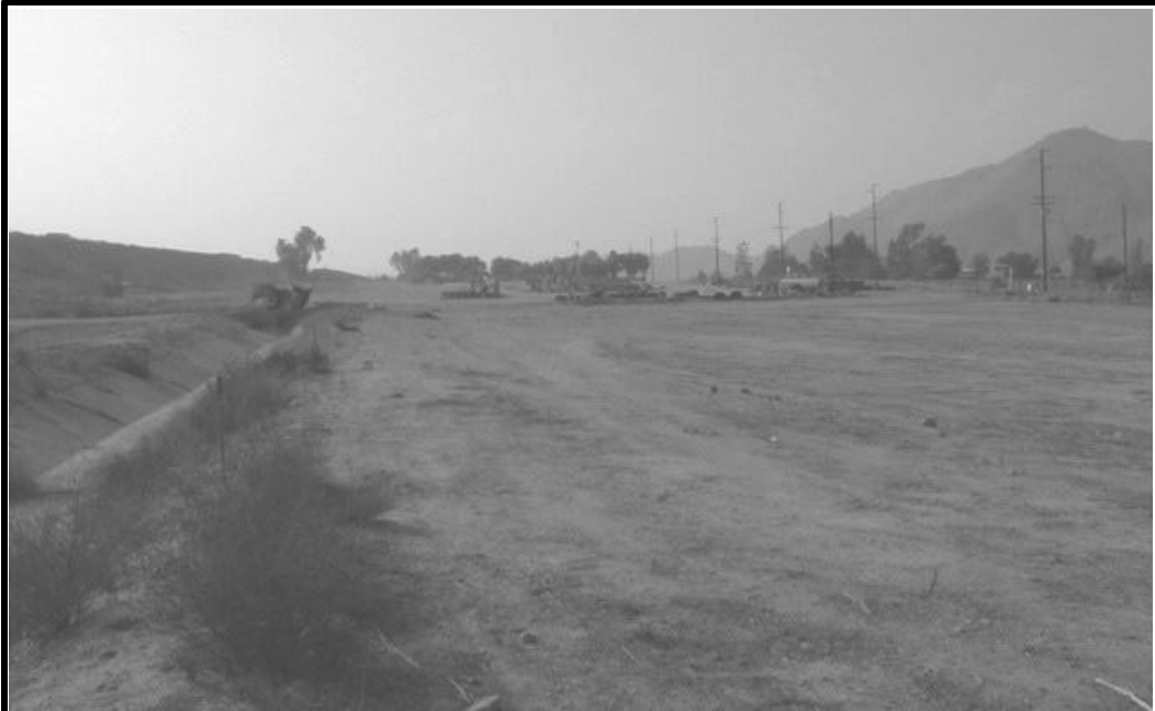
Photo C. Photo Taken from the South Corner of the Western Parcel. The concrete-lined drainage that runs along the southern and eastern edges is visible to the left. Construction equipment indicates the property boundary between site and an adjacent industrial storage yard.