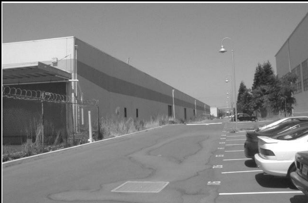
Photo D. View of East Face of Building from Adjacent Industrial Parking Lot.