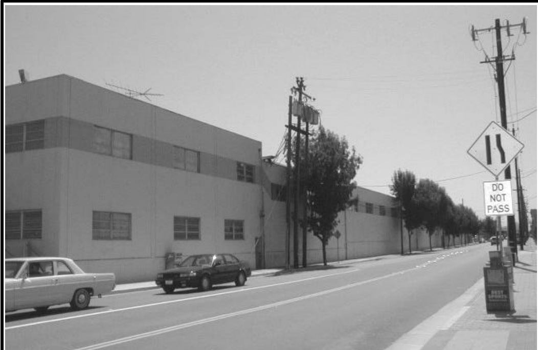
Photo B. View of West Face of Building from Across Hollis Street.