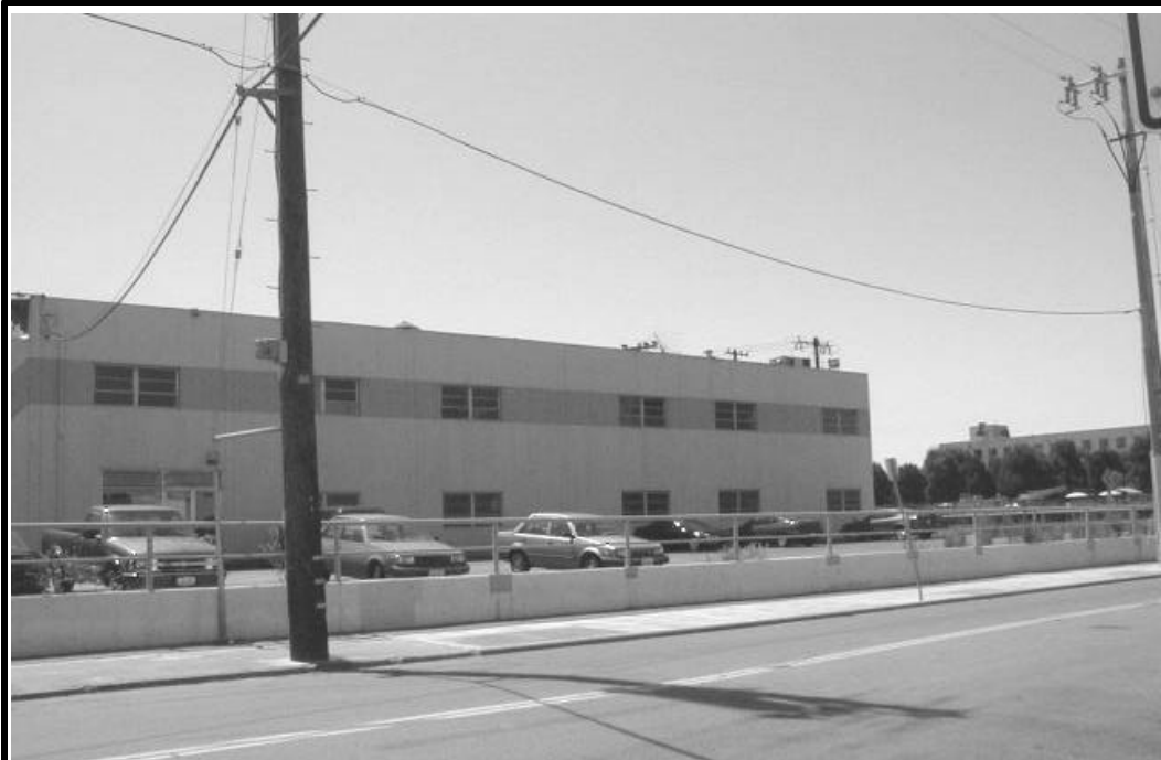
Photo A. View of North Face of Building from Across 53rd Street.