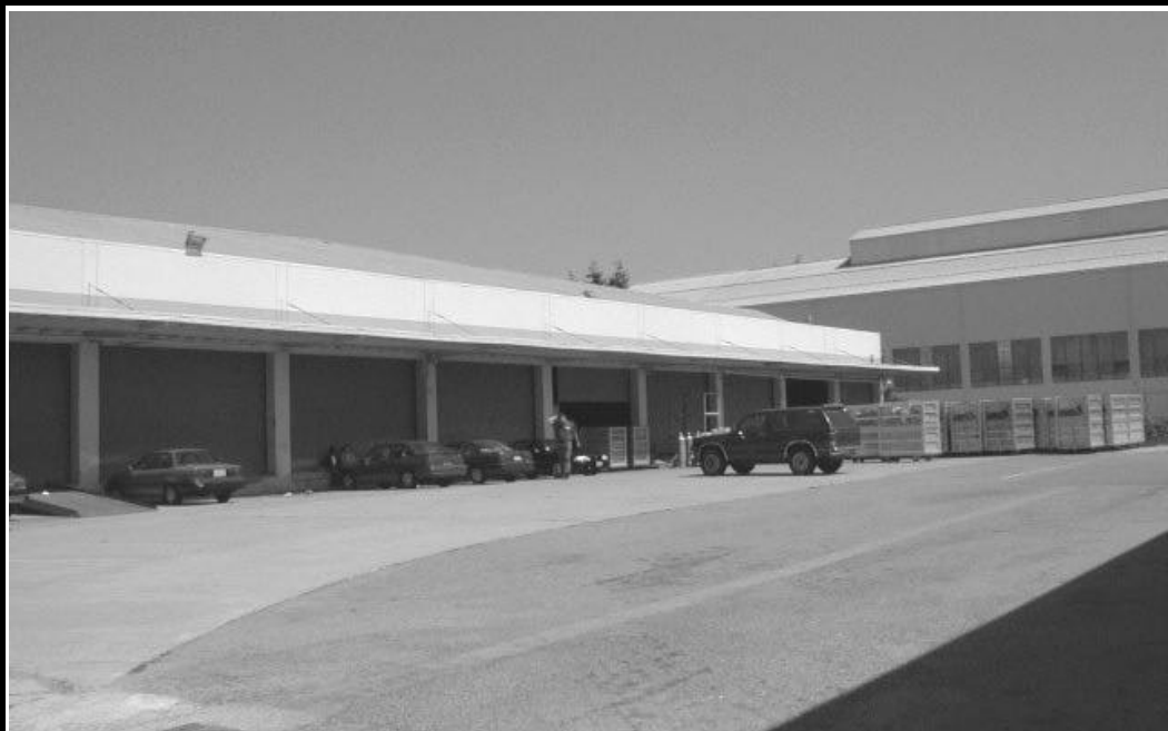
Photo C. On-Site View of South Face of Building.