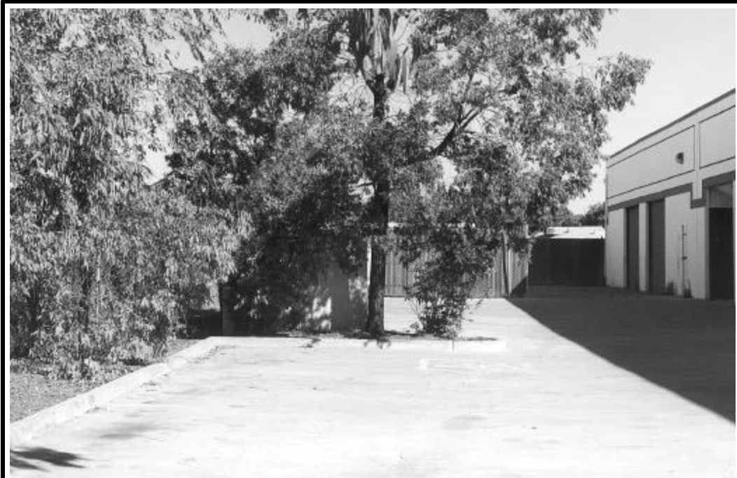
Photo B. Facing Northwest. The site has twenty-two parking spaces on the southwest side of the building. A dumpster is visible to the left of center behind the eucalyptus trees.