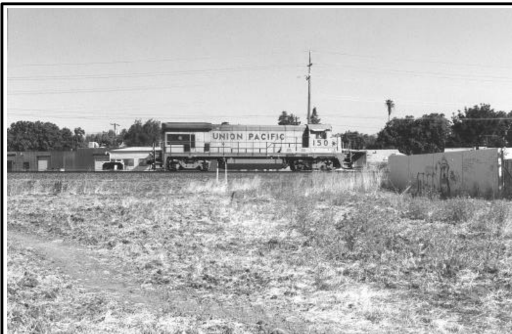
Photo E. Facing North. This vacant lot is adjacent to the site. Note the footpath through this site.