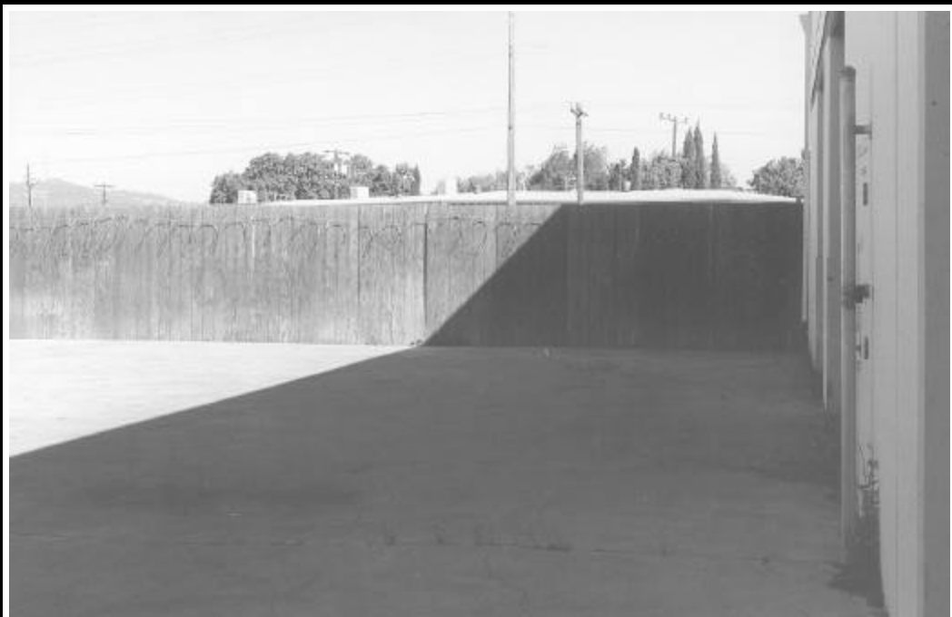
Photo D. Facing West. The back end of the property has an eight-foot tall wooden fence with barbed wires. The UP ROW is immediately behind the fence and Vaca Ridge is visible in the distance.