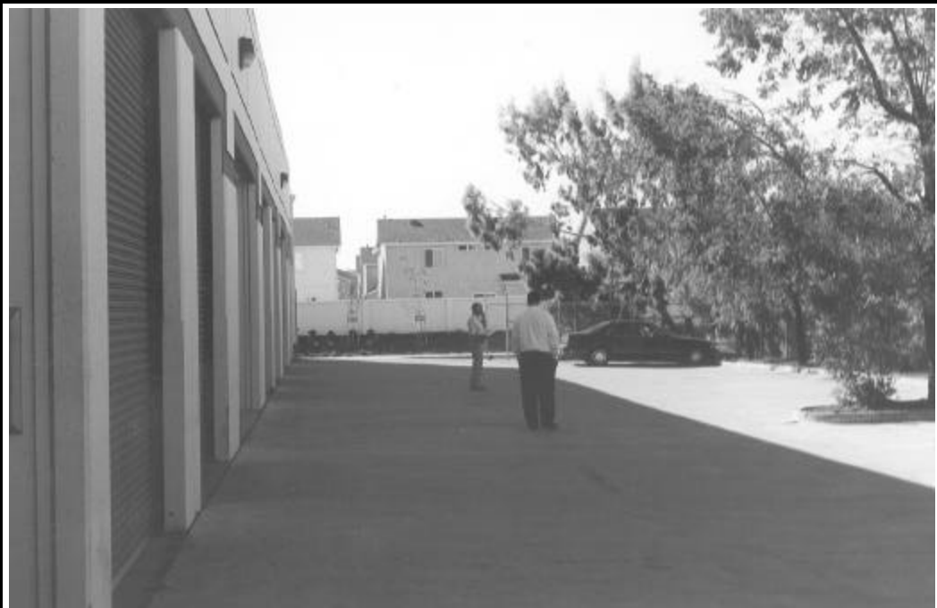
Photo C. Facing Southeast. Tapestry homes, a relatively new single-family home development, is visible in the background.