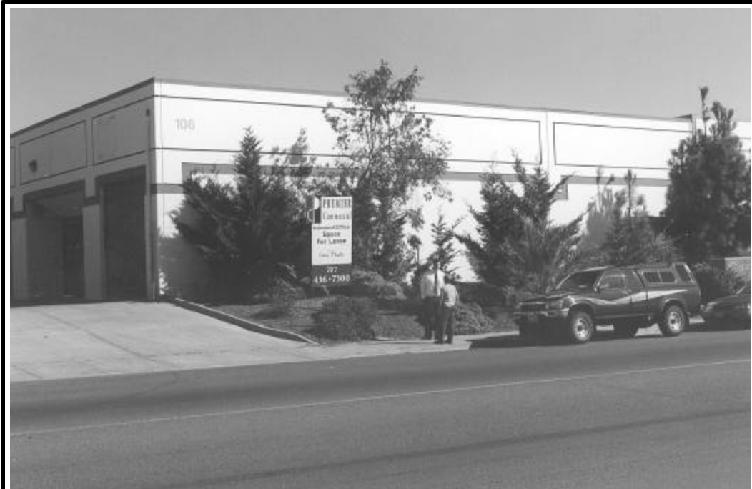
Photo A. Facing North. The proposed Fairfield ILA site.