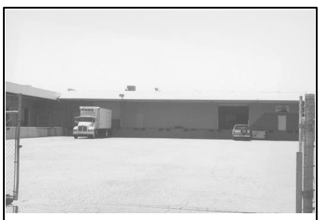
Photo B. View of Site Building. Note its current use as a packaging/distribution facility.