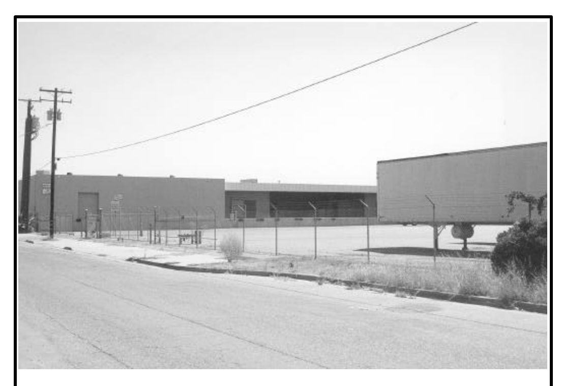
Photo A. Overall View of Site. Note that the site is fenced and there is light landscaping along W. Napa Anenue.