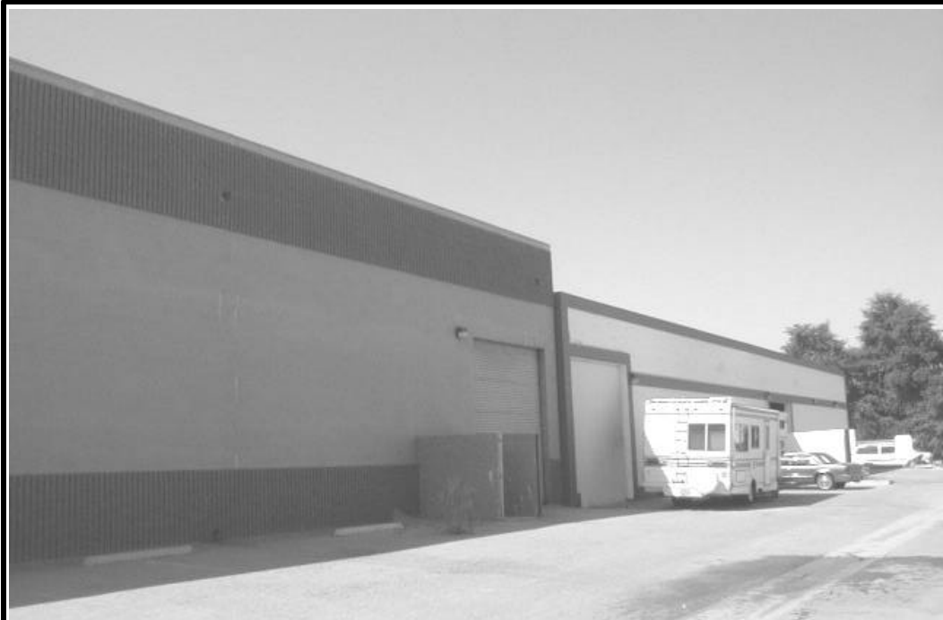
Photo B. North Face of Building. Building abuts adjacent use at the western edge of the property.