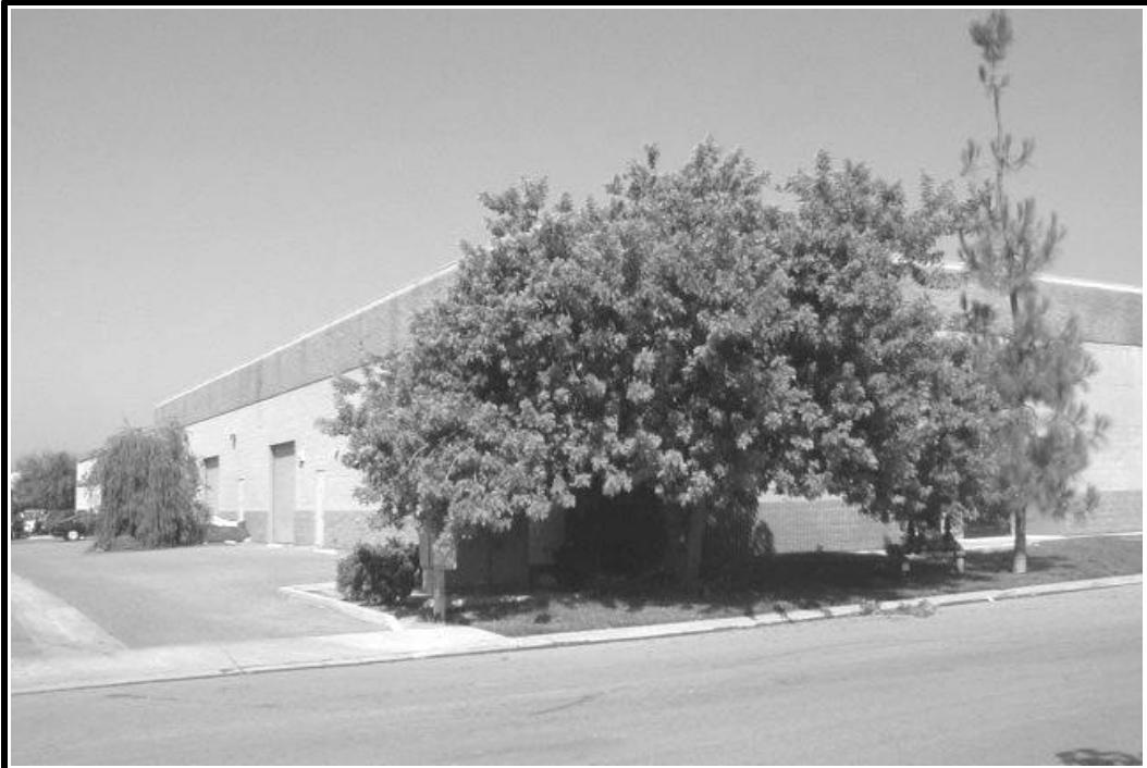
Photo C. South Face of Building.