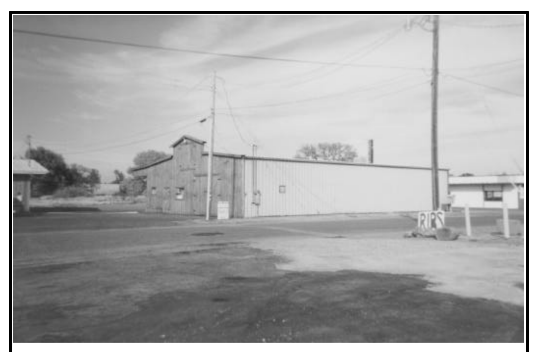
Photo A. View of Proposed ILA Site from Palo Cedro Inn (Restaurant) Facing Northeast (Approximately 110 Feet from Site). Note commercial business east and west of site.