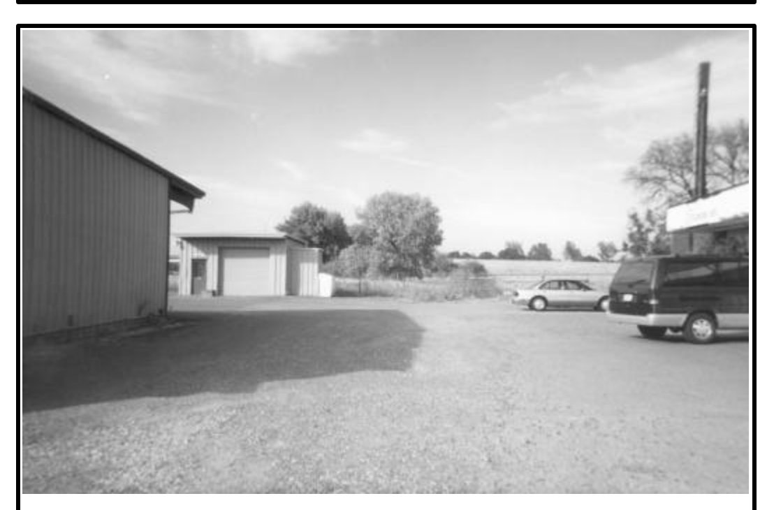
Photo D. View of East Side of Proposed ILA Site from Southeast Corner Facing North. Note small building is on north end of site and the commercial business east of the site.