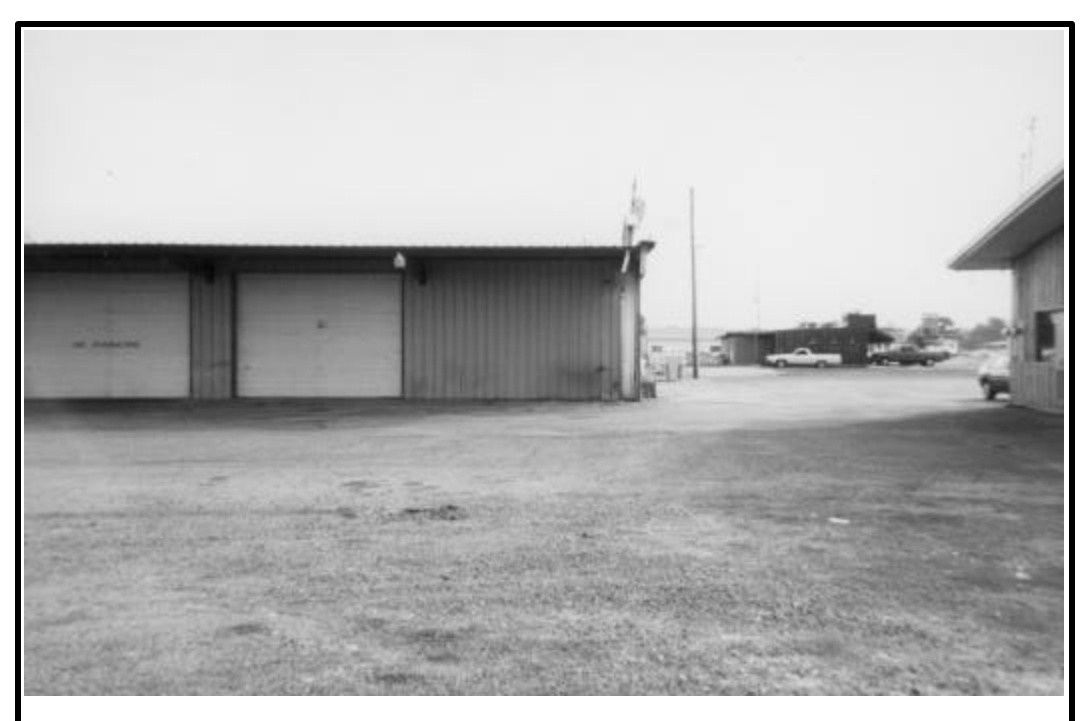
Photo B. View of Proposed ILA Site from Northwest Corner of Site Facing South. Note Palo Cedro Inn across Palo Way and The Cedar Tree Restaurant west of site (approximately 30 feet from site).