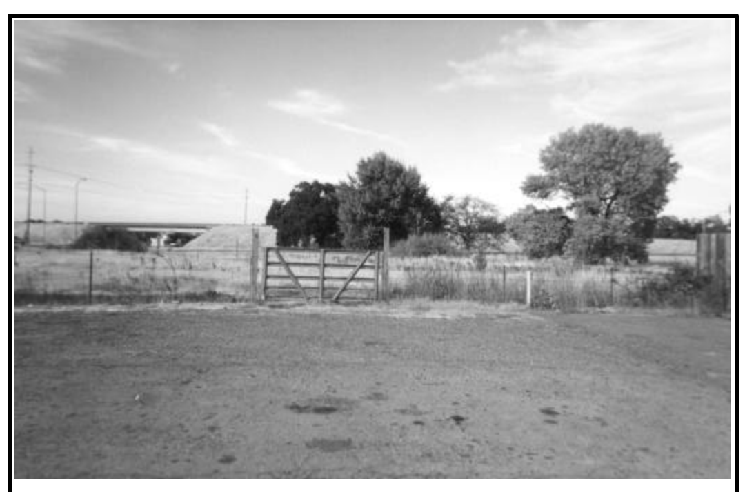
Photo C. View from On-Site Facing North. Parcel north of the site is vacant. Note Highway 44 overpass (over Deschutes Road) and Highway 44 on-ramp (eastbound).