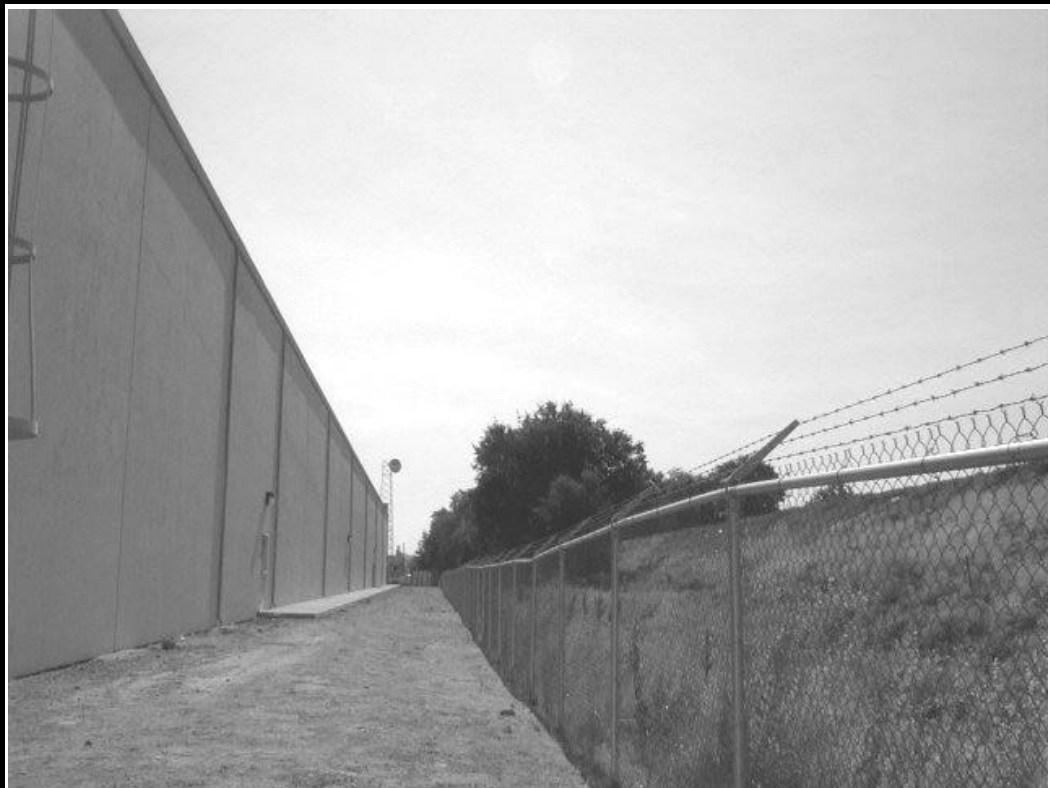
Photo A. South face of Building and Railroad Berm at Southern Boundary of Site.