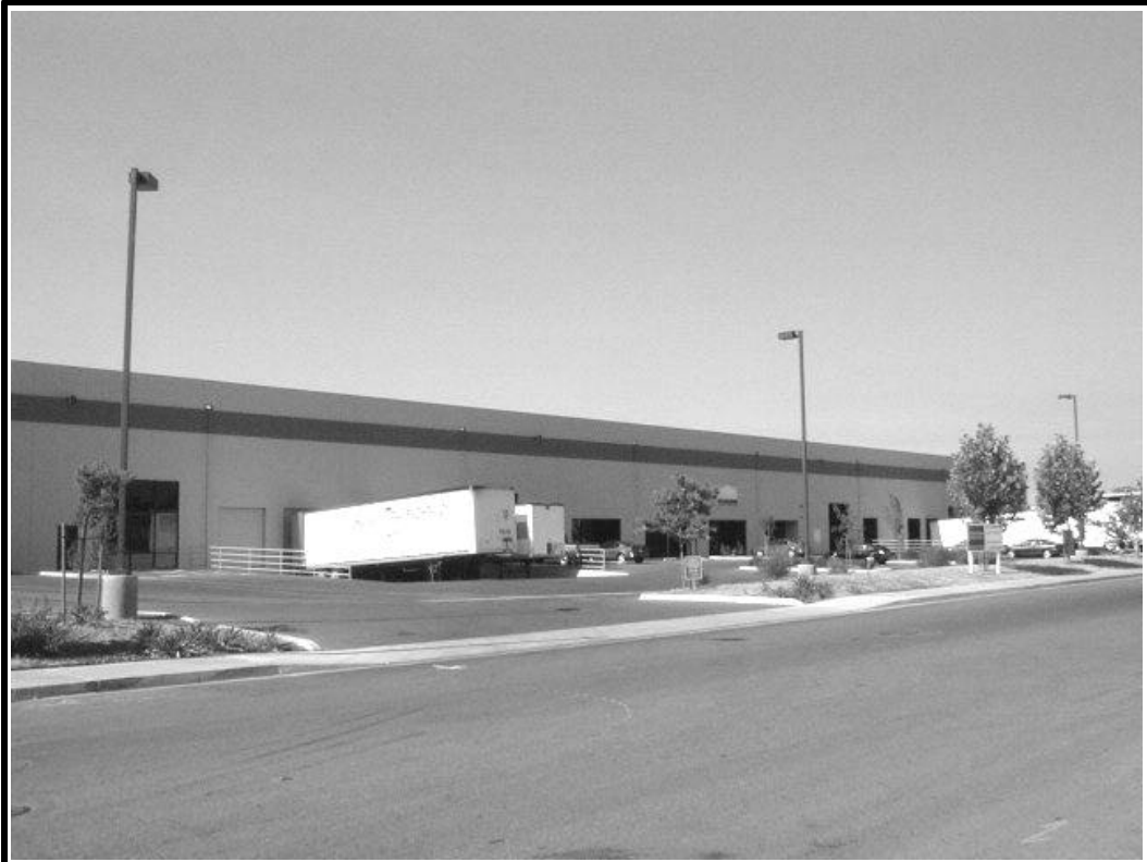
Photo C. View of North Face of Building Looking Southwest.