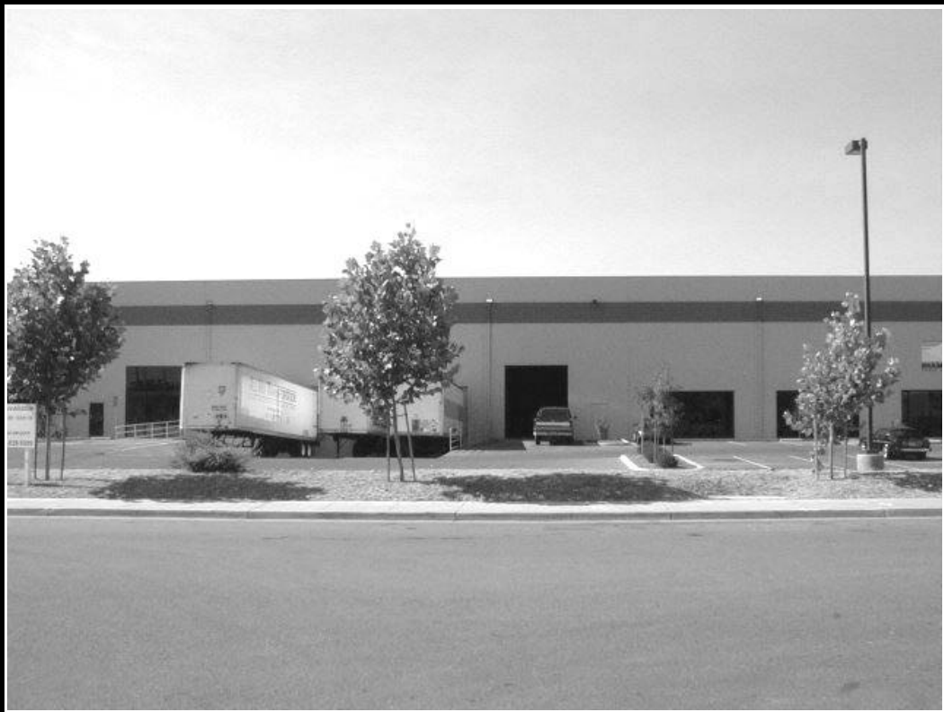
Photo B. Portion of the Building to be Occupied by Level 3.