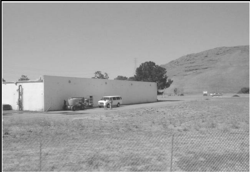
Photo E. North Face of Building, Proposed New Entrance Location