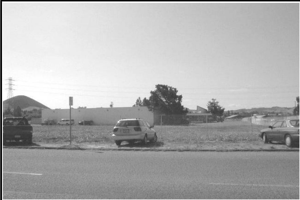
Photo C. Proposed Entrance Location on Capitolio Way.