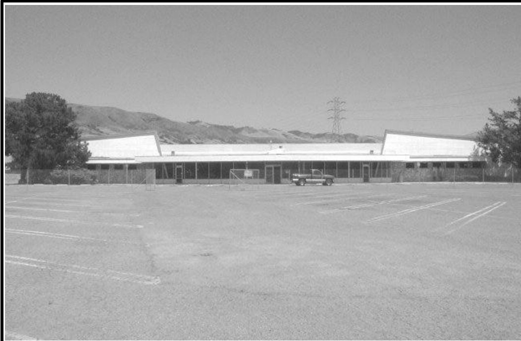
Photo A. View of West Face of Building.