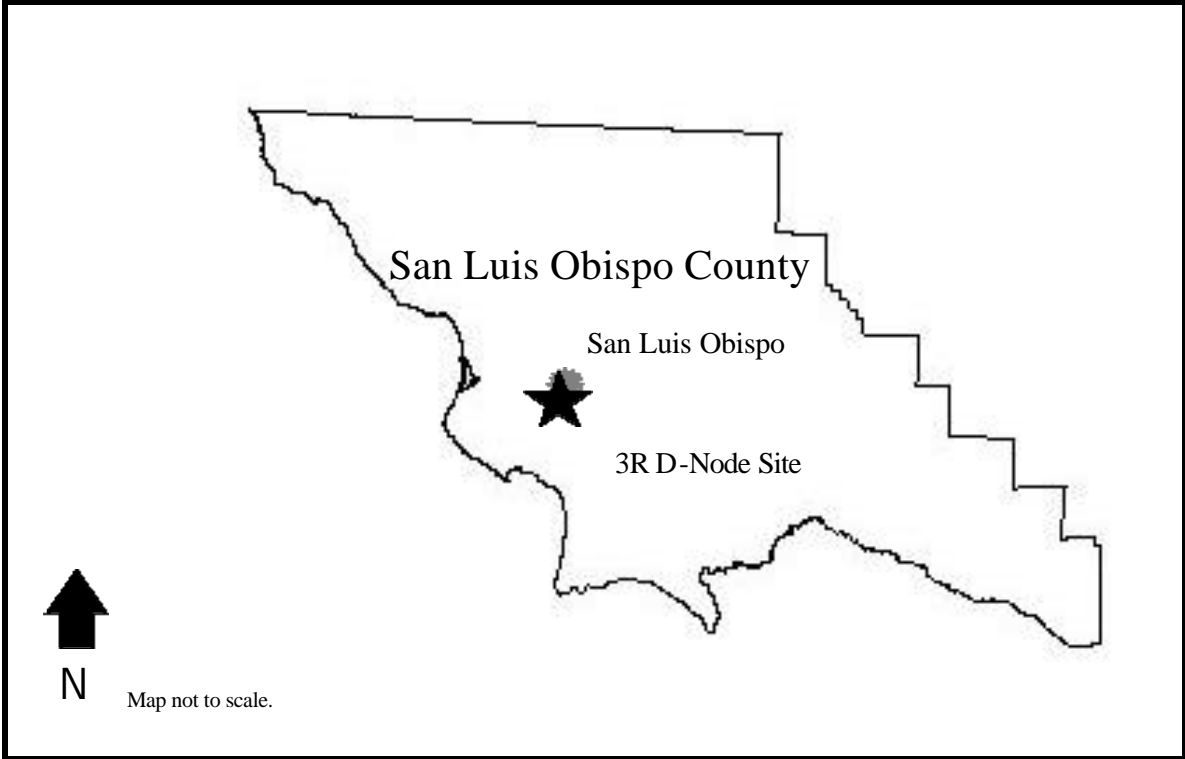
Figure 1. San Luis Obispo 3R D-Node Regional Map.