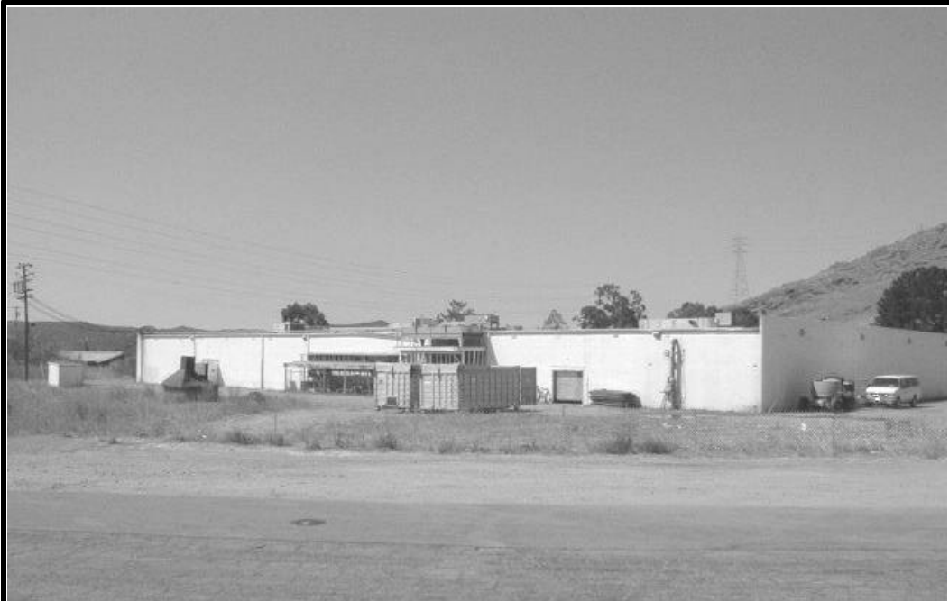
Photo B. View of East Face of Building.