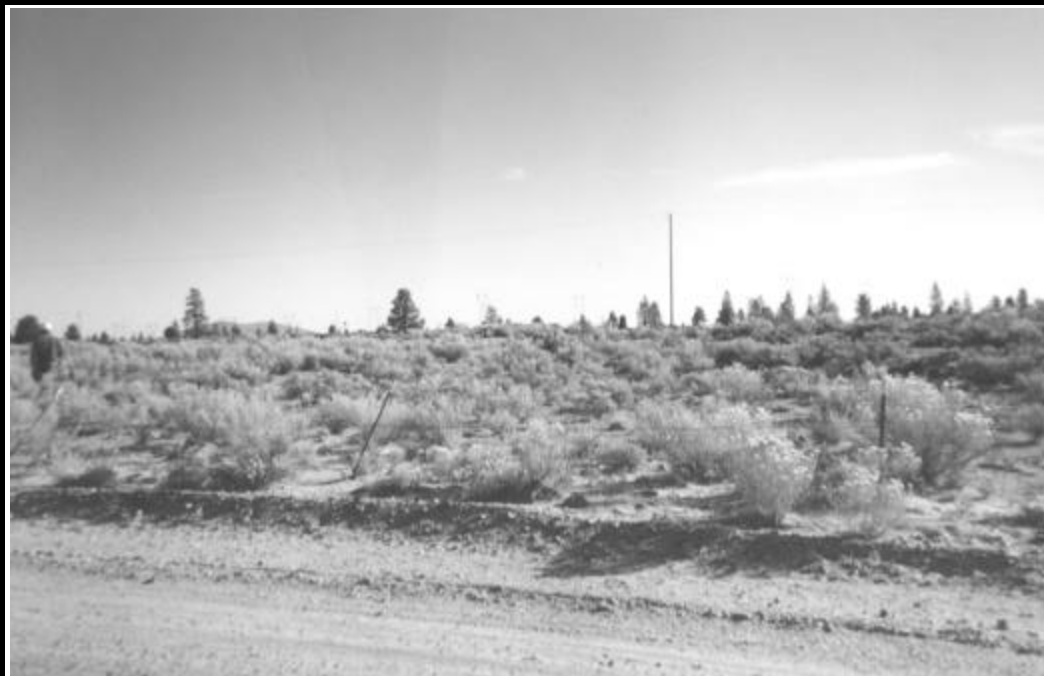
Photo C. The North-South Overhead Utility Lines run Adjacent to the BNSF Railroad Tracks Approximately 300 feet East of the Proposed 3R Site. Photo taken from southeast corner of site facing northeast.