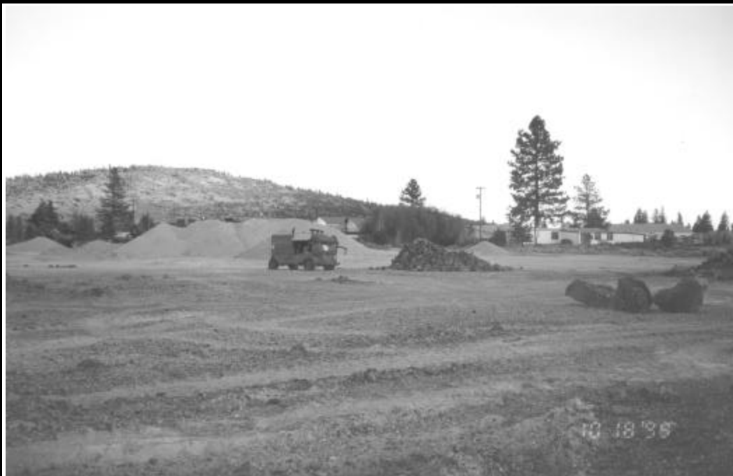
Photo F. View of Area South of Proposed 3R Site from Southwest Corner Facing Southeast. The office of Glass Mountain Pumice, Inc. shows in the right of the photo, located approximately 500 feet south of the site.