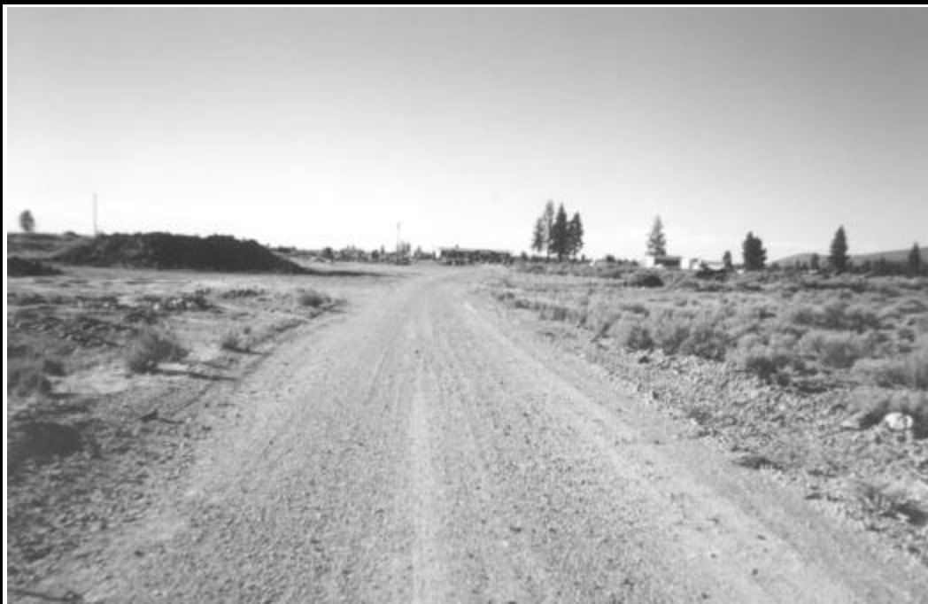
Photo E. View of Residence from Southwest Corner of Proposed 3R Site Facing South. This is the only residence in the area and is located approximately 700 feet from the site.