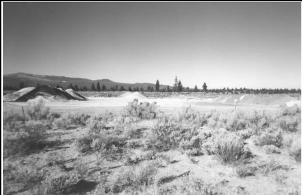
Photo B. View of Proposed 3R Site from Approximately 100 feet East of Site. Northern and southern site property lines are just outside the right and left edges of the photograph, respectively.