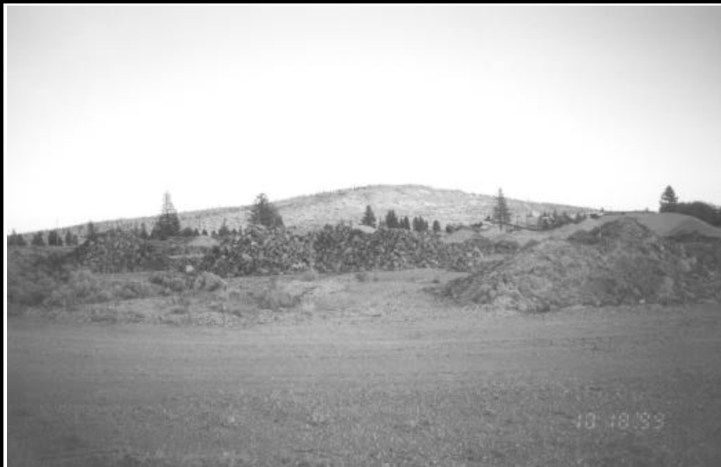
Photo D. View of Proposed 3R Site from Outside Northwest Corner of Site Facing East. Photo shows mounds of pumice processing material within the site beyond the north-south segment of access road (leading to residence).