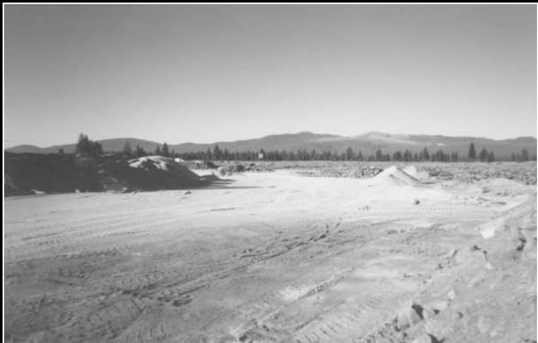
Photo A. View of Proposed 3R Site from Northeast Corner Facing Southwest. Note mounds of pumice processing related materials within site.