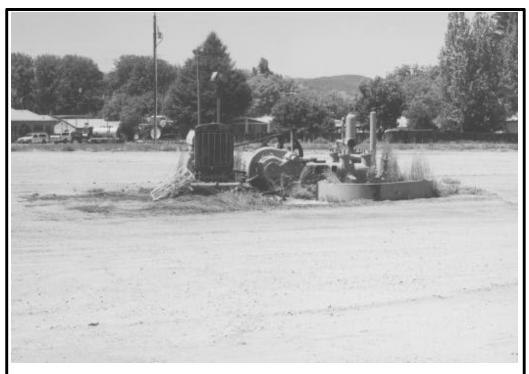
Photo D. On-Site Water Pump and Equipment. Photo taken from eastern edge of site facing southwest. Note that the pump is no longer in use.