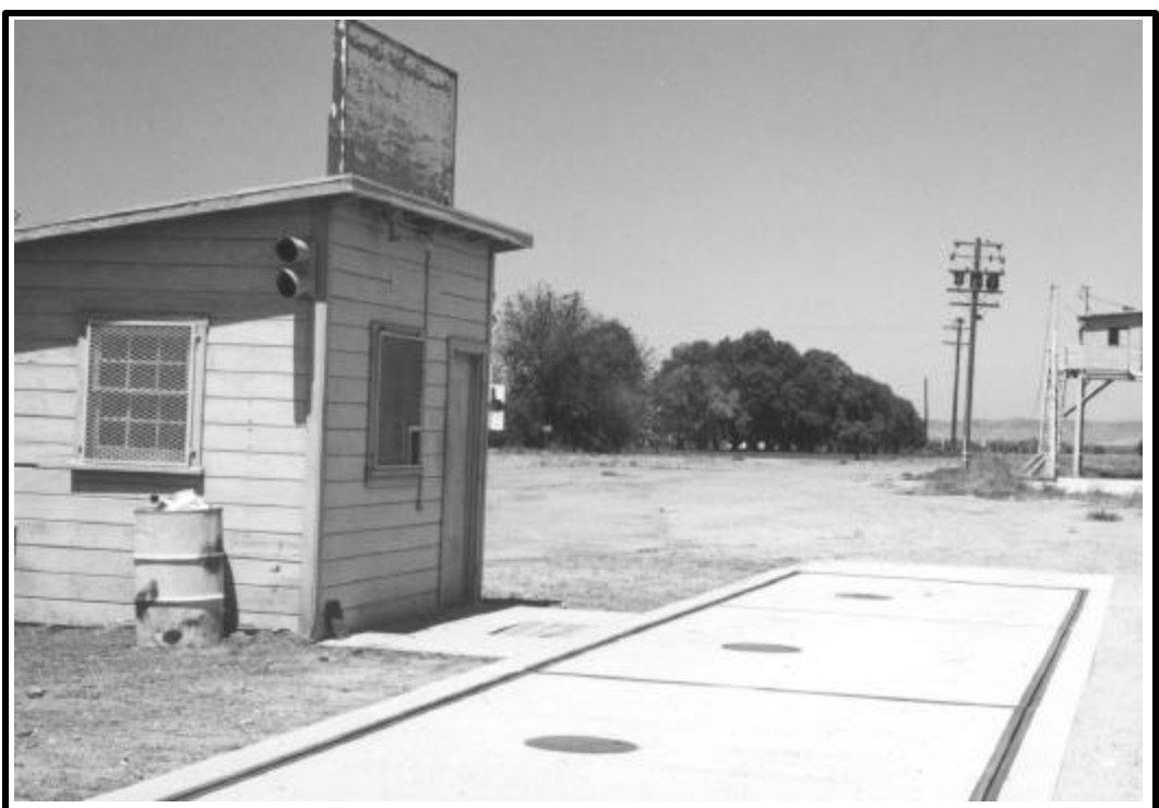
Photo B. Existing Structures On Site. Photo taken from eastern boundary facing northwest. Note the vacant building and truck scale in the foreground, and loading platform and overhead powerlines further northwest.