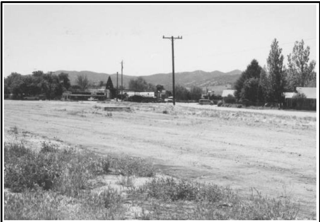
Photo A. Overall View of Site. Photo taken from northeast corner of site facing south. Note the overhead powerlines along Cattlemen Road and residential uses to southwest.