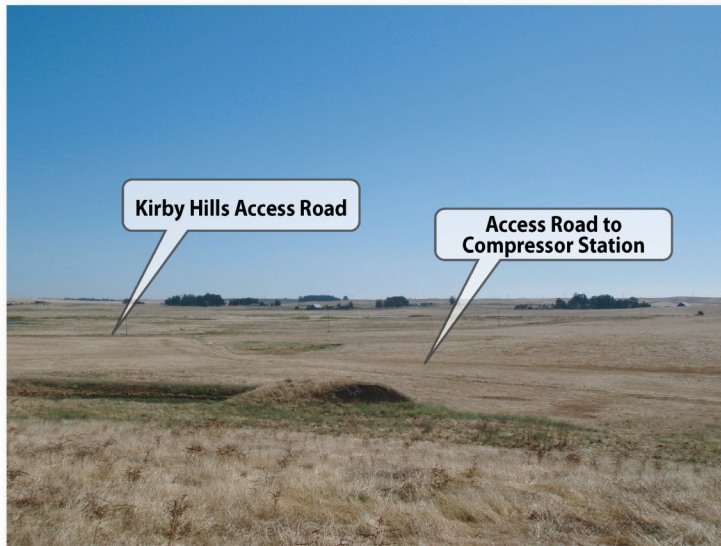
Compressor Station Access Road (Photo Looking East)