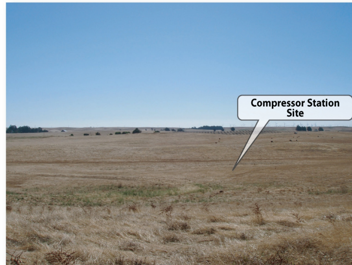
Proposed Station Site (Photo Looking East Towards Shiloh Road)