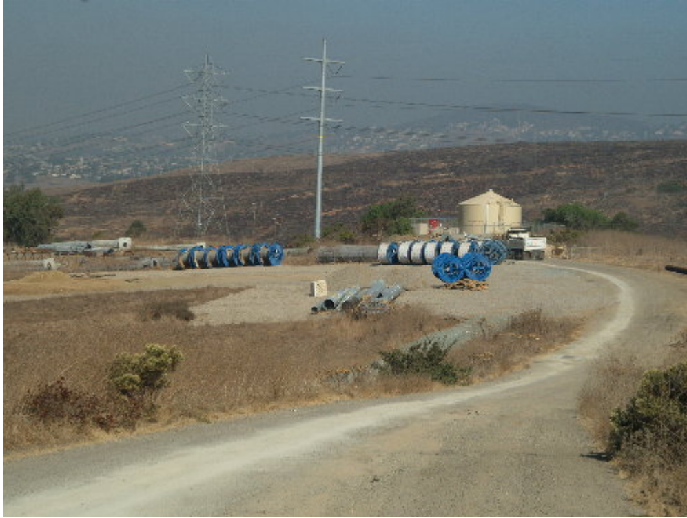
Figure 1 – DCX is placing excess spoils in the laydown area at the Miguel Substation (note the tan material on the far left of the frame).