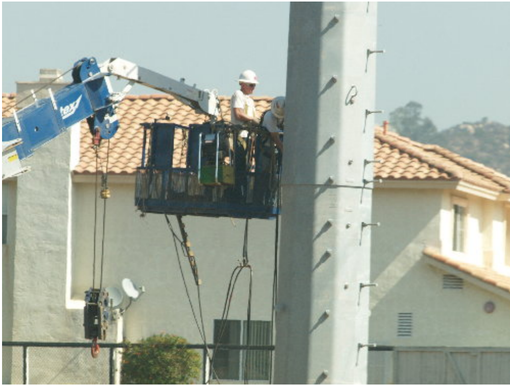
Figure 3 – A Wilson crew worked to secure the tower sections adjacent to the Herrick Center.