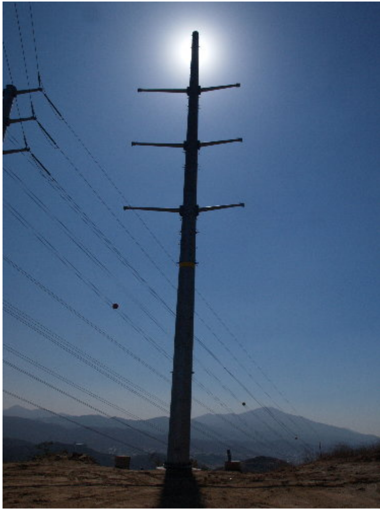
Figure 2 – Wilson has set several steel poles on the foundations completed recently by Tri-State Drilling, including Pole 58 (pictured).