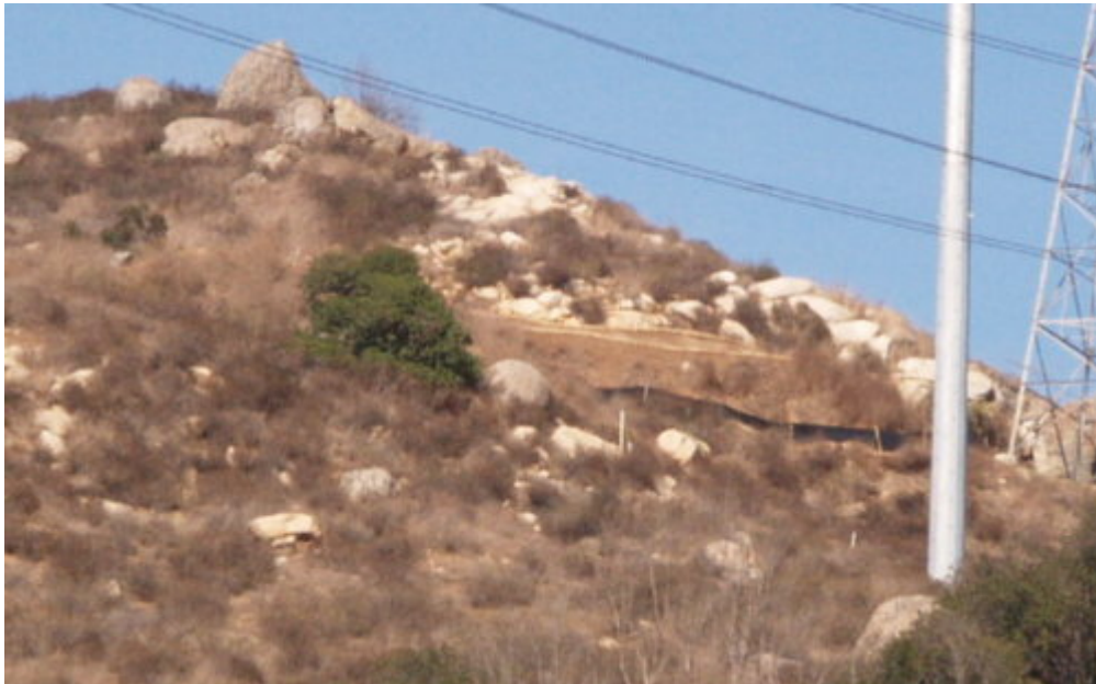
Figure 4 – The temporary BMPs have been placed at Tower Site 39 following the recontouring of the site.