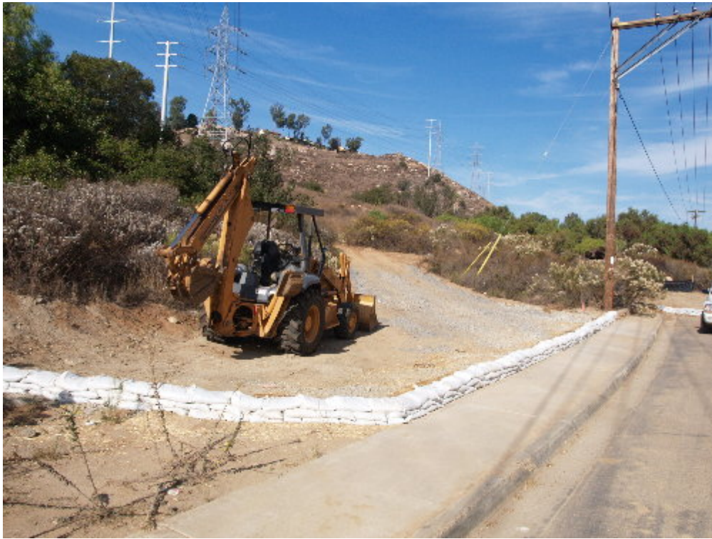
Figure 3 – A crew worked to place, maintain, and improve BMPs on the project.