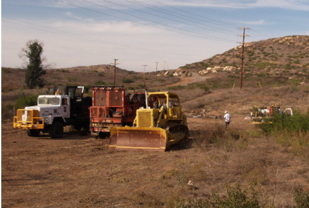
Figure 1 – The reel trucks were staged in the approved stringing site east of La Cresta during the sagging operation.