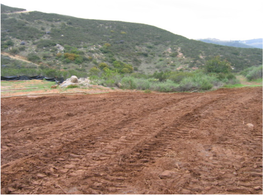
Figure 1 – A snub site used by Wilson crews near Structure 52 has been recompacted and erosion control measures have been installed.