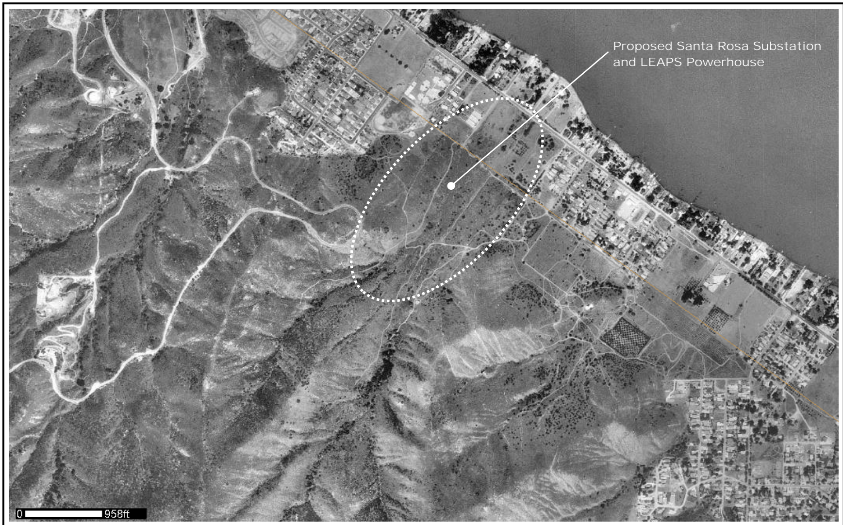
Figure 4.3.1-2. Aerial Photographs (3 of 6) Proposed Santa Rosa Substation and LEAPS Powerhouse and Vicinity