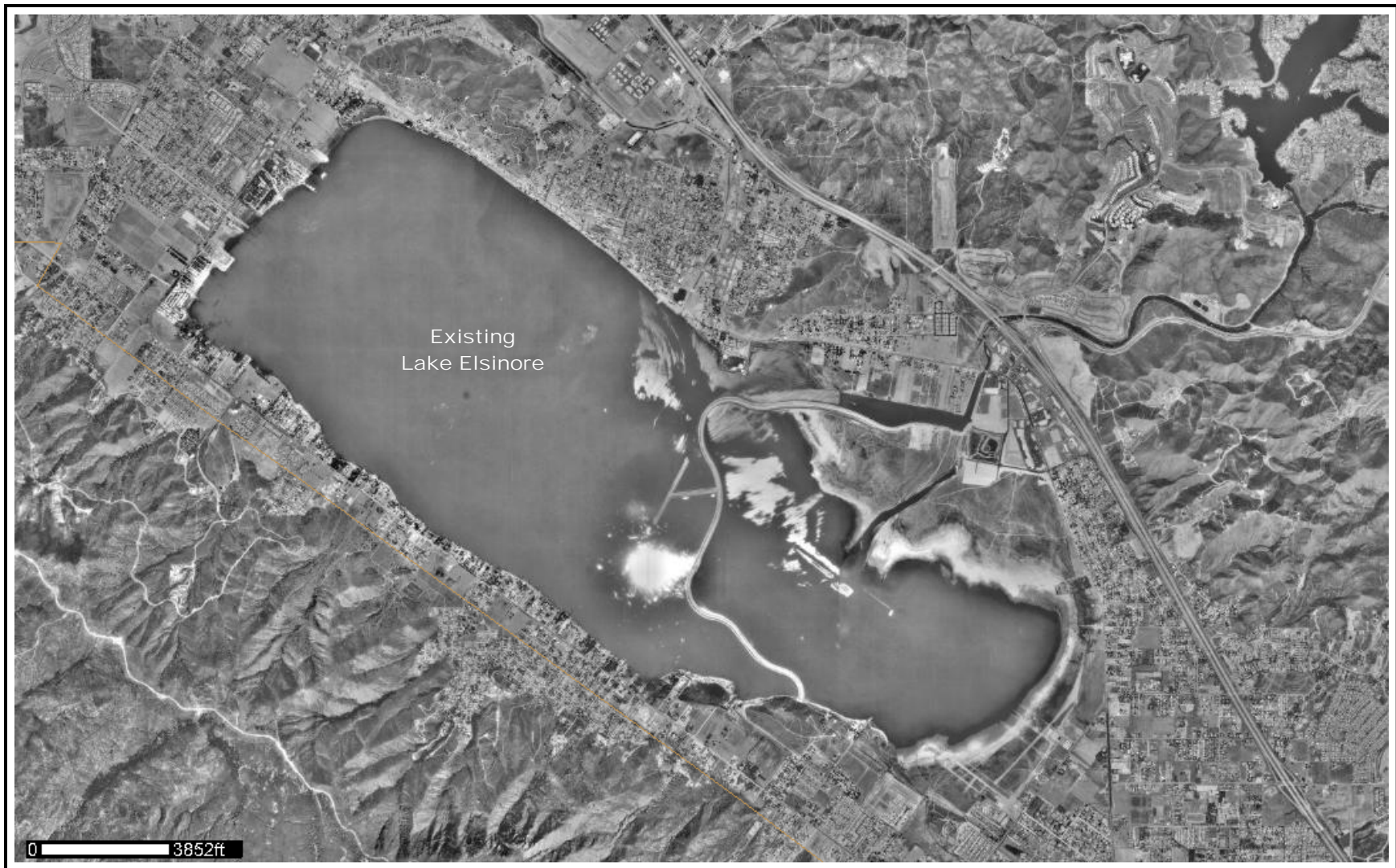
Figure 4.3.1-2. Aerial Photographs (2 of 6) Proposed LEAPS Lower Reservoir (Lake Elsinore) and Vicinity