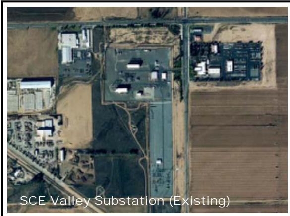
Figure 4.3.1-2. Aerial Photographs (6 of 6) Talega, Escondido, Serrano, and Valley Substations and Vicinities