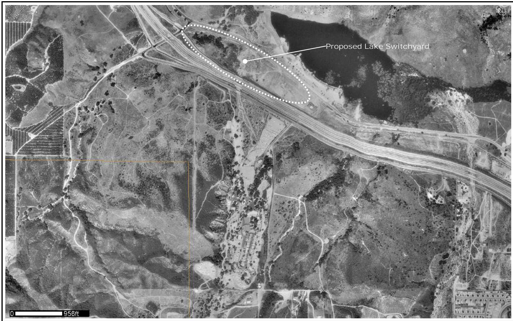
Figure 4.3.1-2. Aerial Photographs (1 of 6) Proposed Lake Switchyard and Vicinity