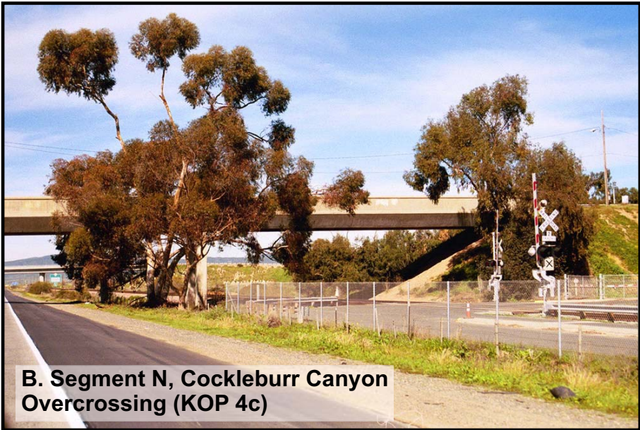
B. Segment N, Cocklebur Canyon Overcrossing (KOP 4c)