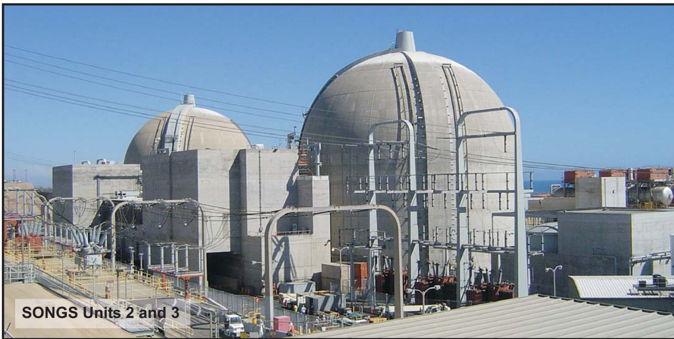
SONGS Units 2 and 3