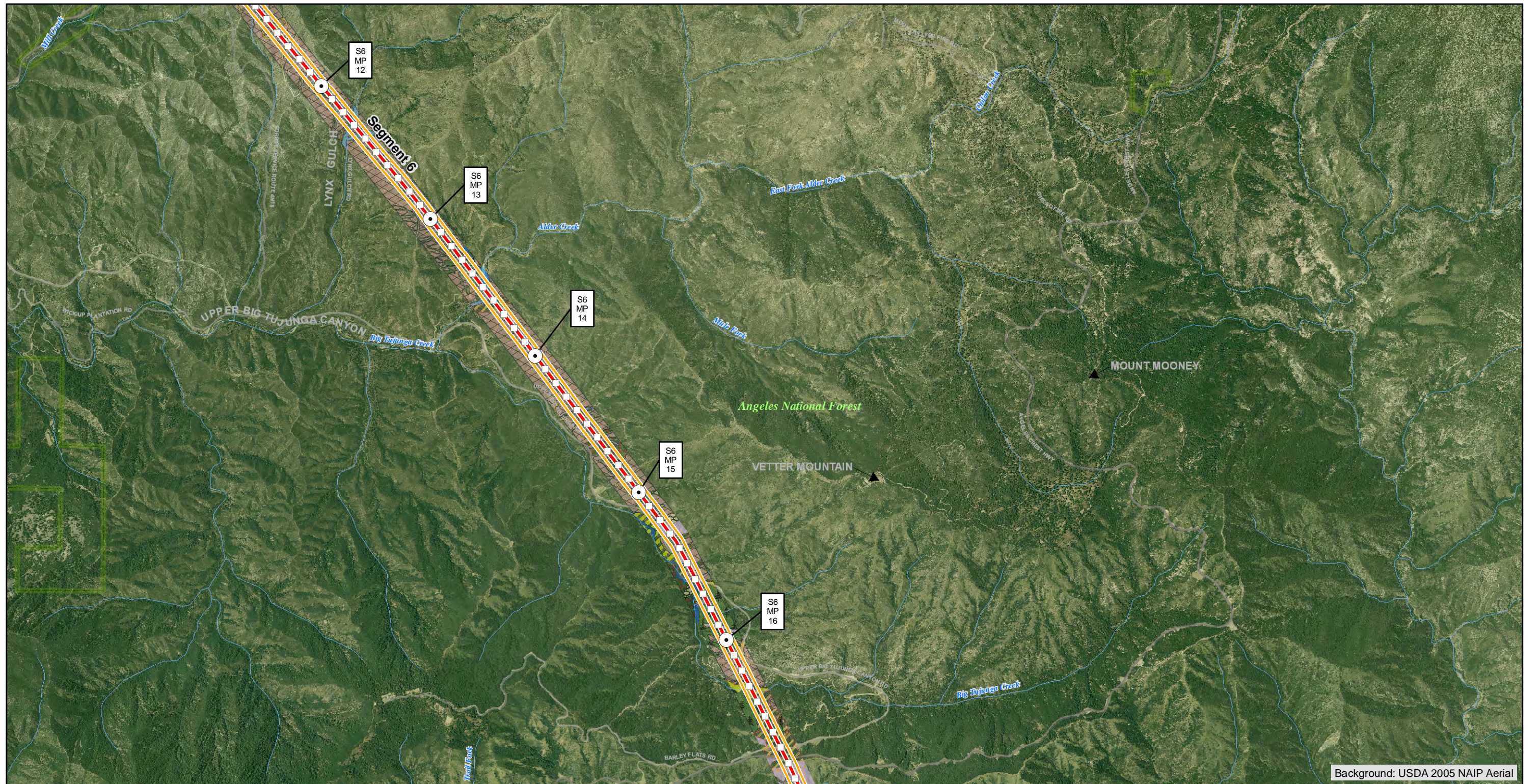
Background: USDA 2005 NAIP Aerial